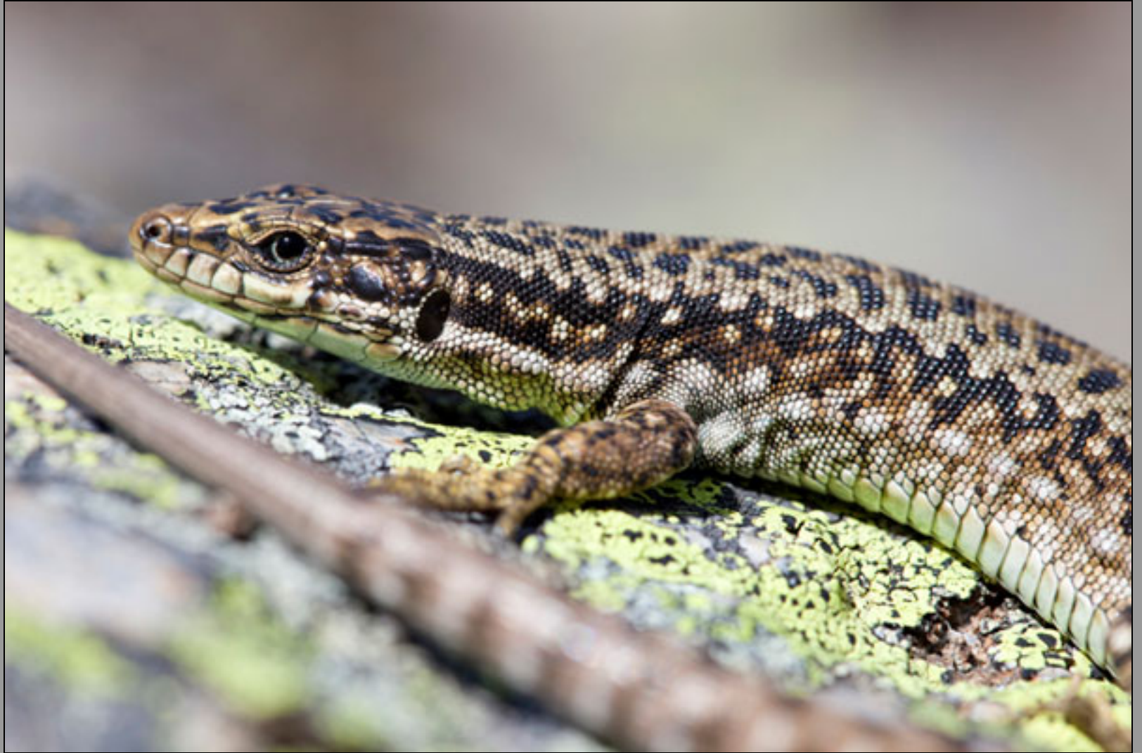
Iberolacerta cyreni castiliana