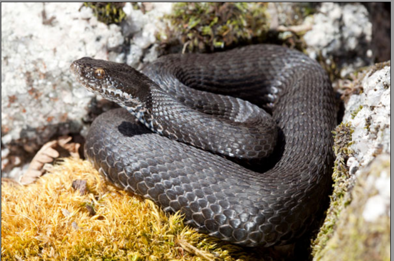
Vipera seoanei cantabrica , melanistic

SIERRA DE GREDOS (Spain) : T° : 6°c night