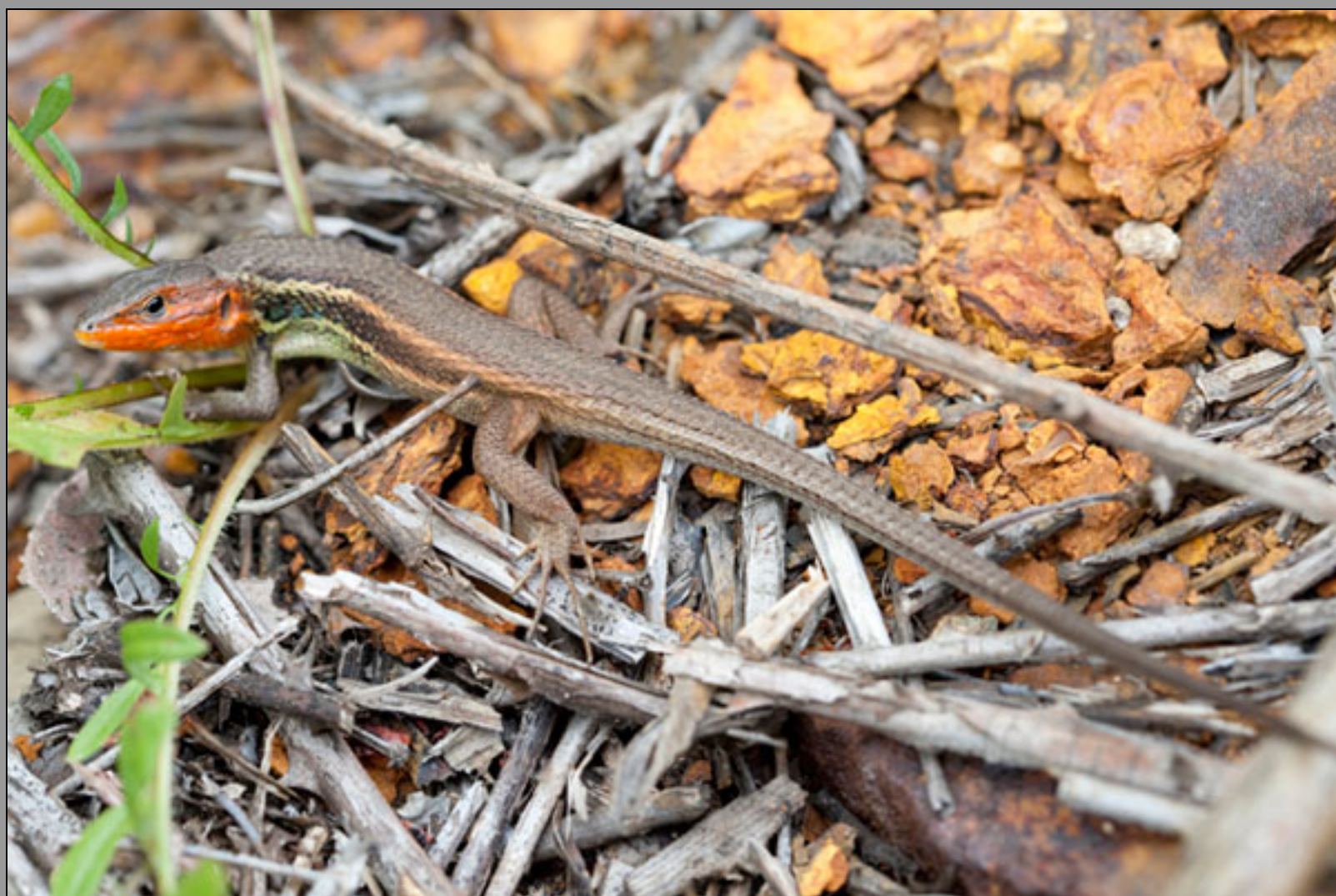
Psammodromus algirus , male