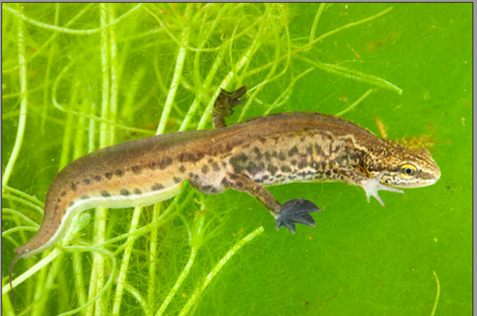
Lissotriton helveticus alonsoi , male