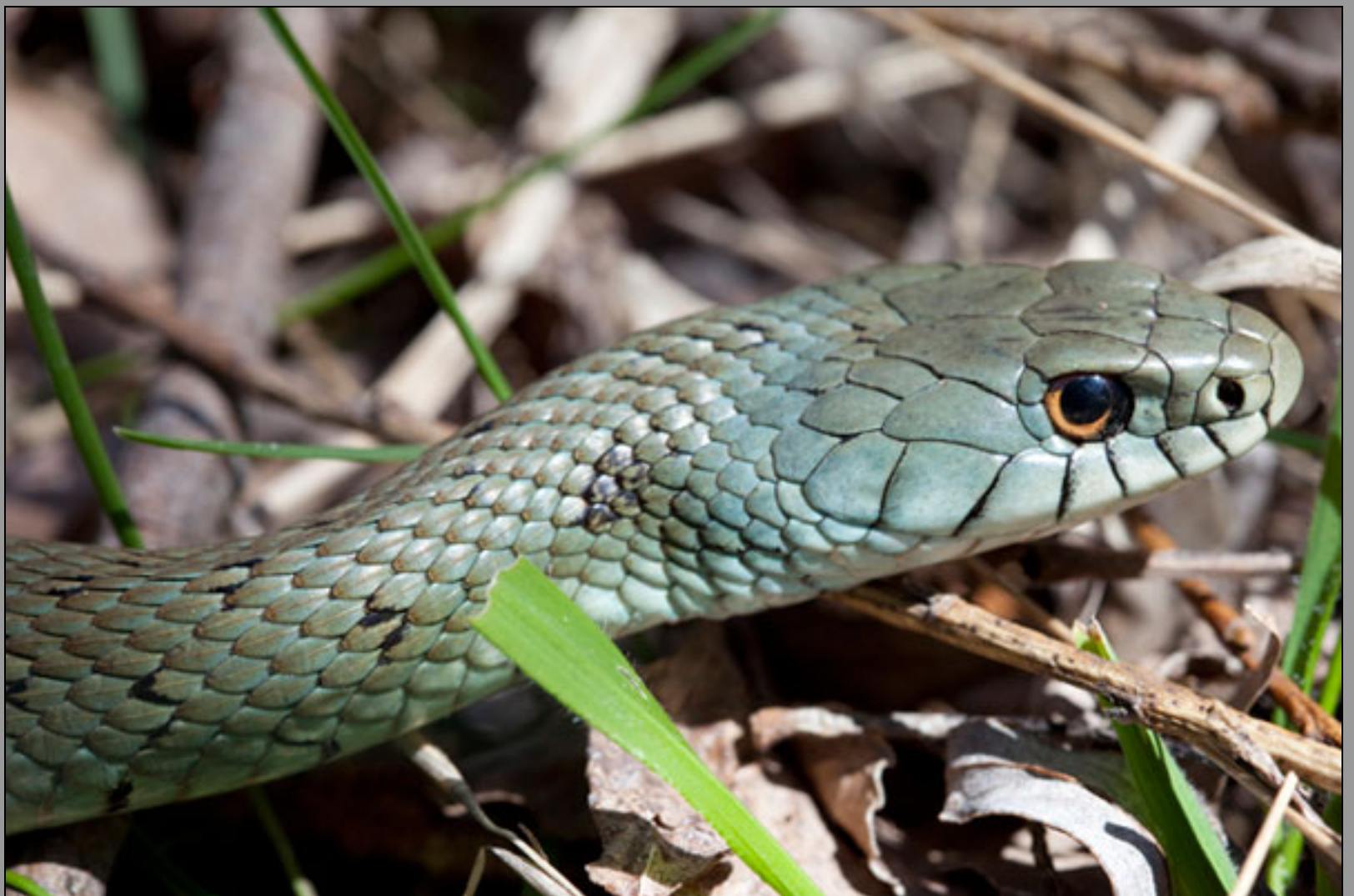
Natrix natrix astreptophora