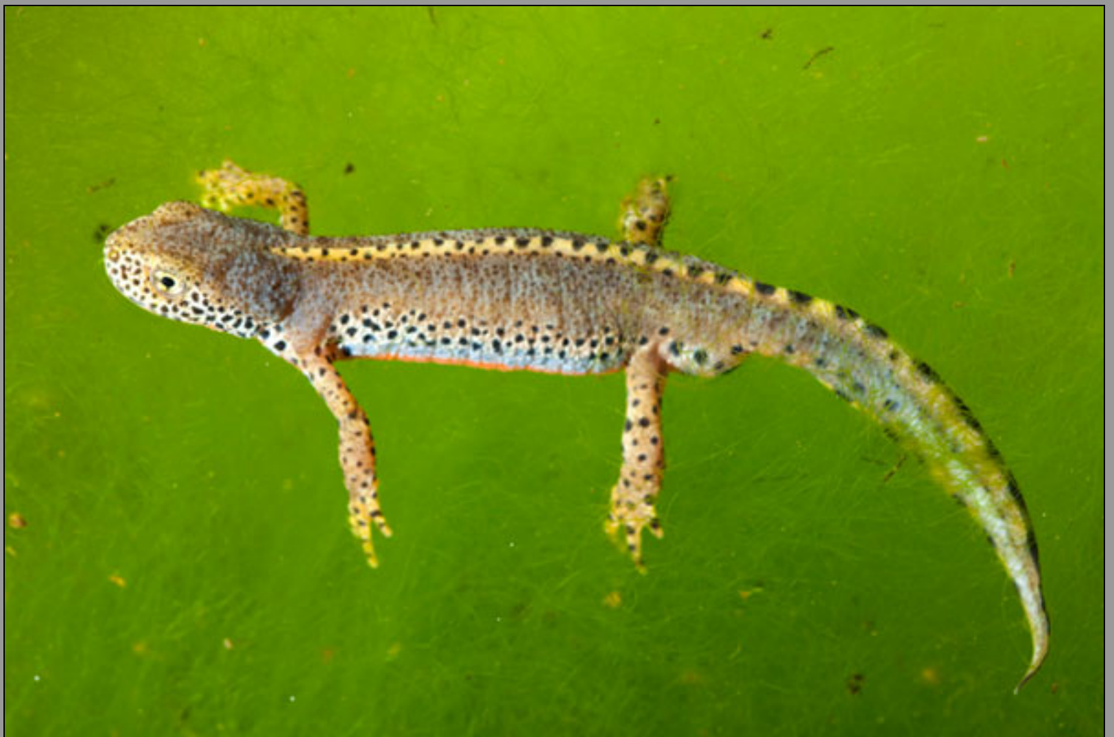
Ichthyosaura alpestris cyreni , male