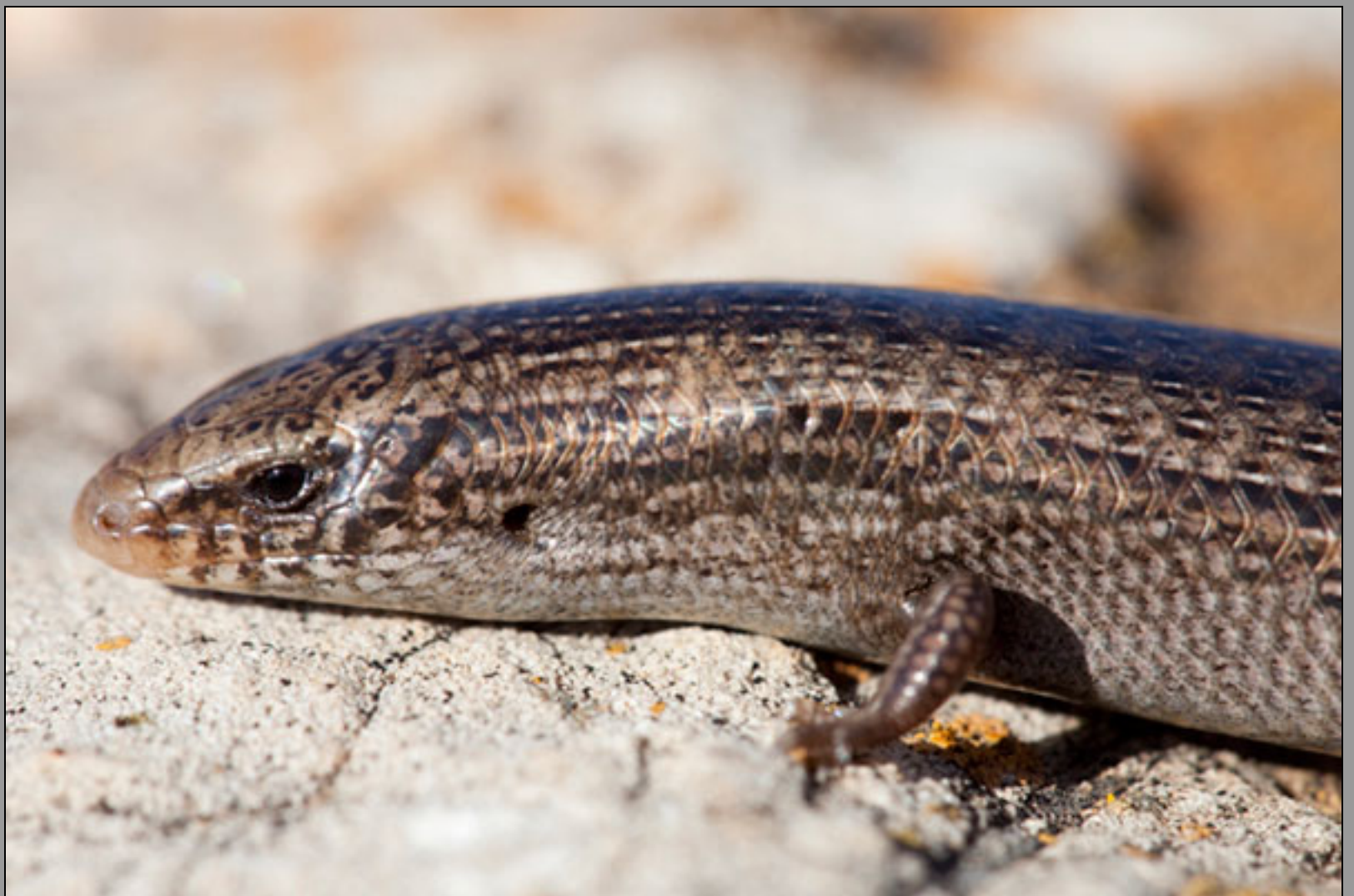
Chalcides bedriagae bedriagae