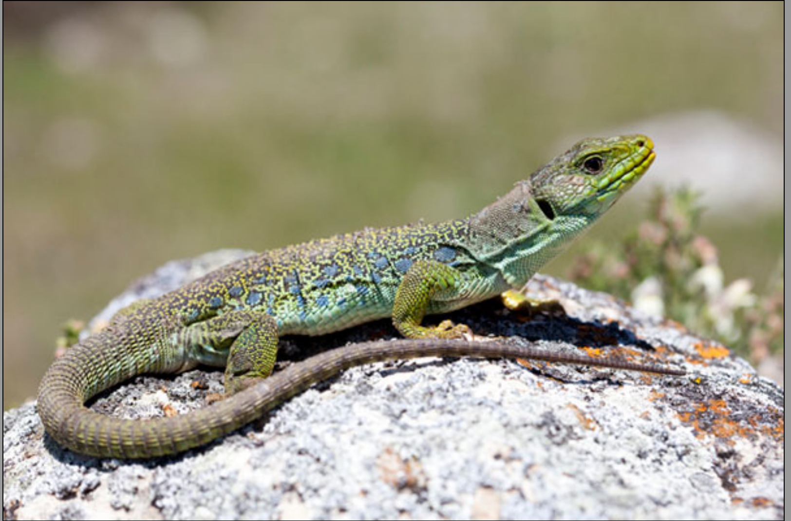
Timon lepidus , female