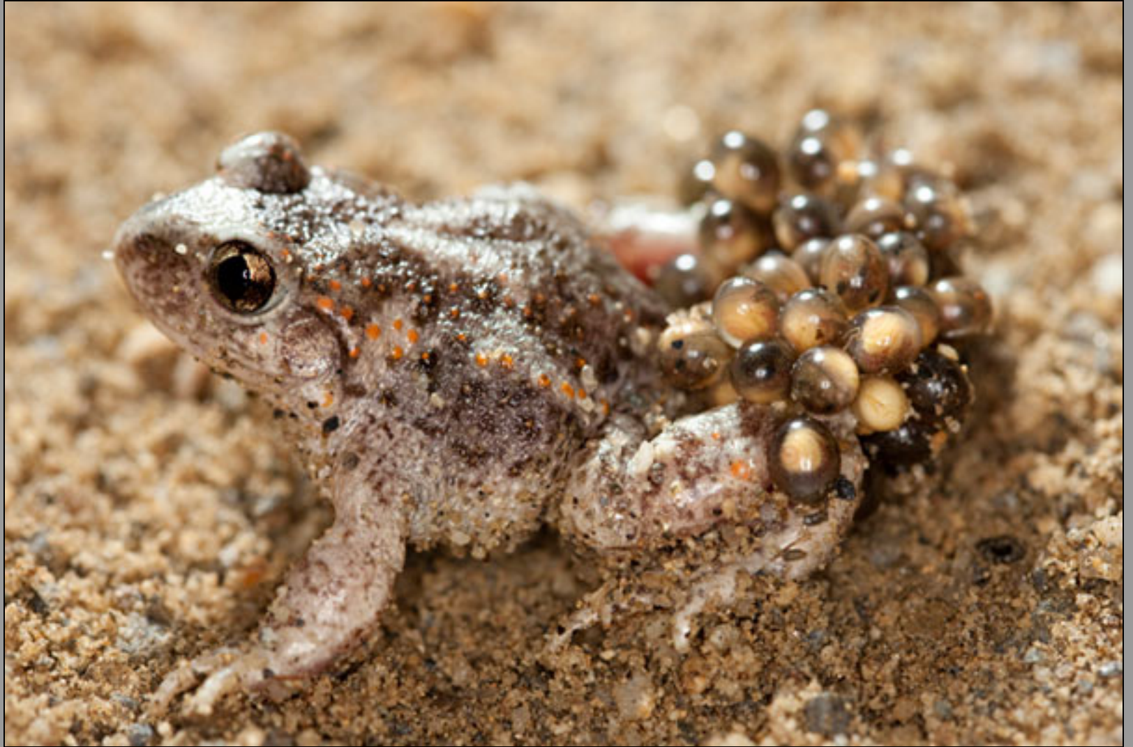
Alytes obstetricans boscai