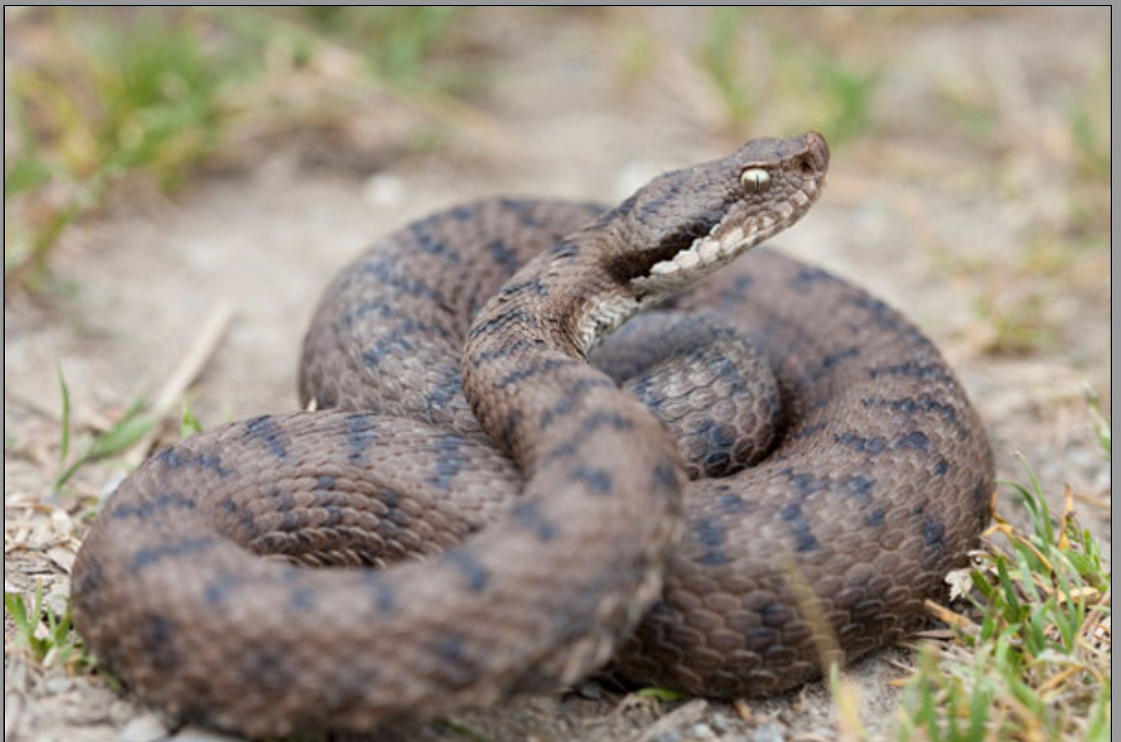
Vipera aspis aspis