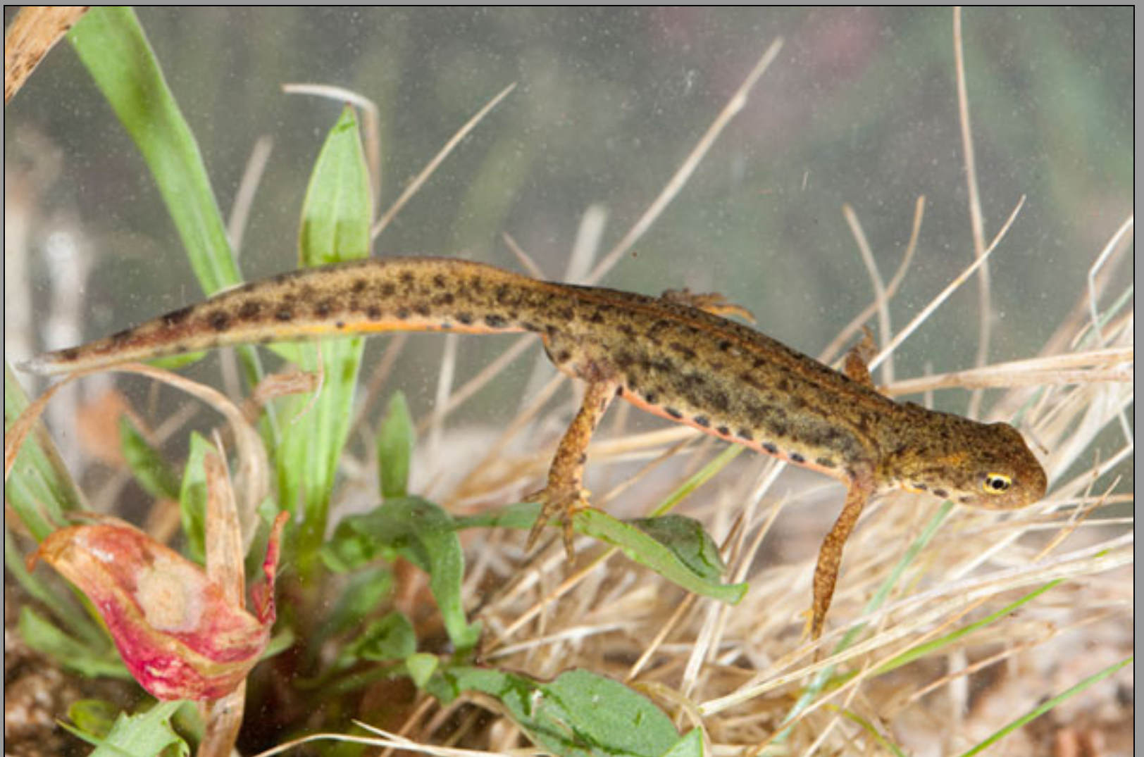
Lissotriton boscai , male