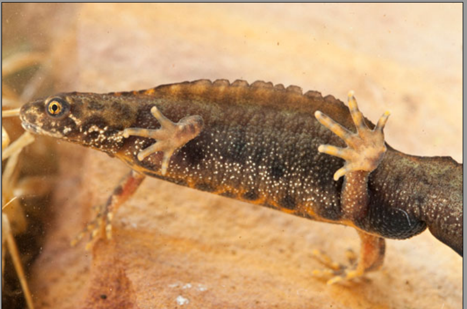
Triturus blasii , hybrid Triturus marmoratus x Triturus cristatus , male