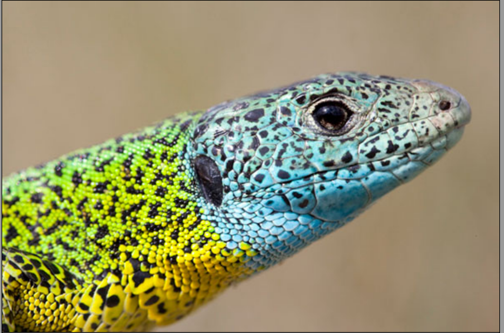
Lacerta schreiberi , male