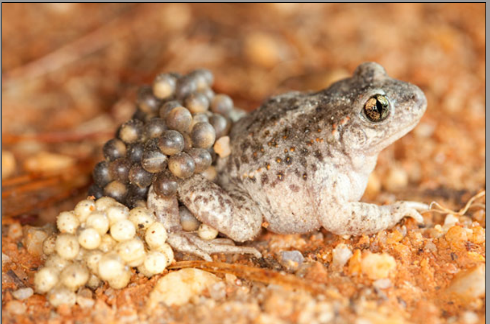
Alytes obstetricans boscai , a brave male with two different laying...