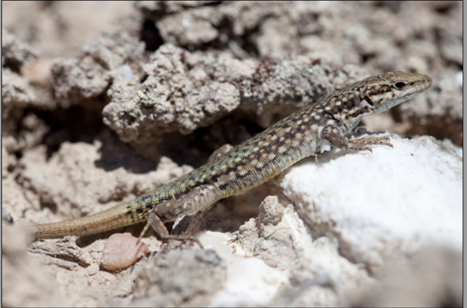
Podarcis liolepis liolepis