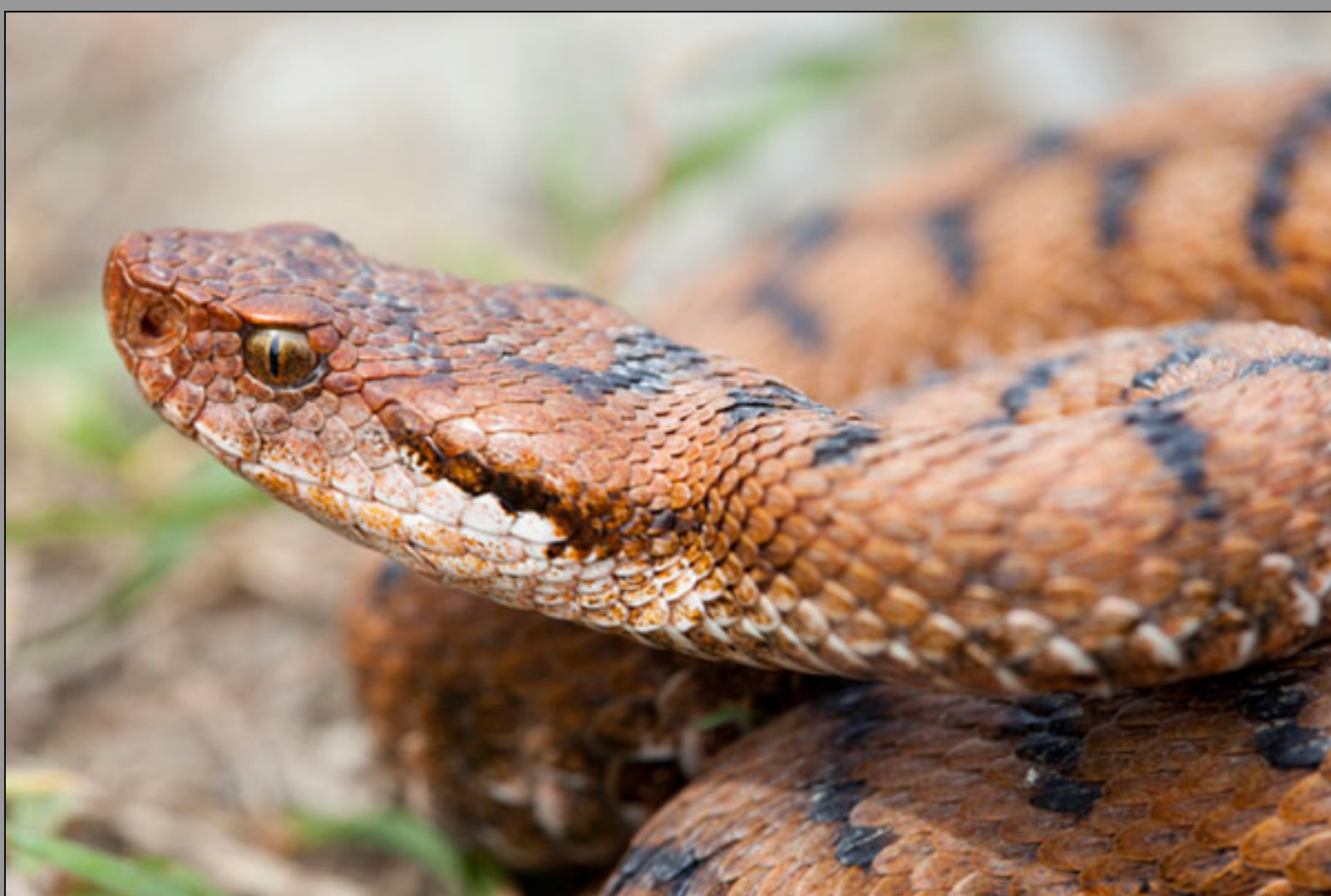
Vipera aspis aspis