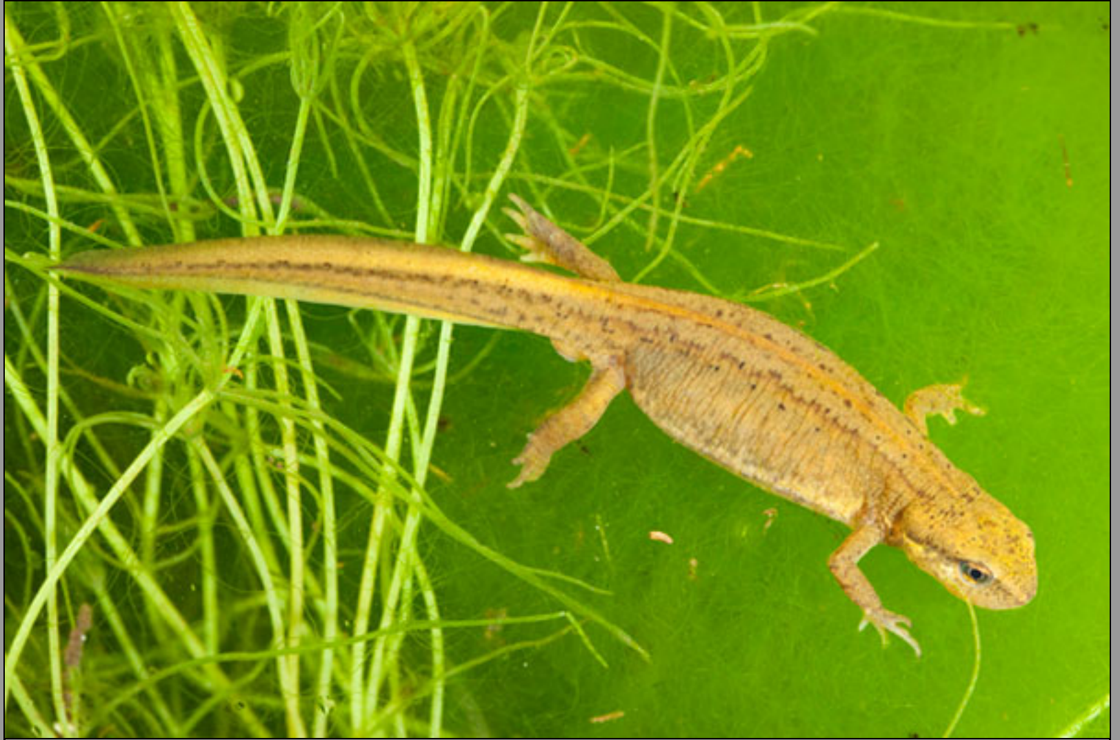
Lissotriton helveticus alonsoi , female