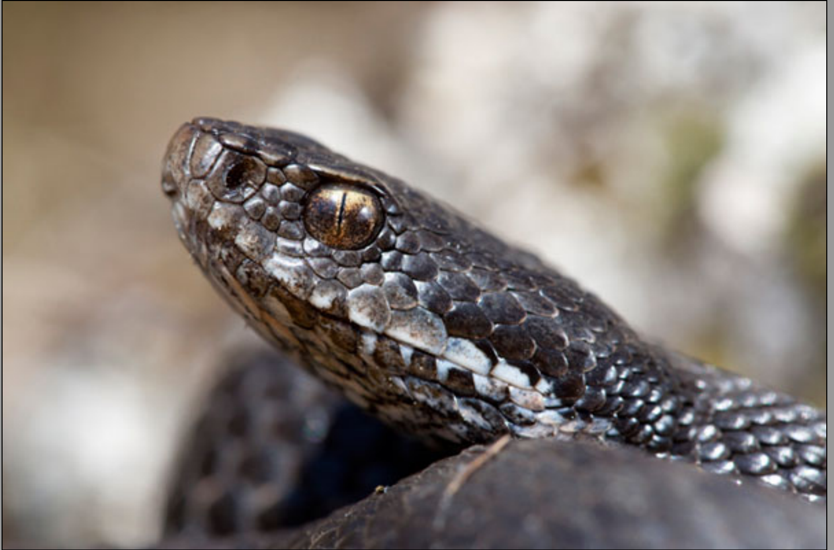
Vipera seoanei cantabrica , melanistic