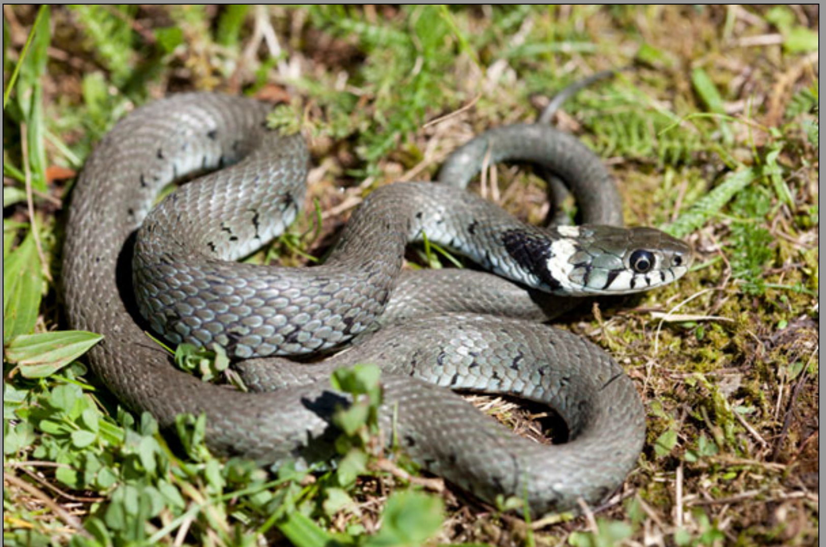
Natrix natrix helvetica , ... and the male