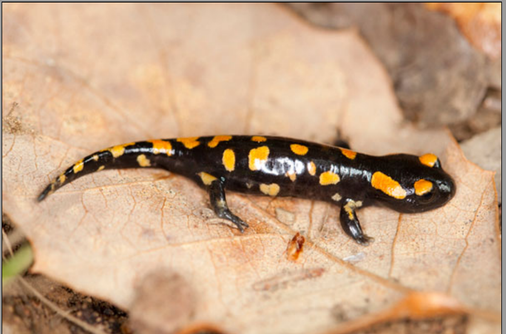
Salamandra salamandra morenica

I went there especially to see Salamandra salamandra morenica . But there, all was very dry too. I saw only two very young salamanders hidden under stones. The adults were buried probably further in the ground. At the same place, I saw finally two Discoglossus galganoi galganoi .