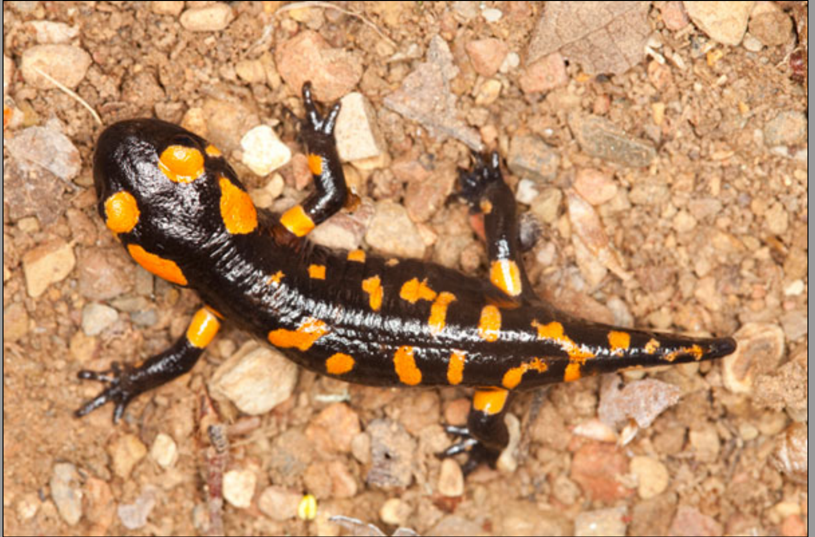
Salamandra salamandra morenica