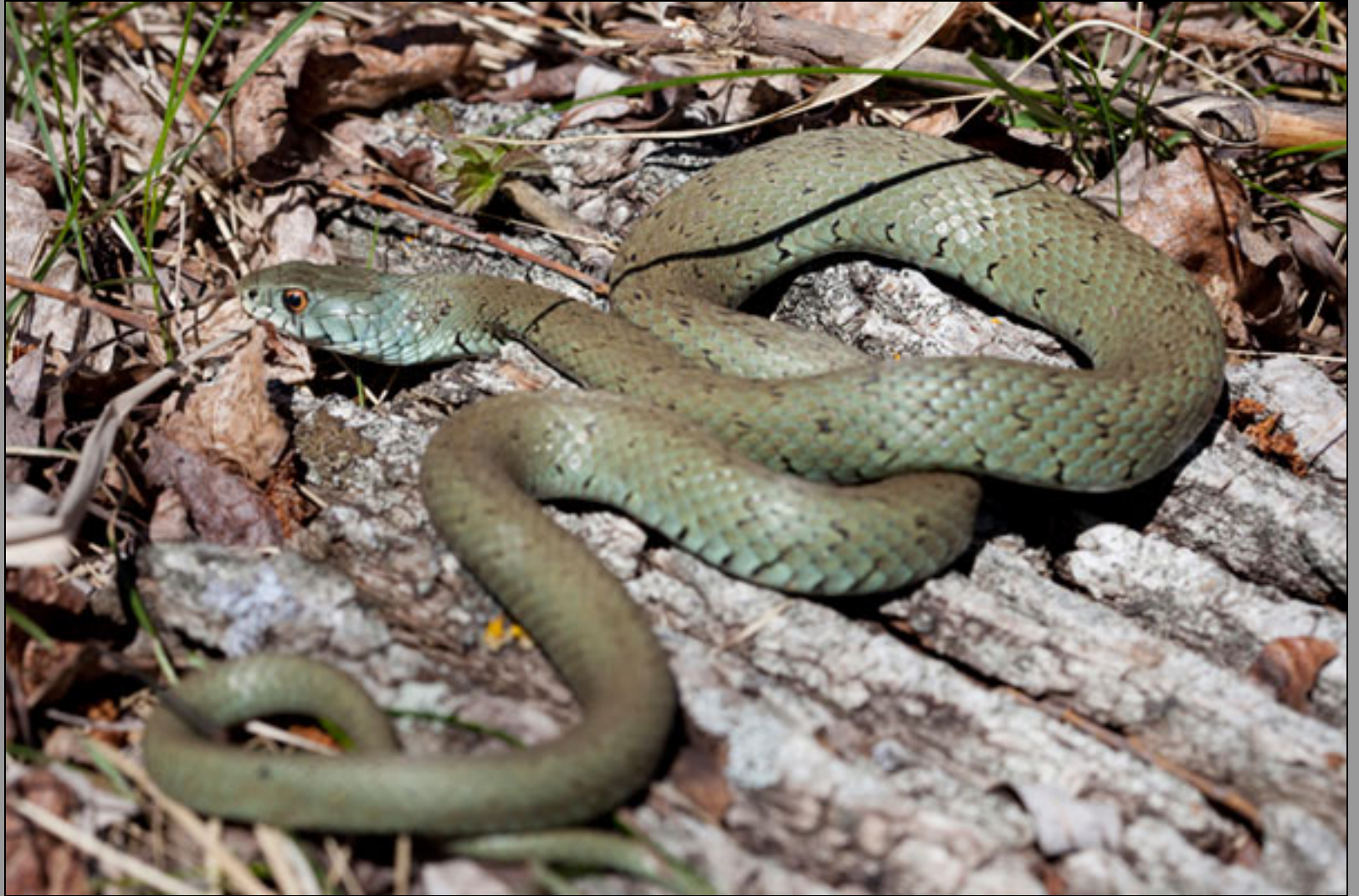
Natrix natrix astreptophora