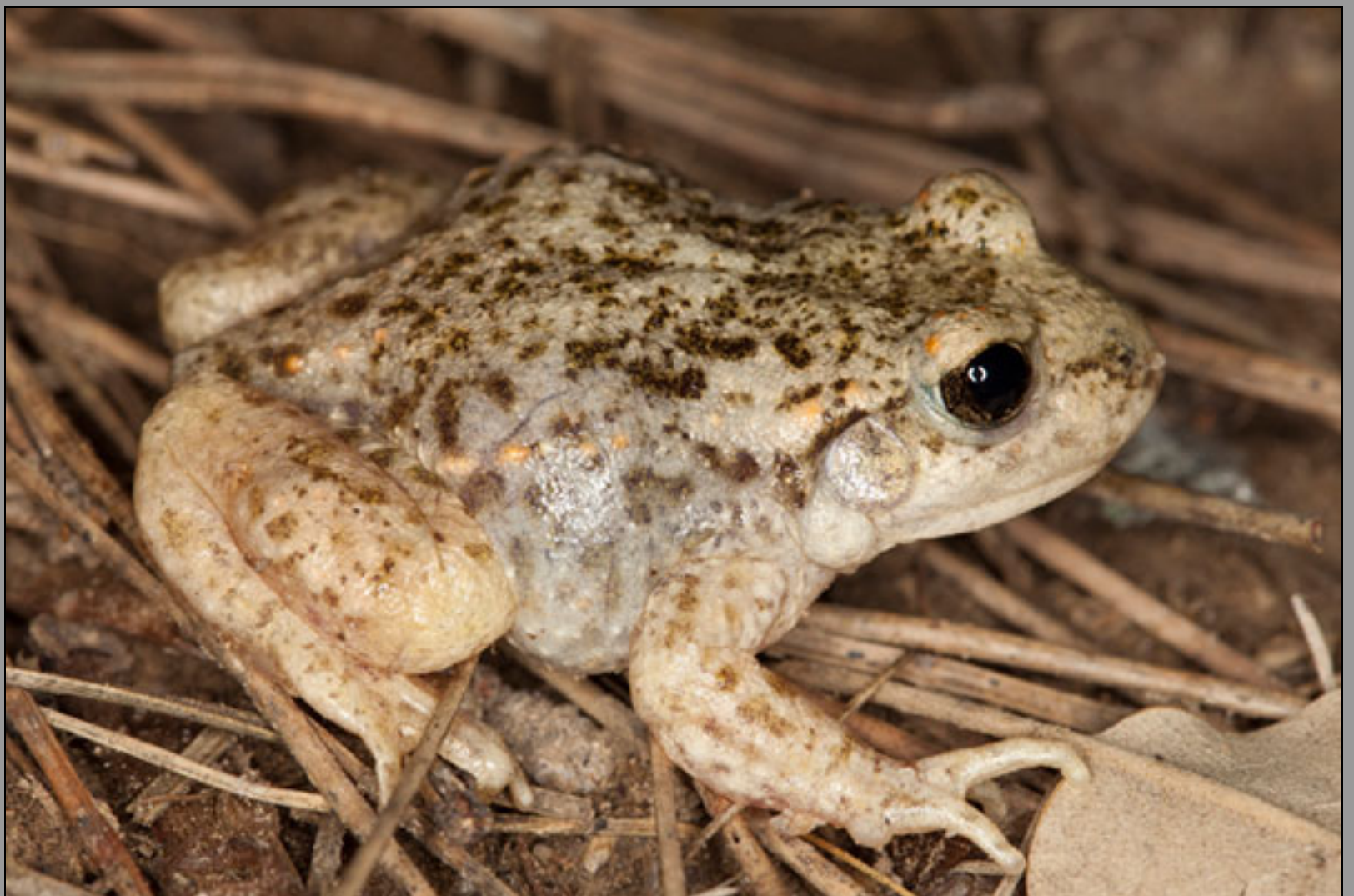
Alytes obstetricans pertinax