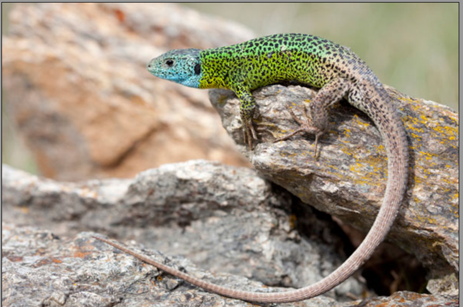
Lacerta schreiberi , male