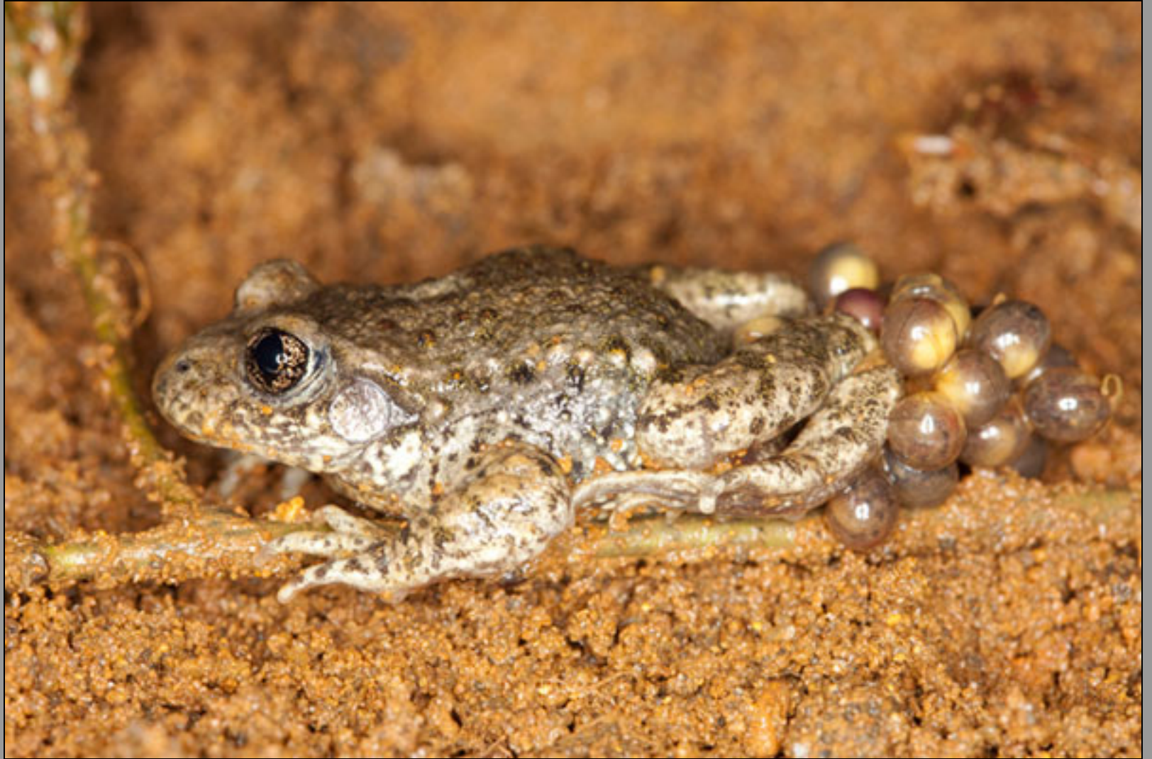
Alytes obstetricans obstetricans