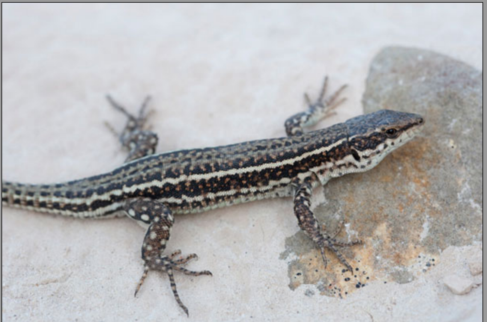
Podarcis liolepis liolepis