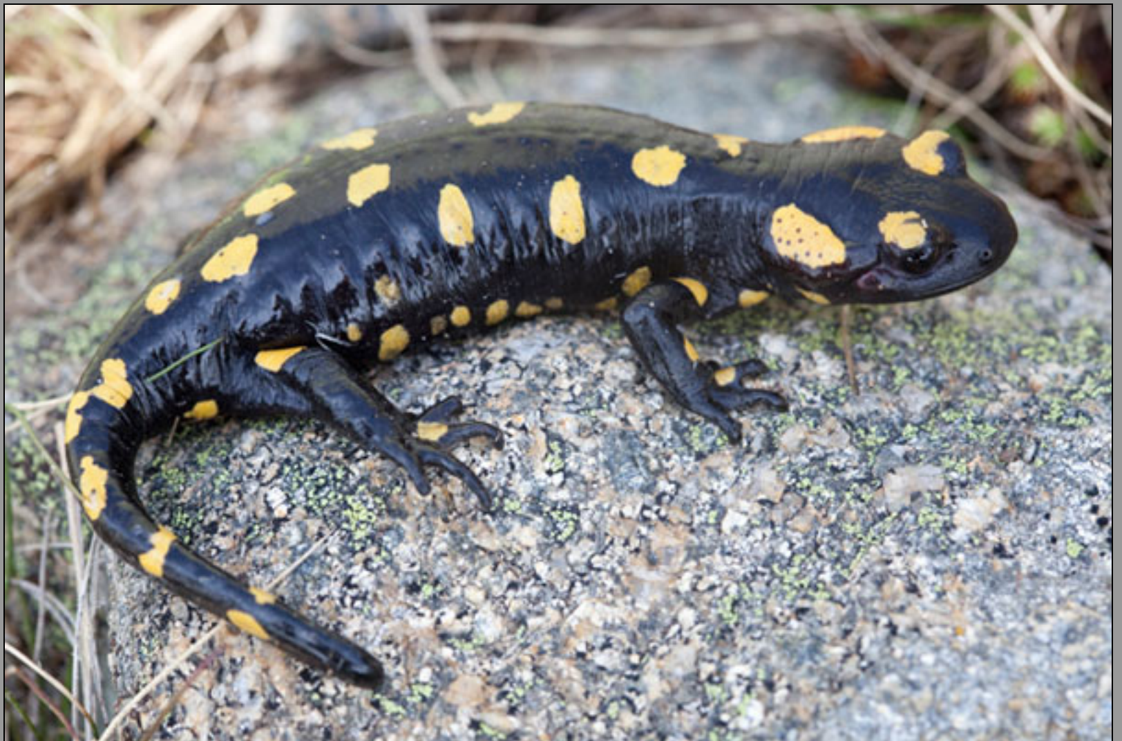
Salamandra salamandra almanzoris