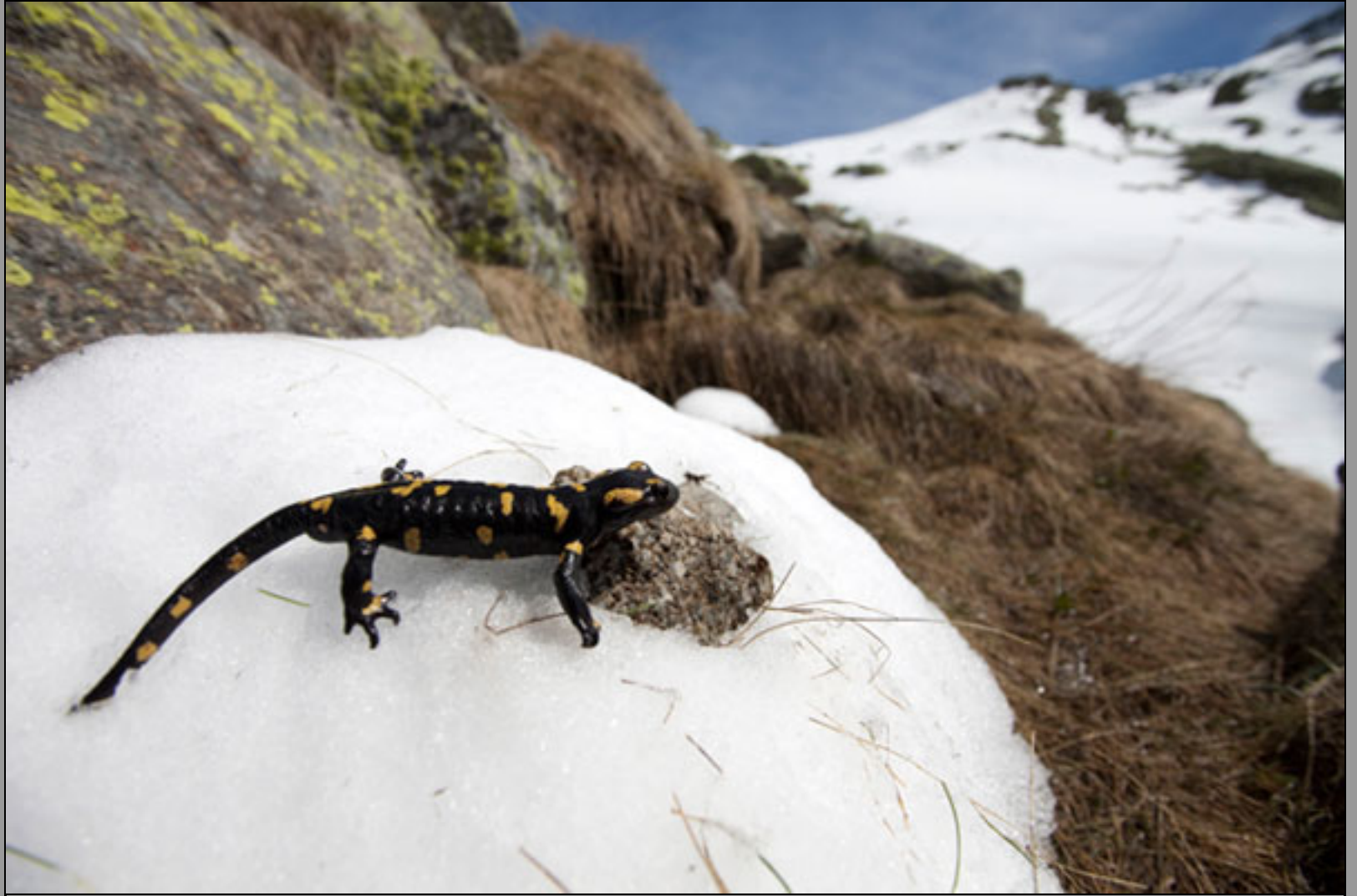
Salamandra salamandra almanzoris