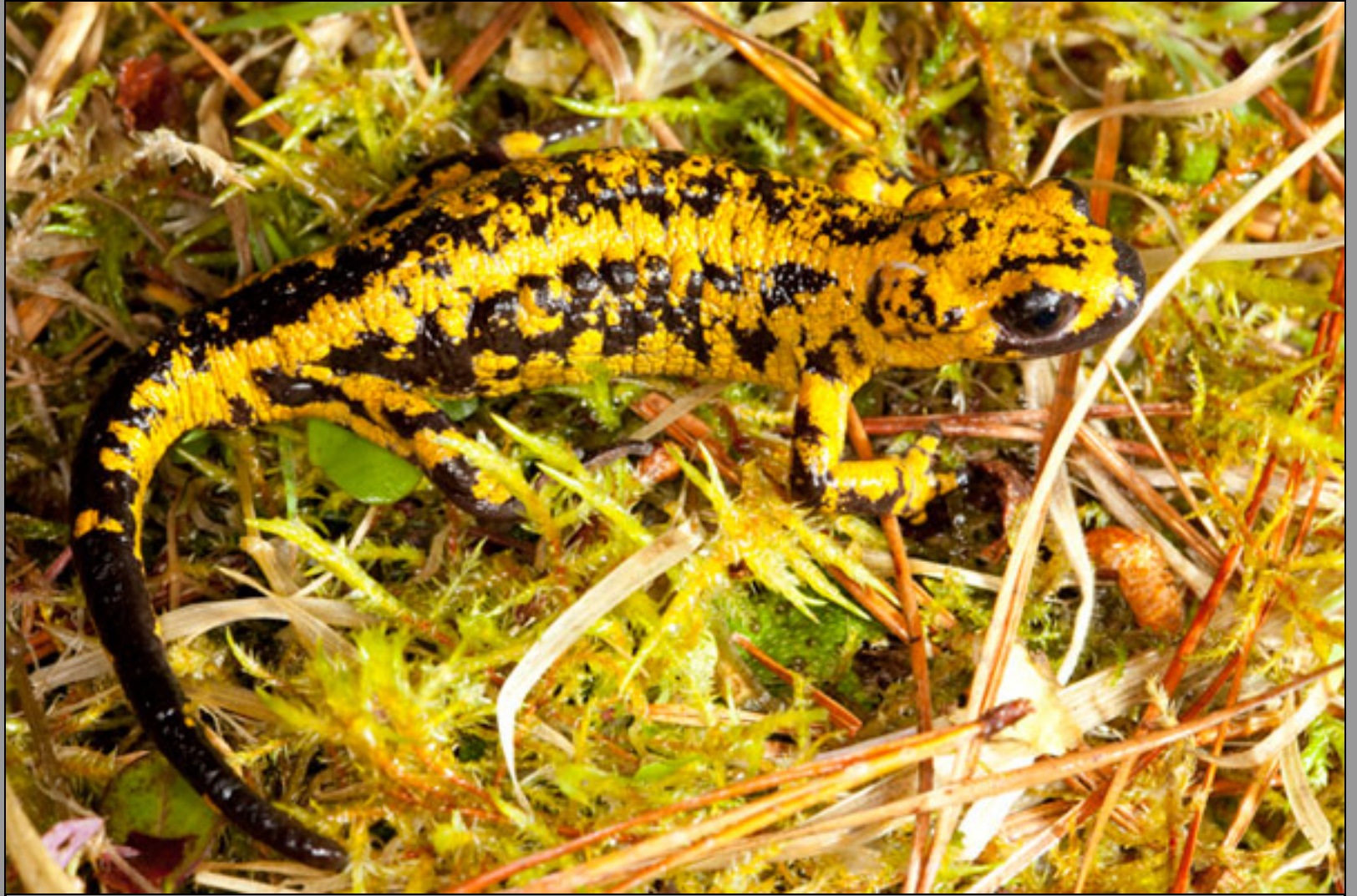
Salamandra salamandra bernardezi