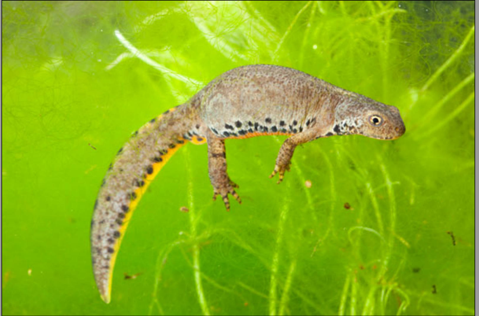
Ichthyosaura alpestris cyreni , female