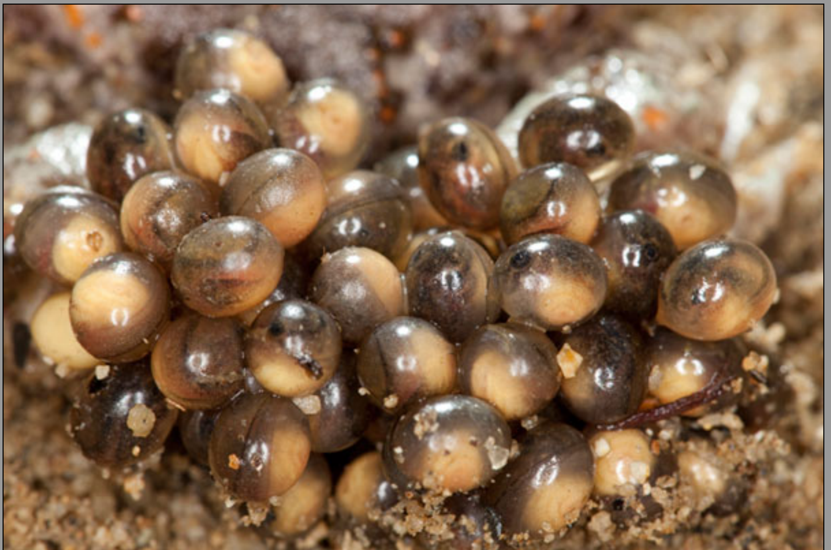
Alytes obstetricans boscai , eggs