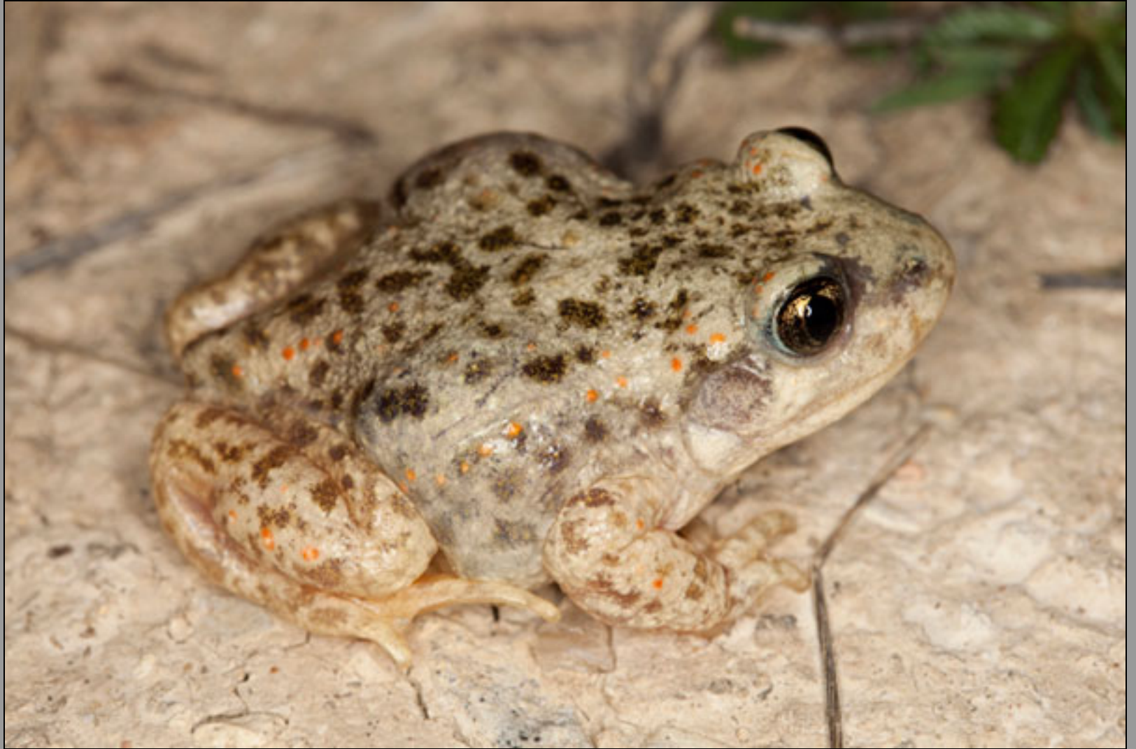
Alytes obstetricans pertinax