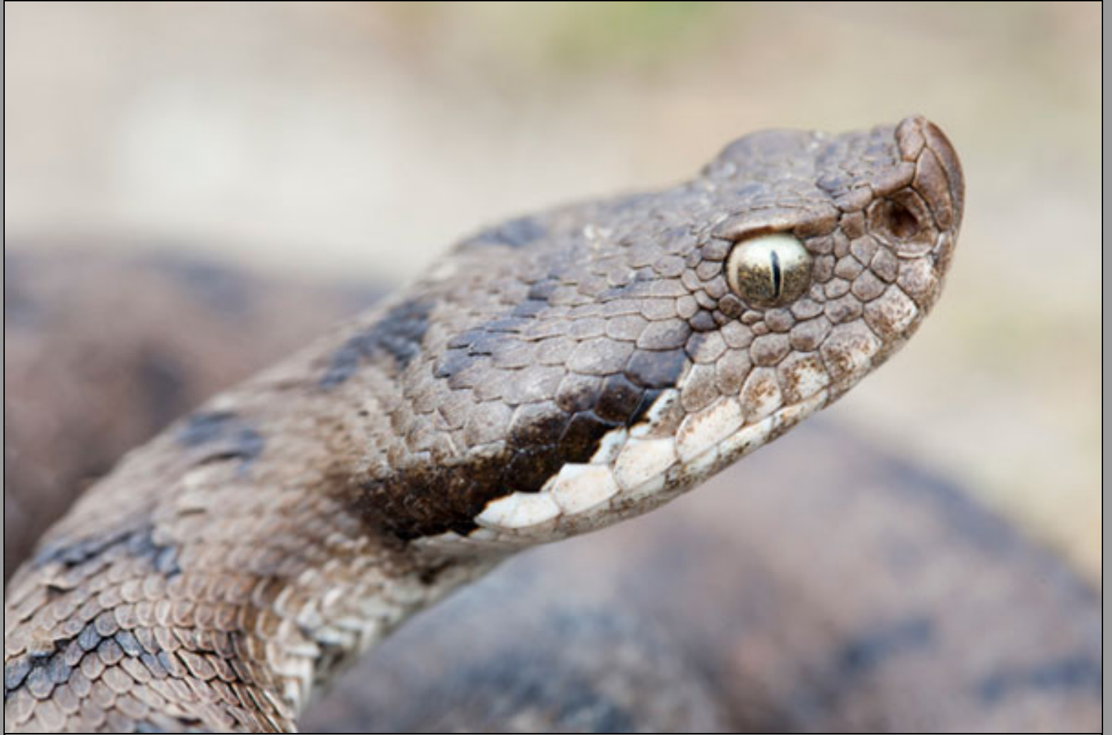
Vipera aspis aspis