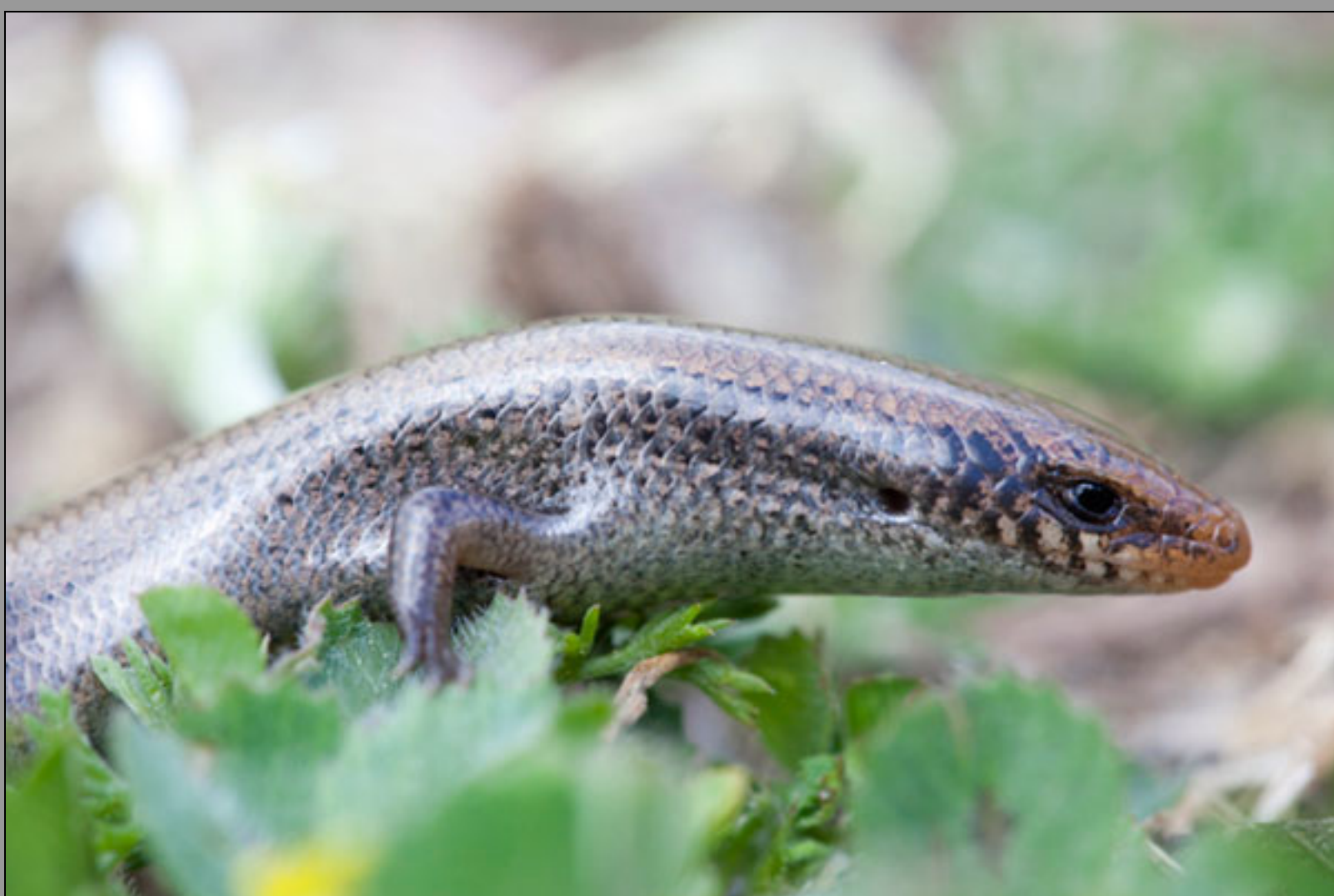
Chalcides bedriagae cobosi