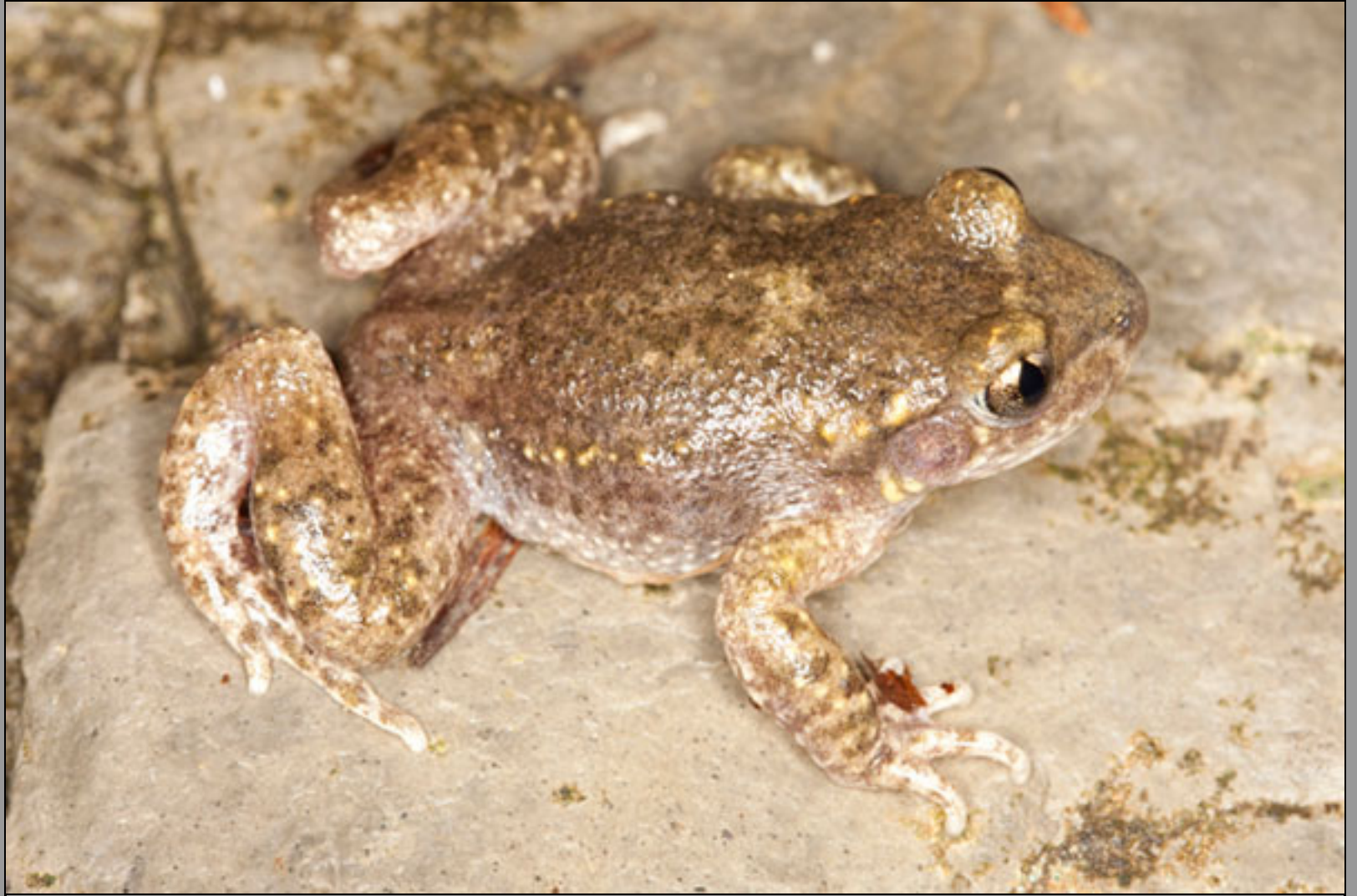
Alytes obstetricans obstetricans

NORTHWESTERN SPAIN : T° : about 15°c day ; 2-4°c night