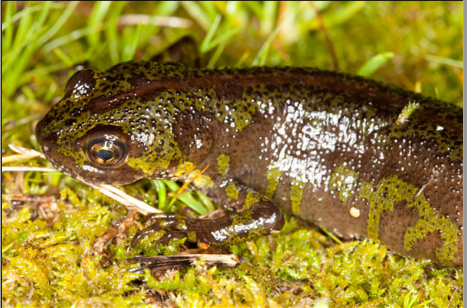
Triturus marmoratus , female