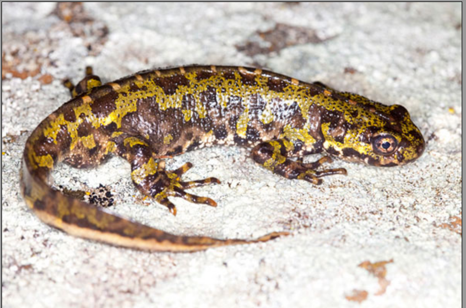
Triturus marmoratus , male