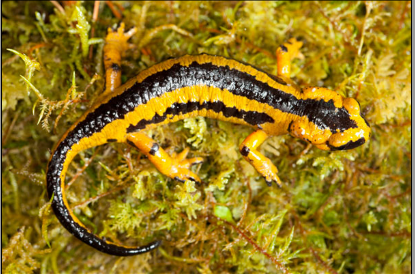
Salamandra salamandra bernardezi