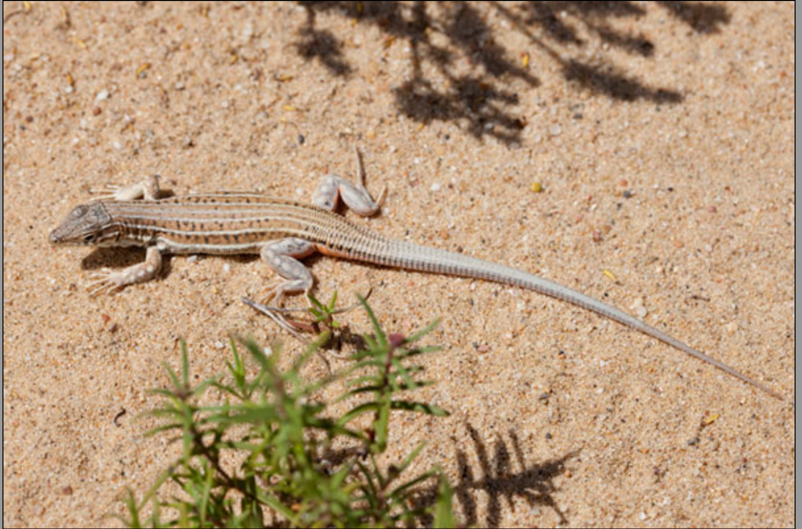
Acanthodactylus erythrurus , female