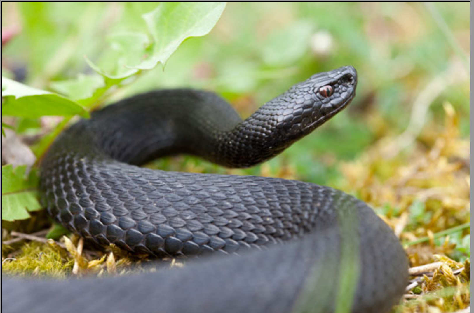
Vipera berus , melanistic

Last visited site, I went in a place where it is possible to observe melanic Vipera berus . After one hour, in spite of an unfavourable time (very windy) I found a nice specimen and also a Rana dalmatina . I left to Le Havre the same day.