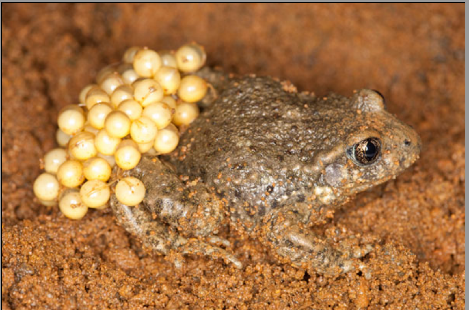
Alytes obstetricans obstetricans