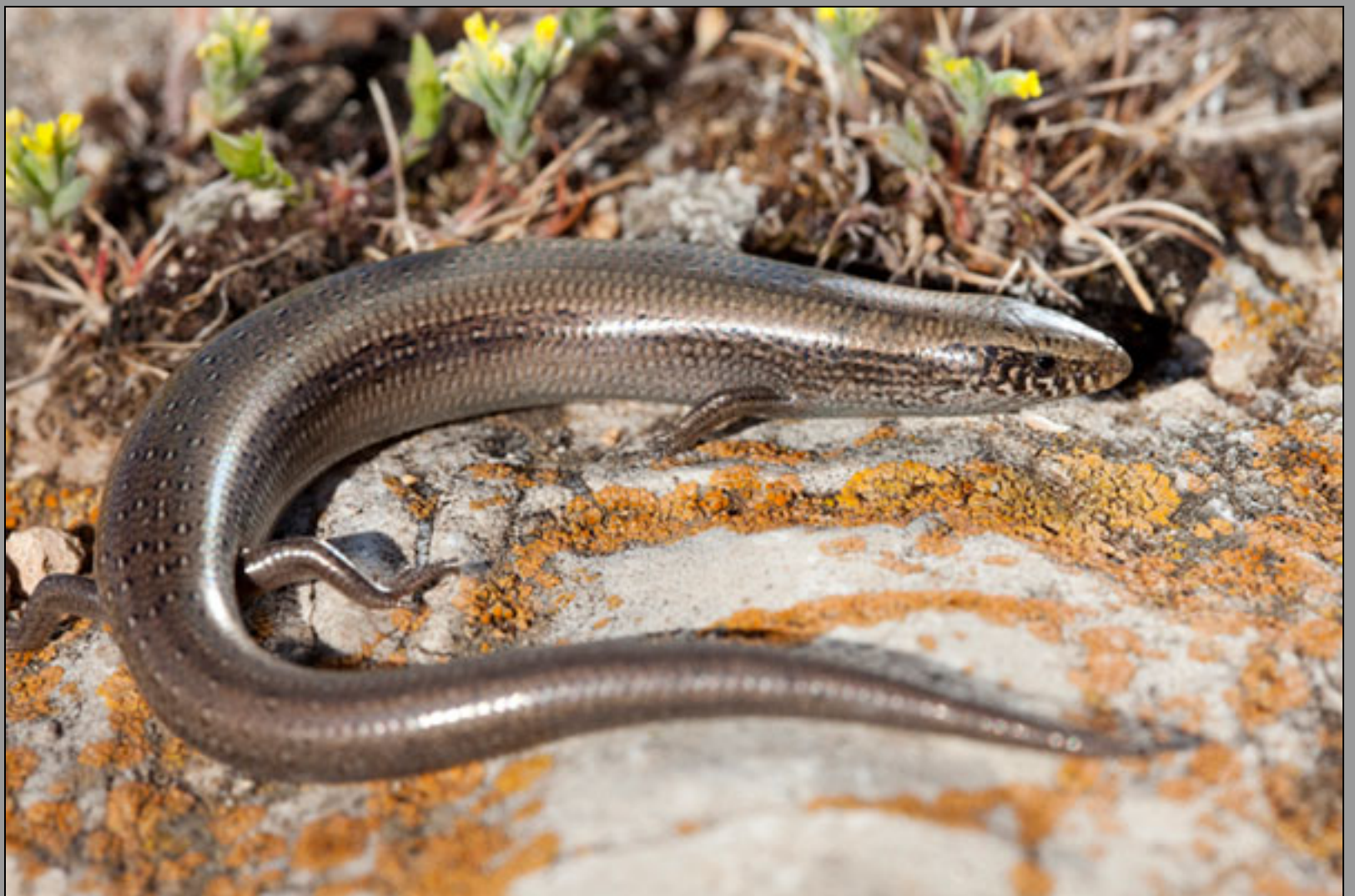
Chalcides bedriagae bedriagae