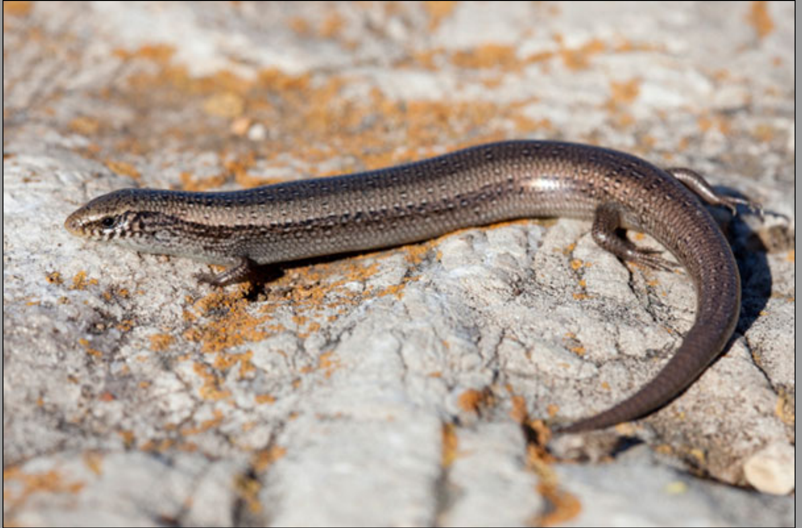
Chalcides bedriagae bedriagae