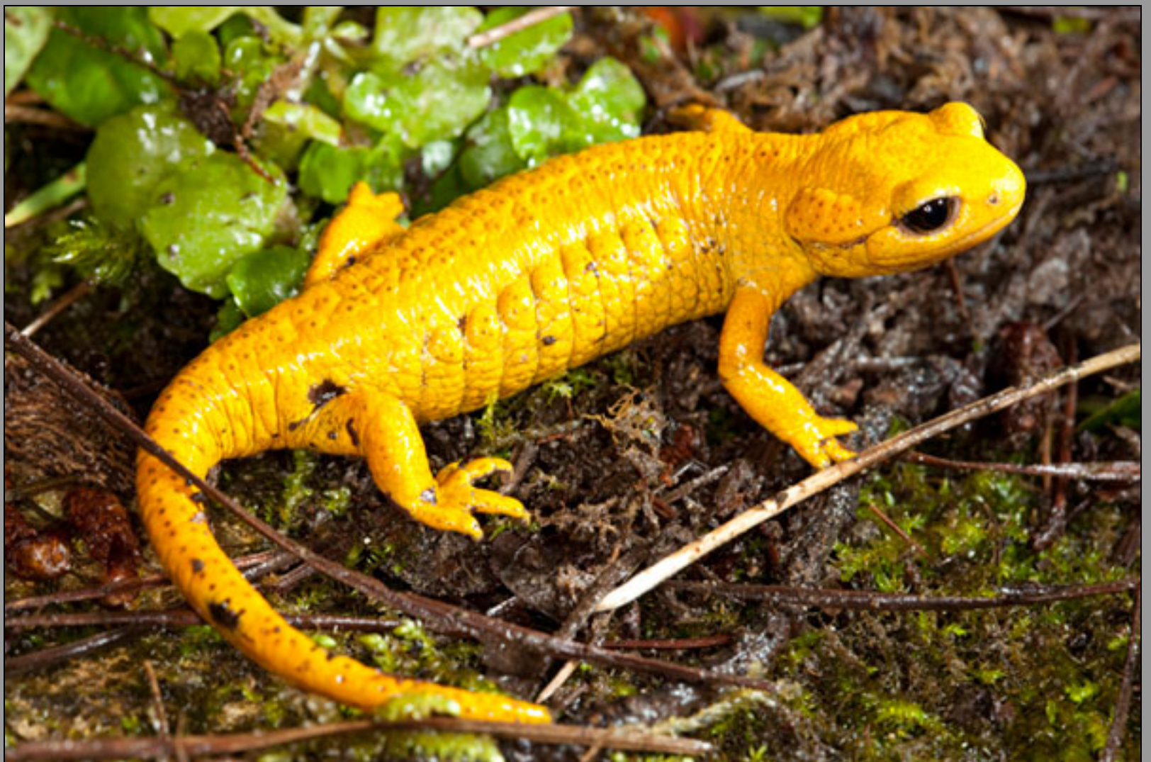
Salamandra salamandra bernardezi