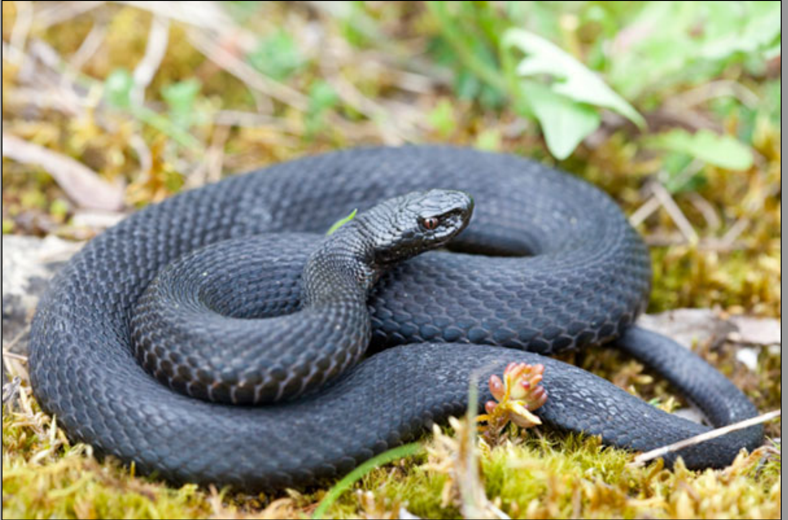
Vipera berus , melanistic

Chamaeleo chamaeleon Blanus cinereus Blanus mariae Acanthodactylus erythrurus Tarentola mauritanica Hemidactylus turcicus Podarcis bocagei Podarcis guadarramae lusitanicus Podarcis hispanica Podarcis muralis Podarcis liolepis liolepis Podarcis vaucheri Podarcis carbonelli Iberolacerta cyreni castiliana Lacerta bilineata Lacerta schreiberi Lacerta agilis agilis Psammodromus algirus Psammodromus occidentalis Psammodromus edwardsianus Zootoca vivipara louislantzi Timon lepidus ibericus Timon lepidus lepidus Timon nevadensis