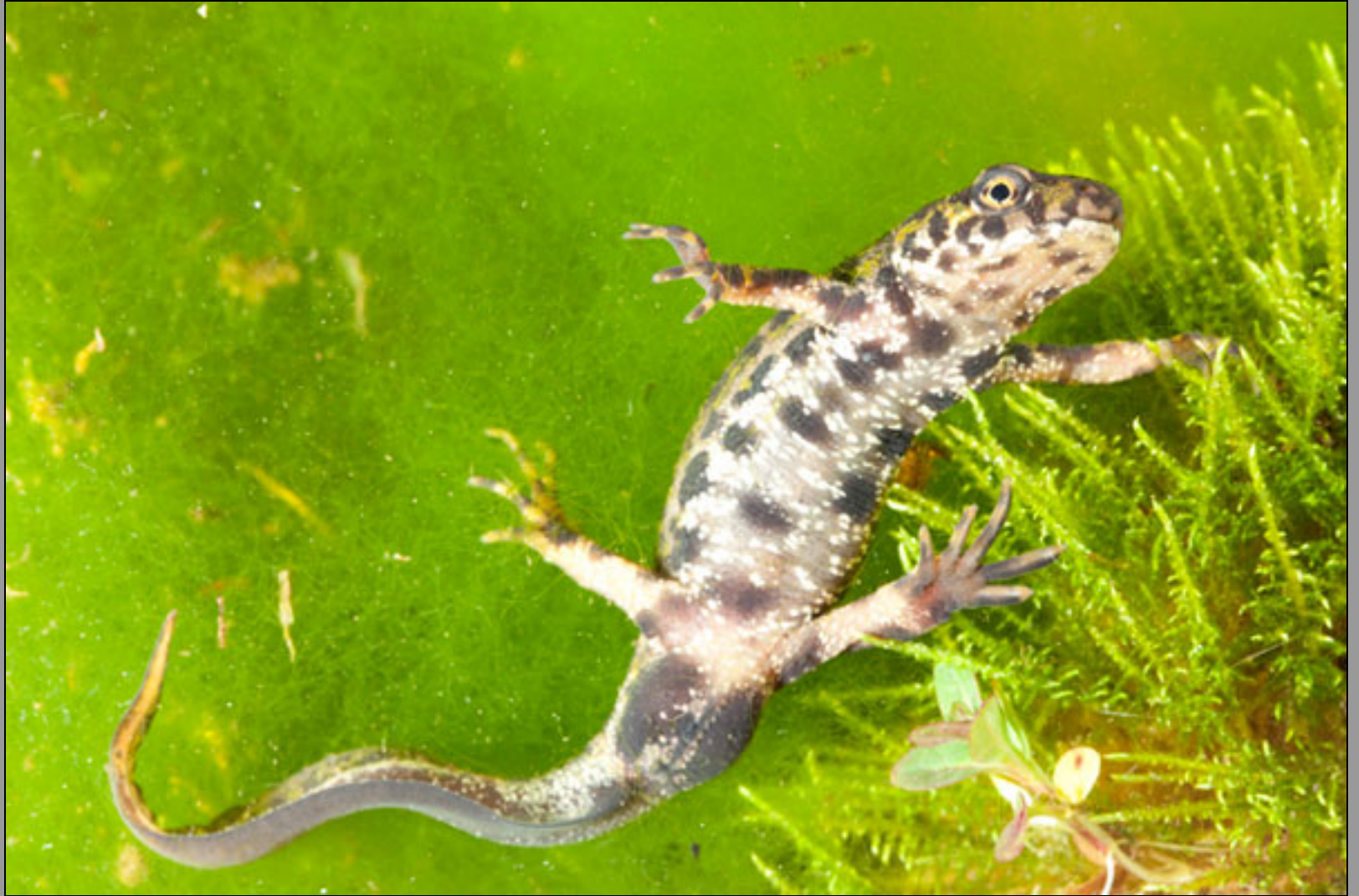
Triturus marmoratus , male