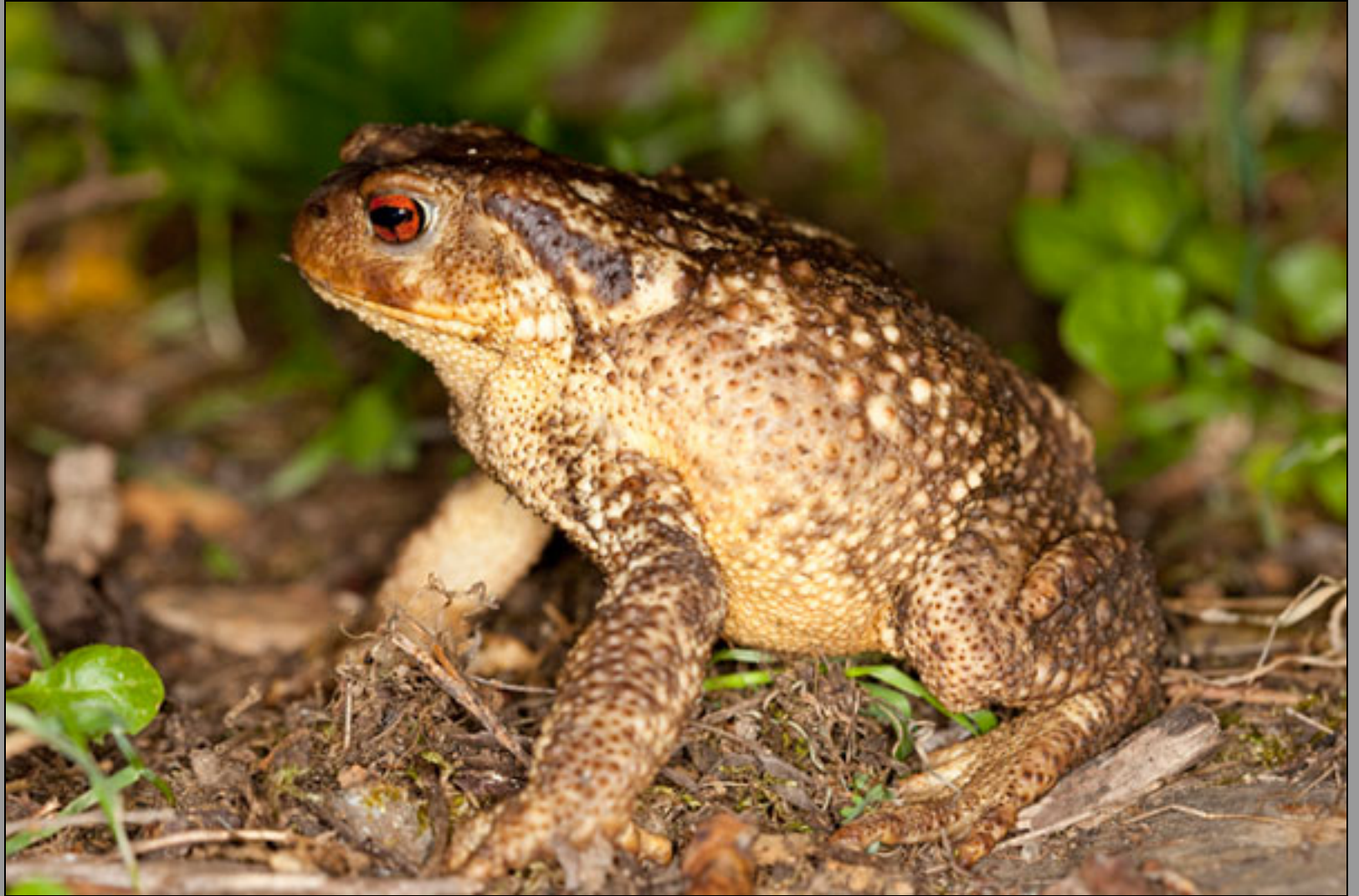
huge female of Bufo spinosus