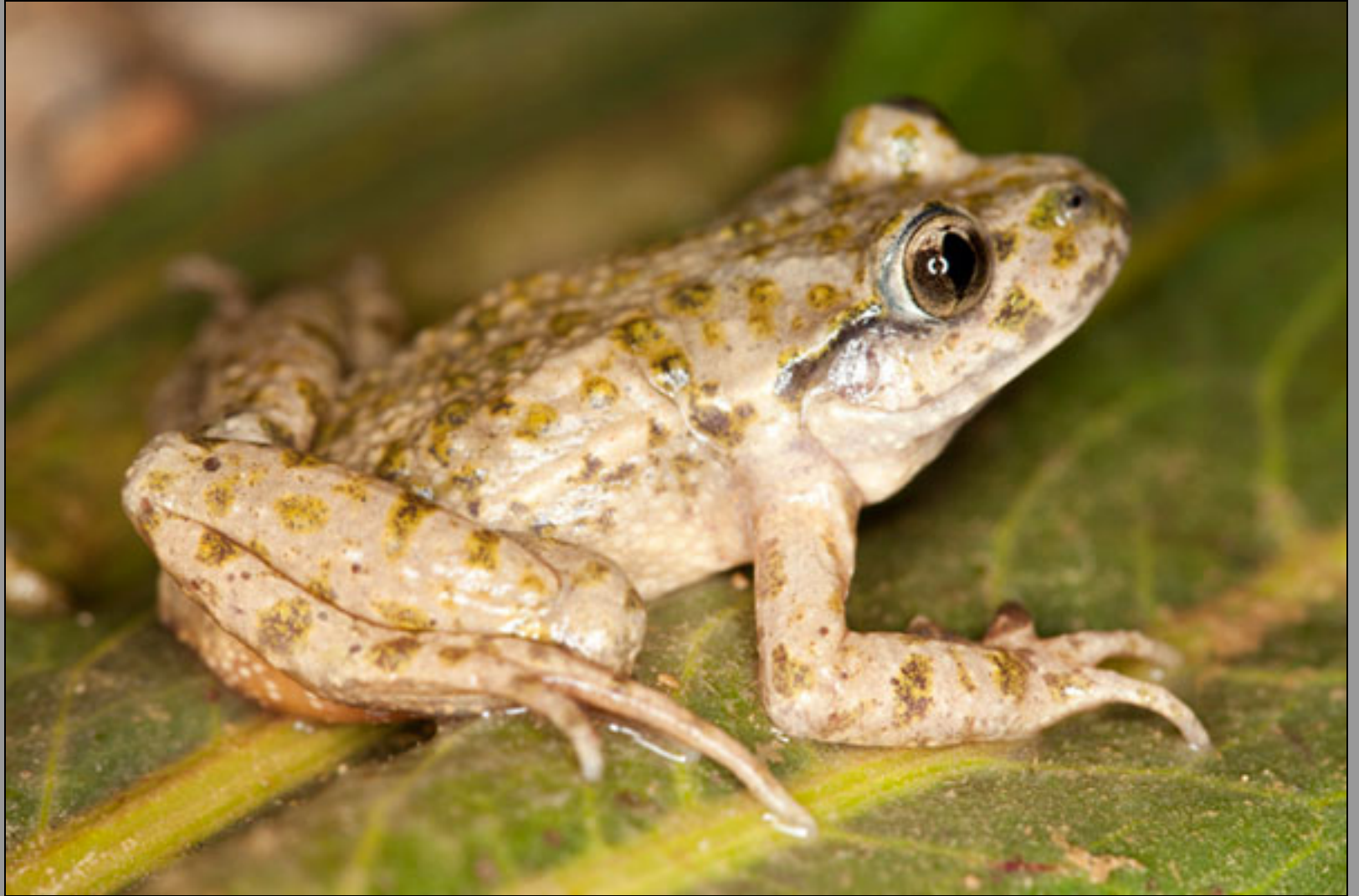
Pelodytes sp. nov