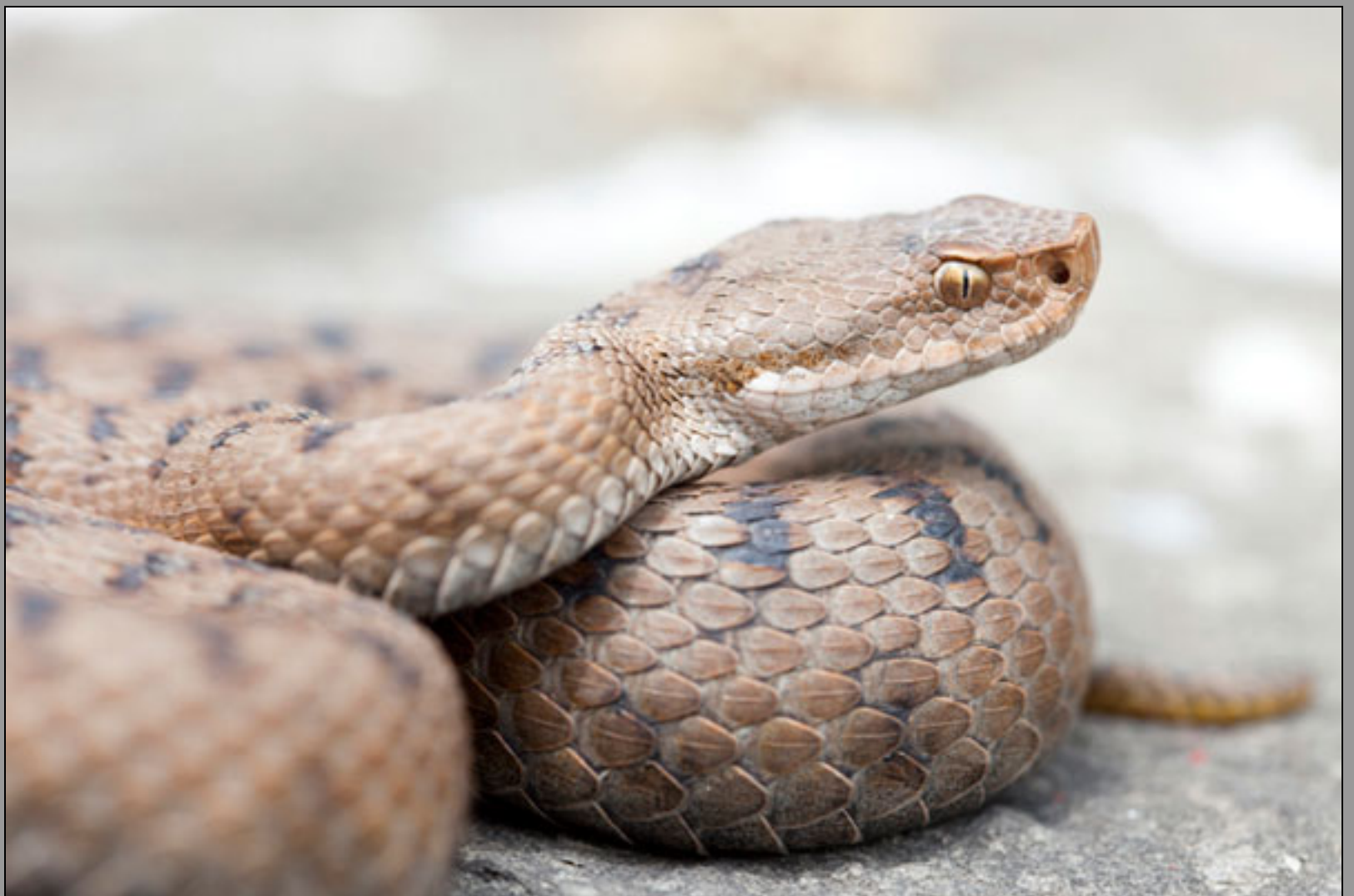
Vipera aspis aspis