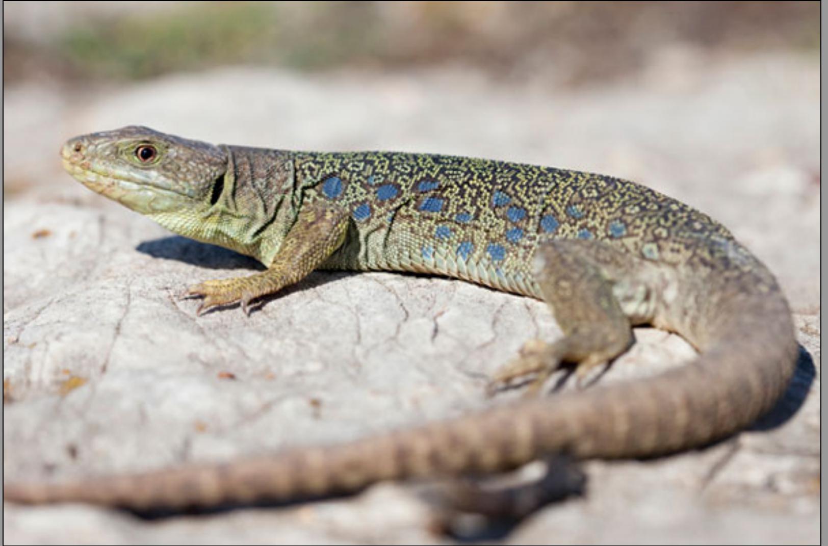
Timon lepidus , male