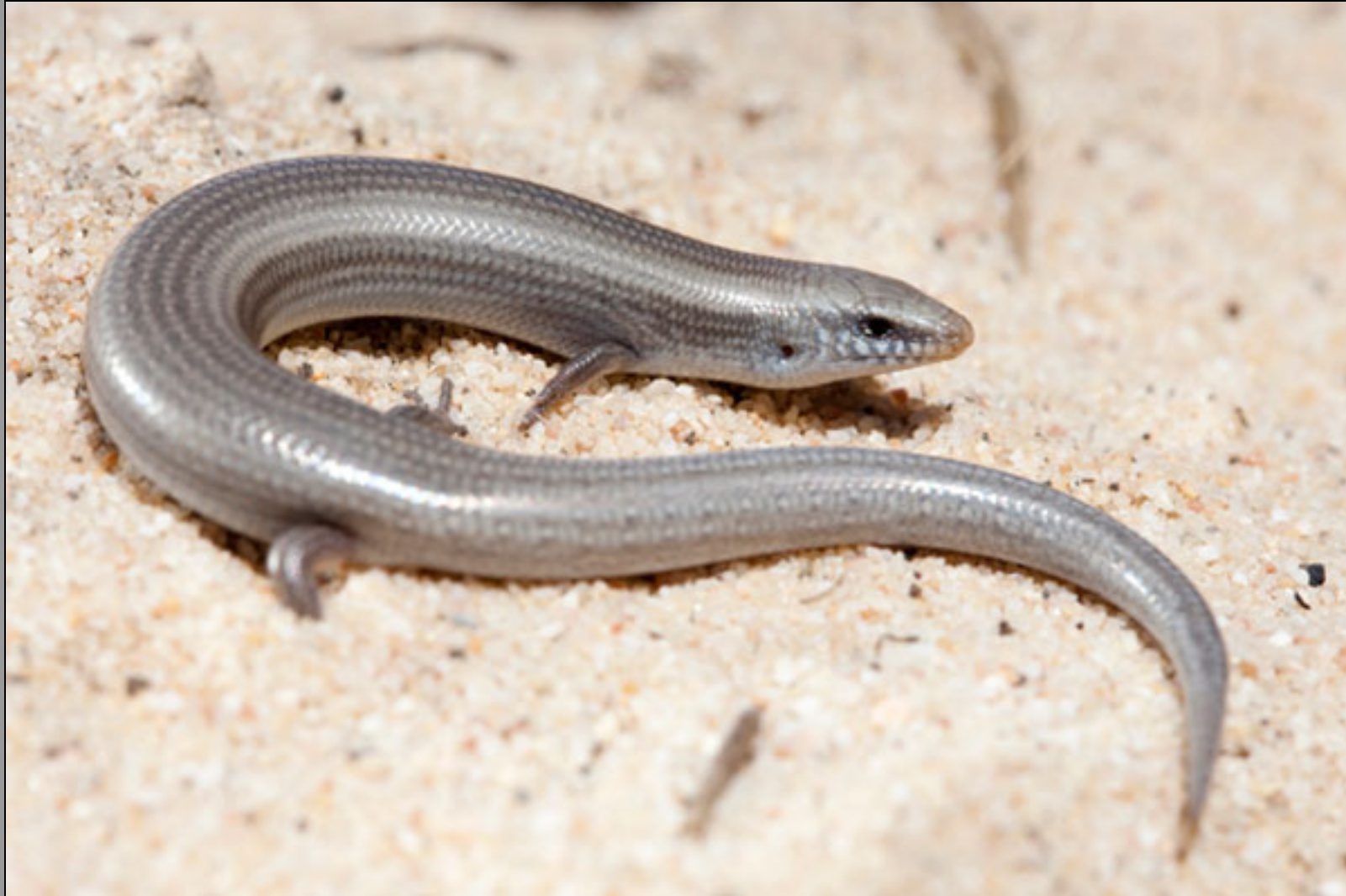
Chalcides bedriagae cobosi , sub adult