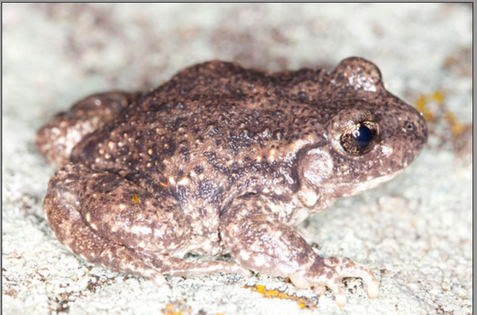
Alytes obstetricans boscai