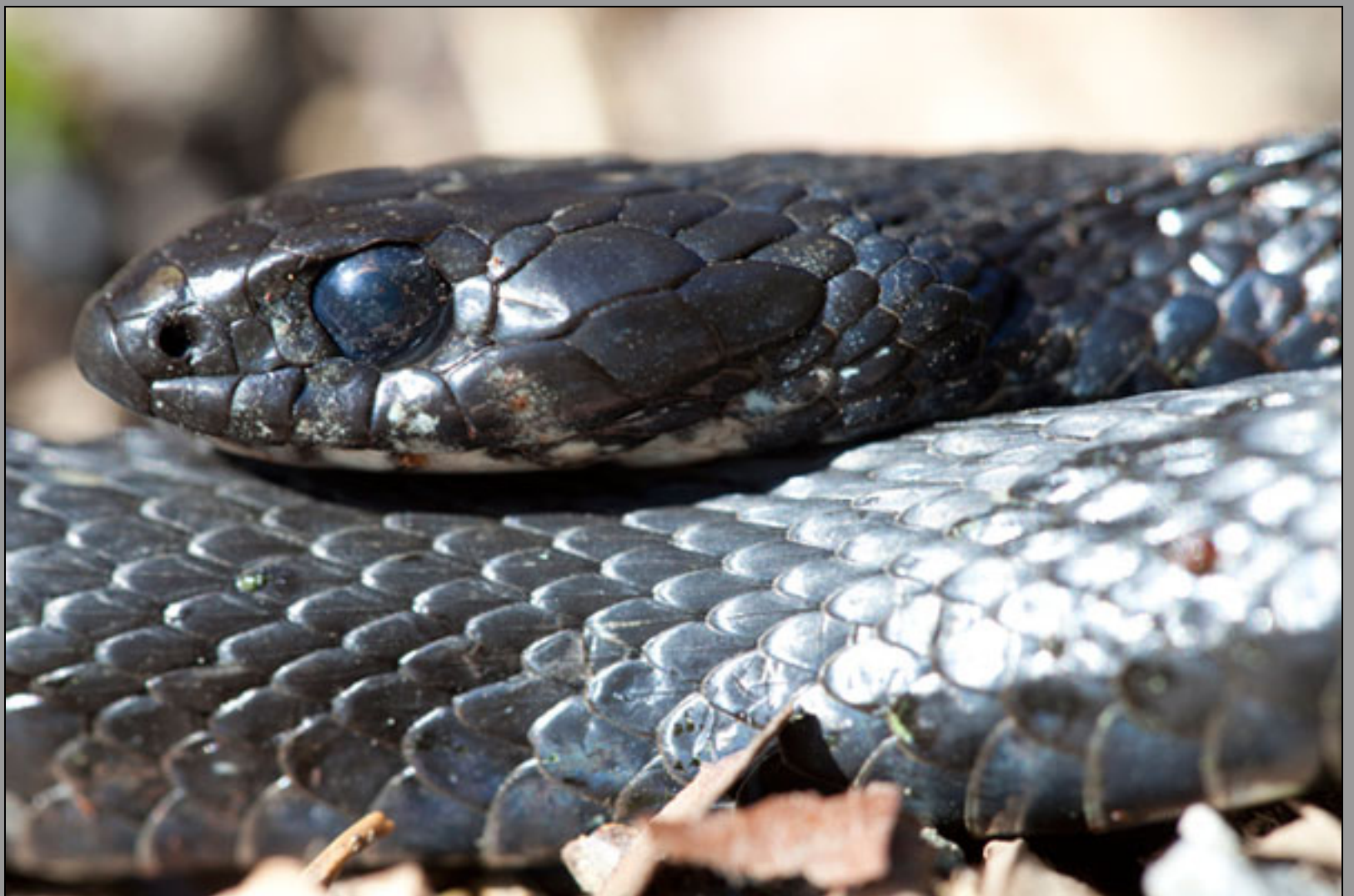
D.O.R. Natrix natrix helvetica , melanic