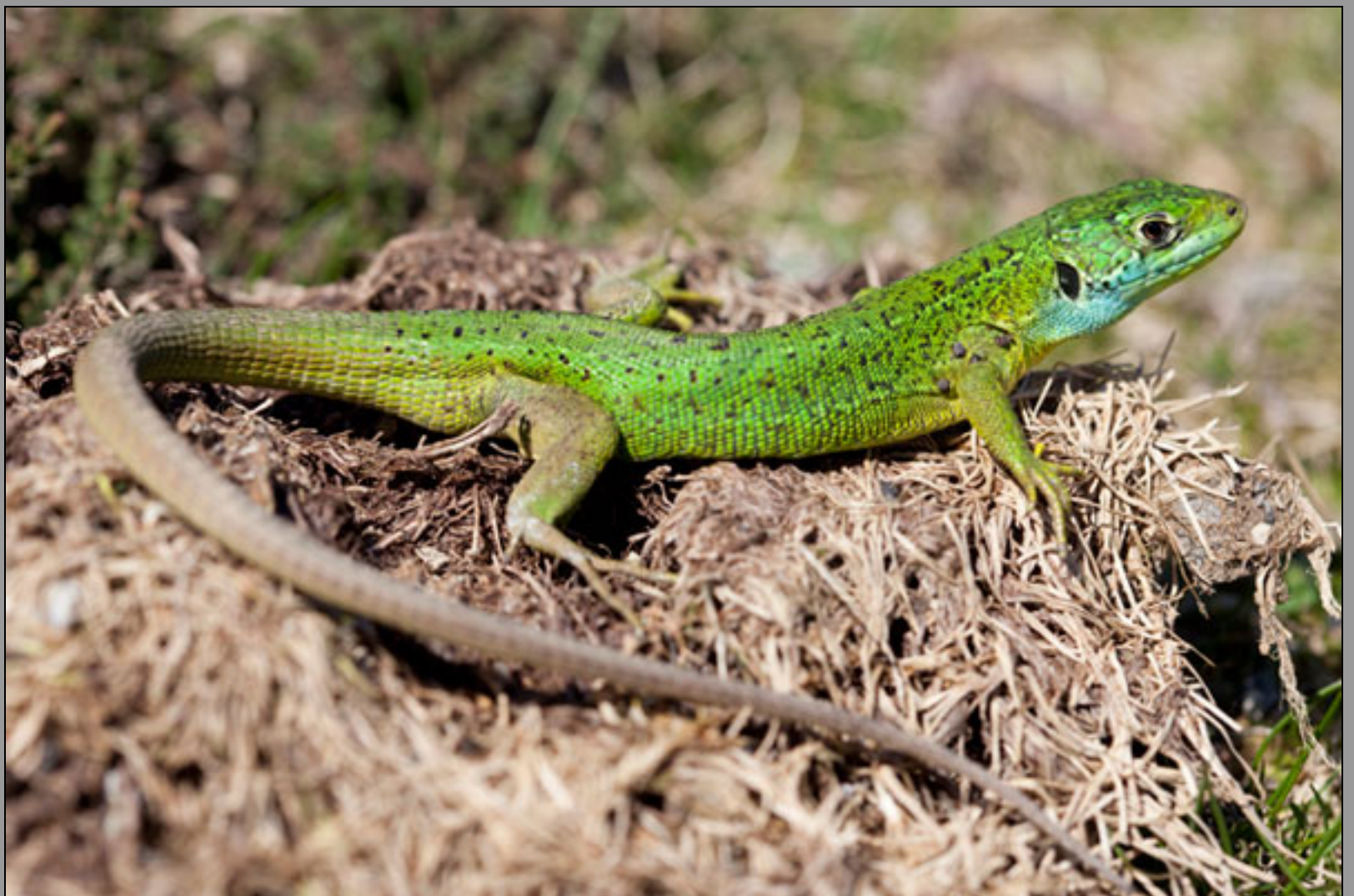
Lacerta bilineata , small female