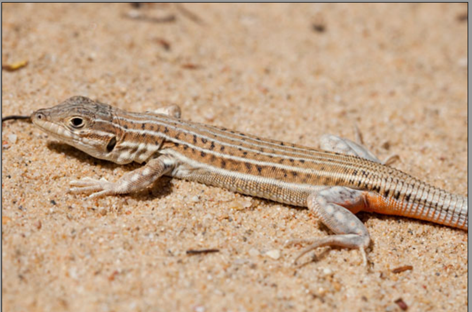
Acanthodactylus erythrurus , female