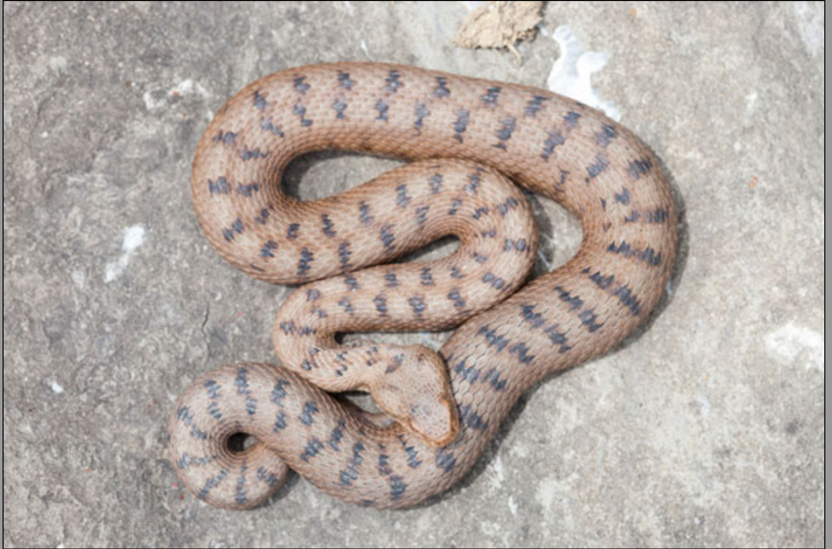
Vipera aspis aspis