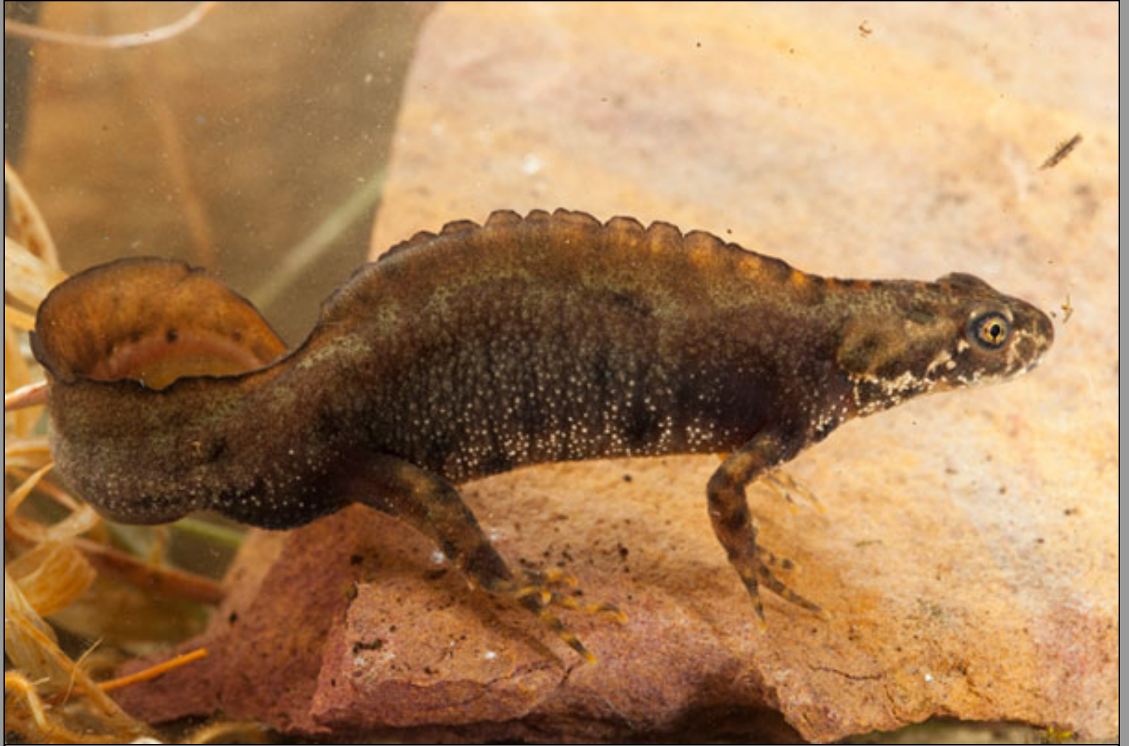
Triturus blasii , hybrid Triturus marmoratus x Triturus cristatus , male