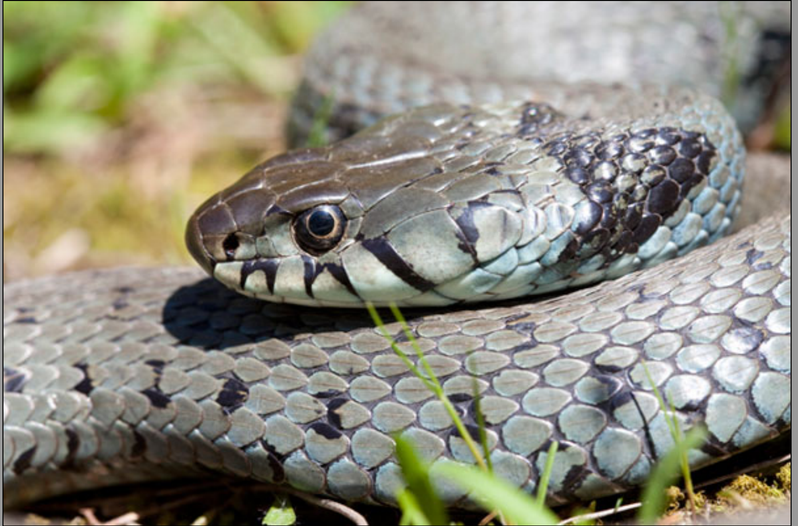
Natrix natrix helvetica , female...