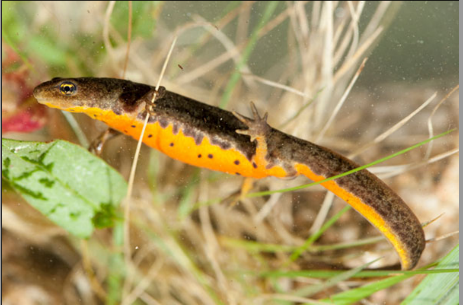
Lissotriton boscai , female