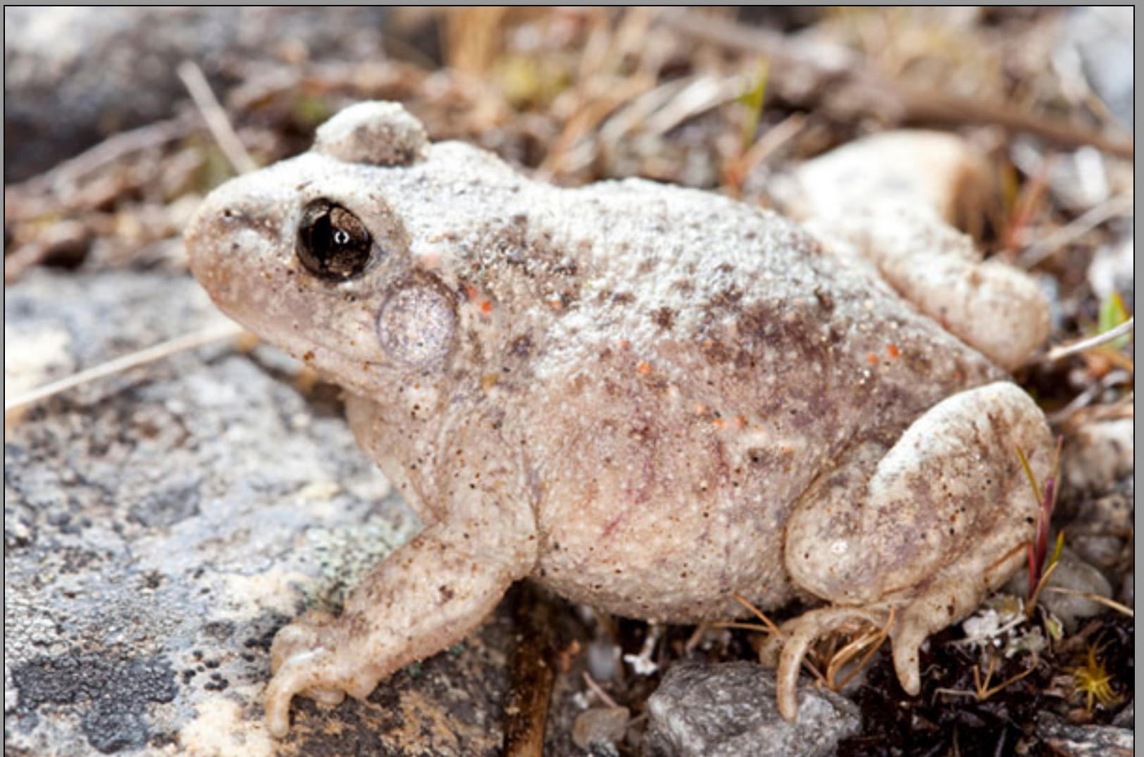
Alytes obstetricans boscai