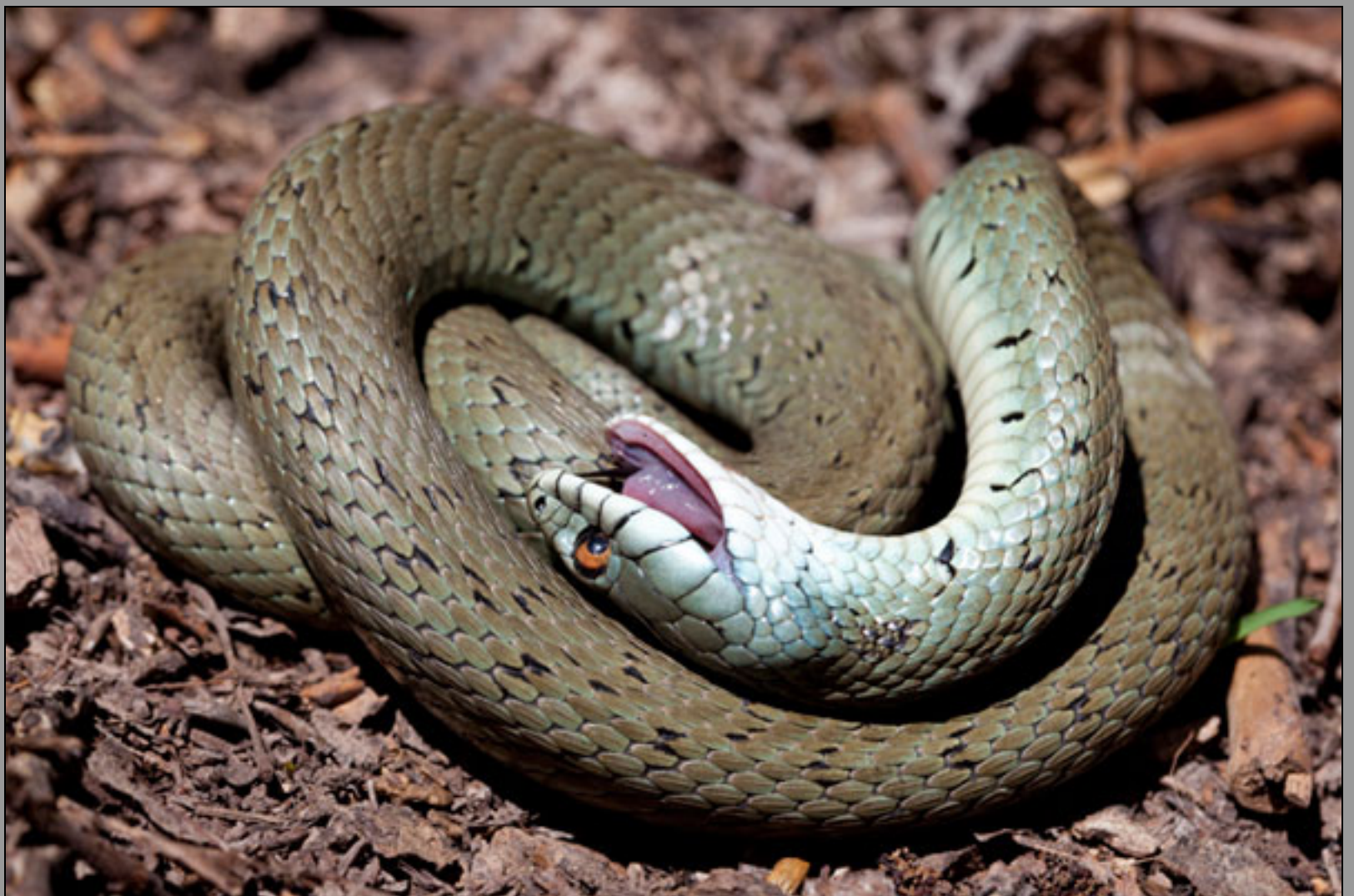
Natrix natrix astreptophora , always hard to make good pictures with Natrix !