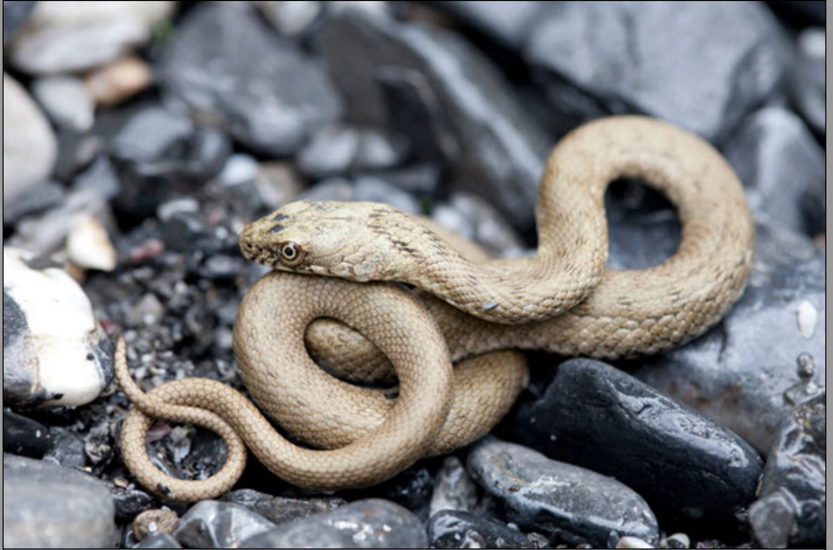
Natrix tessellata , young