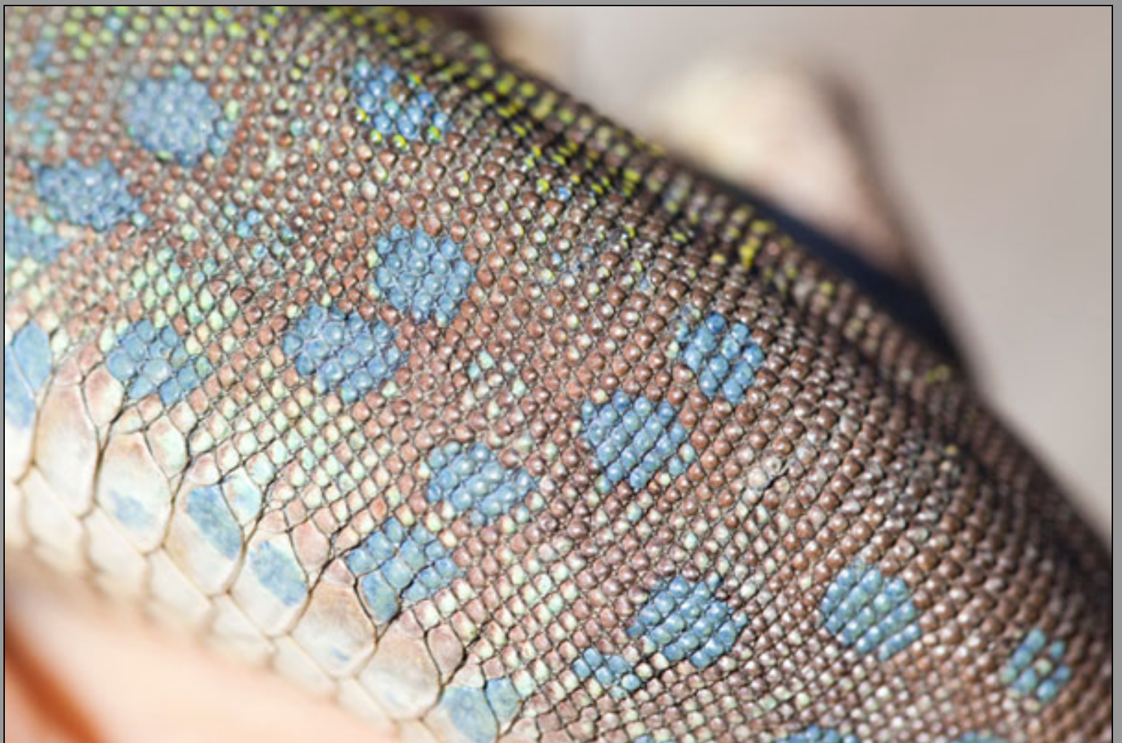
Timon lepidus nevadensis , male