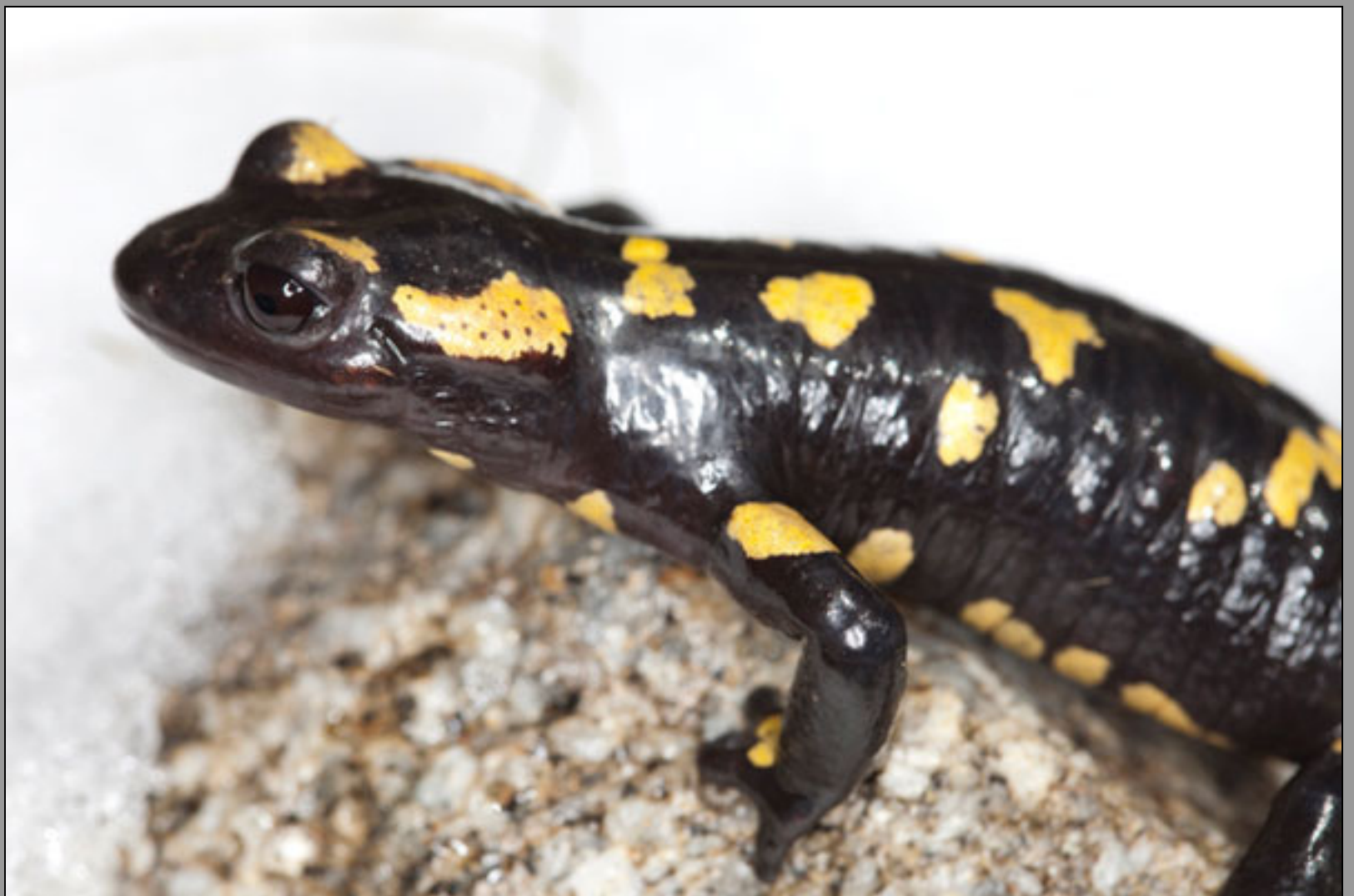
Salamandra salamandra almanzoris