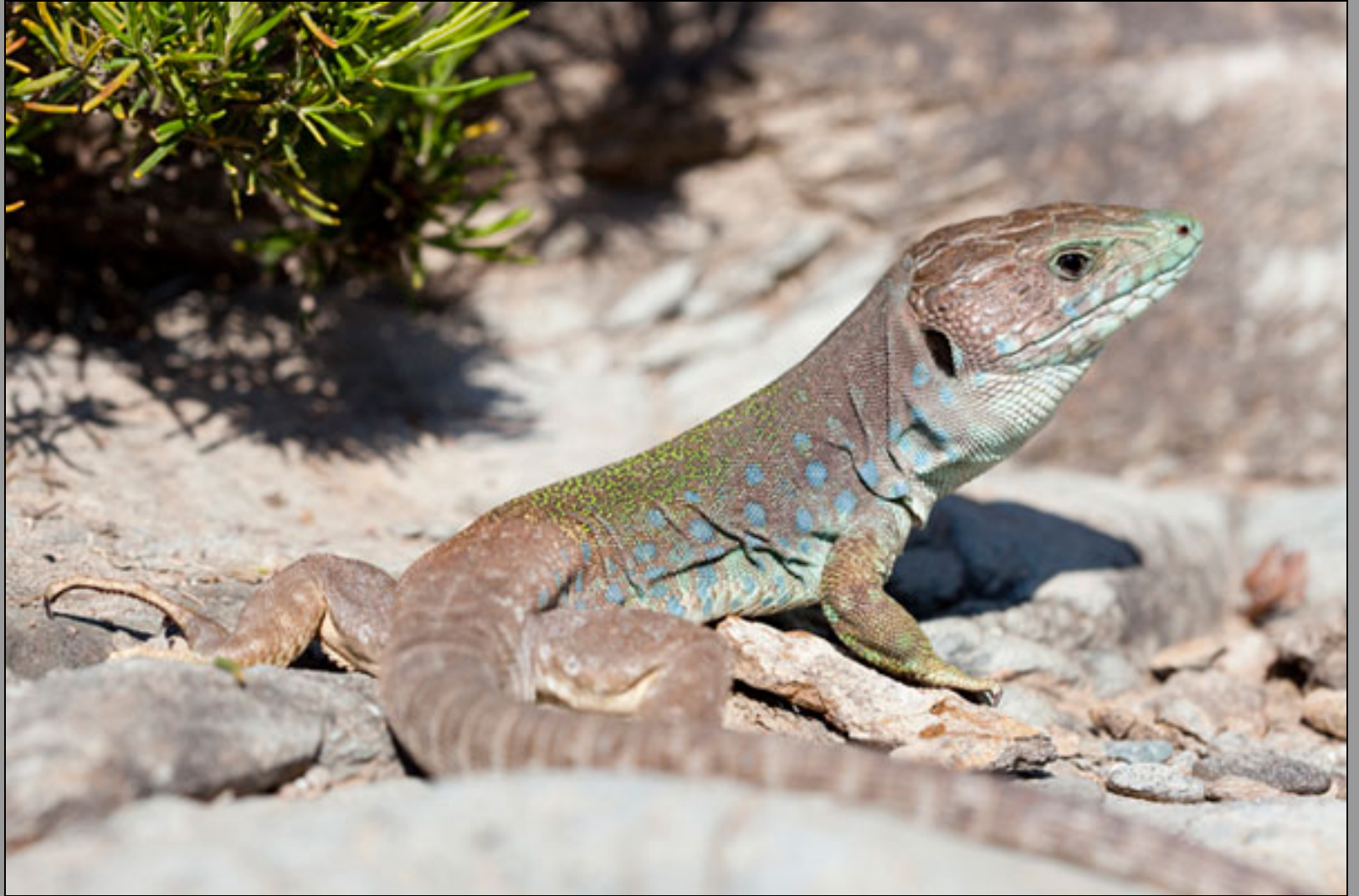
Timon lepidus nevadensis , male