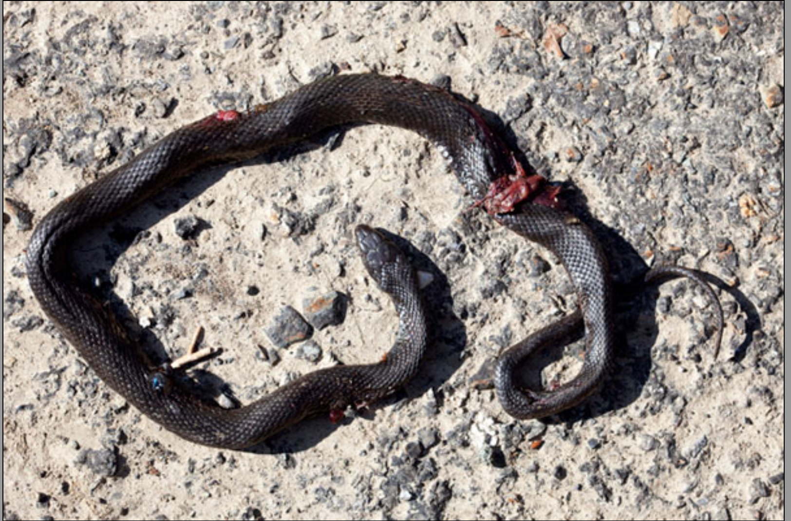
D.O.R. Natrix natrix helvetica , melanic