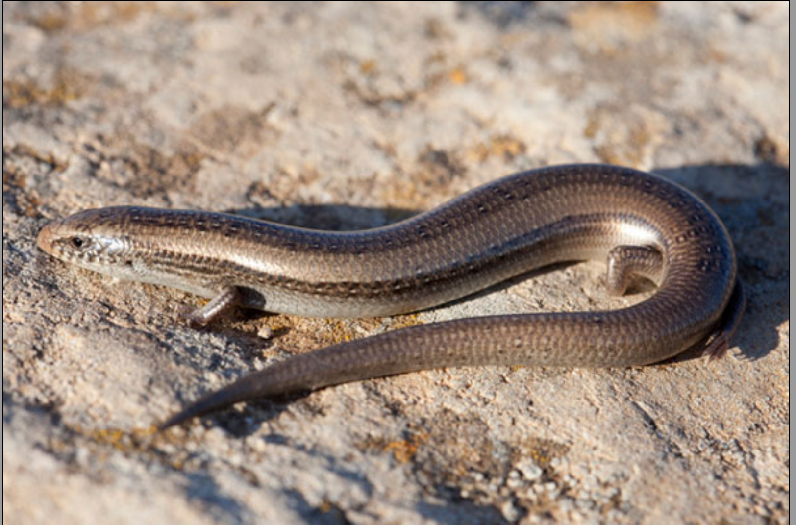
Chalcides bedriagae bedriagae