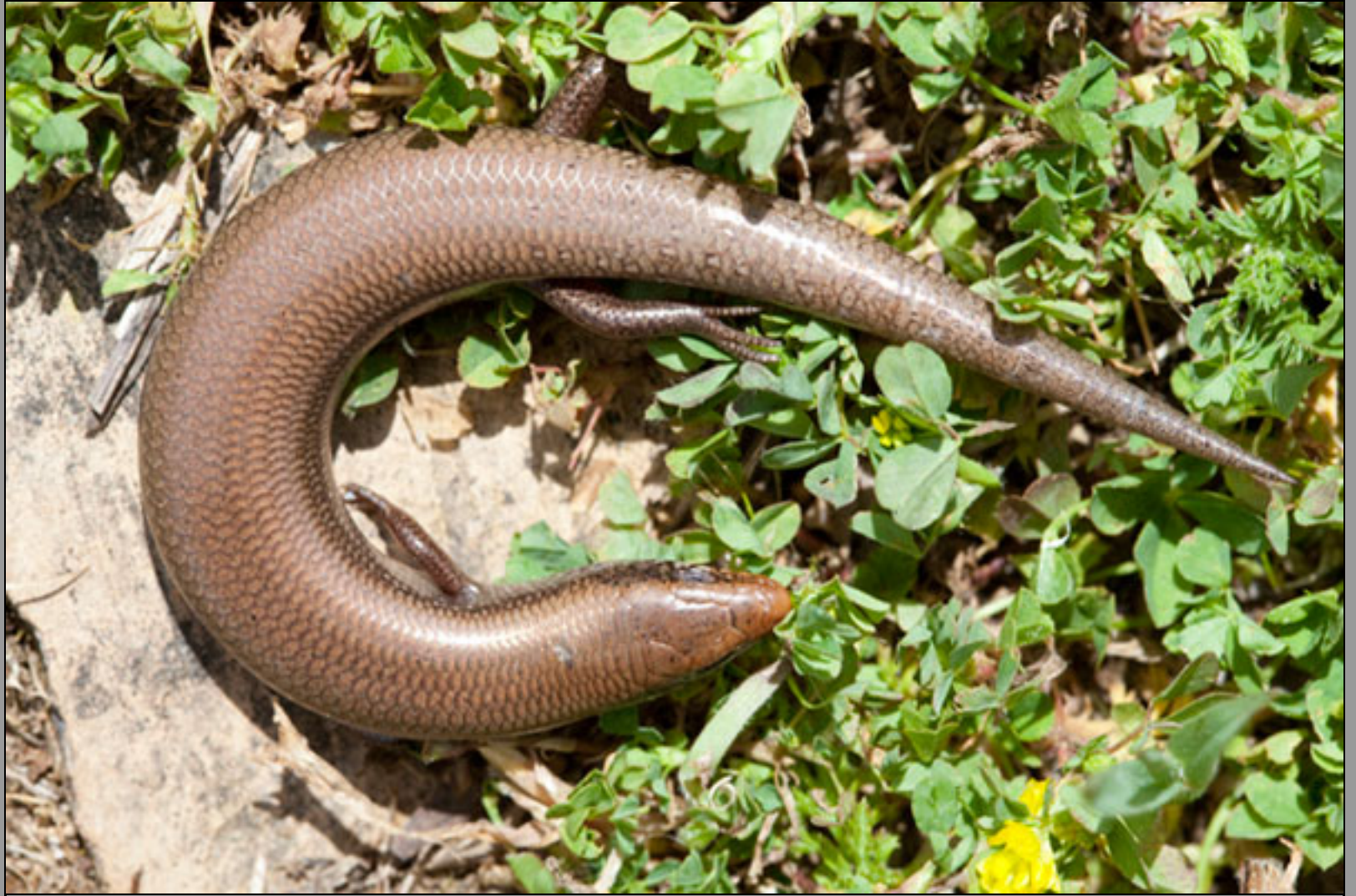
Chalcides bedriagae cobosi