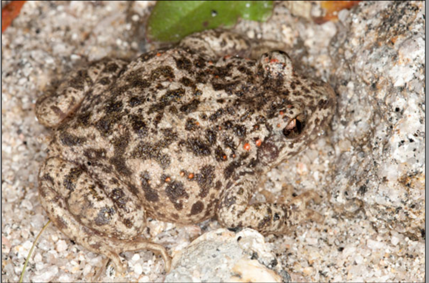
Alytes obstetricans boscai