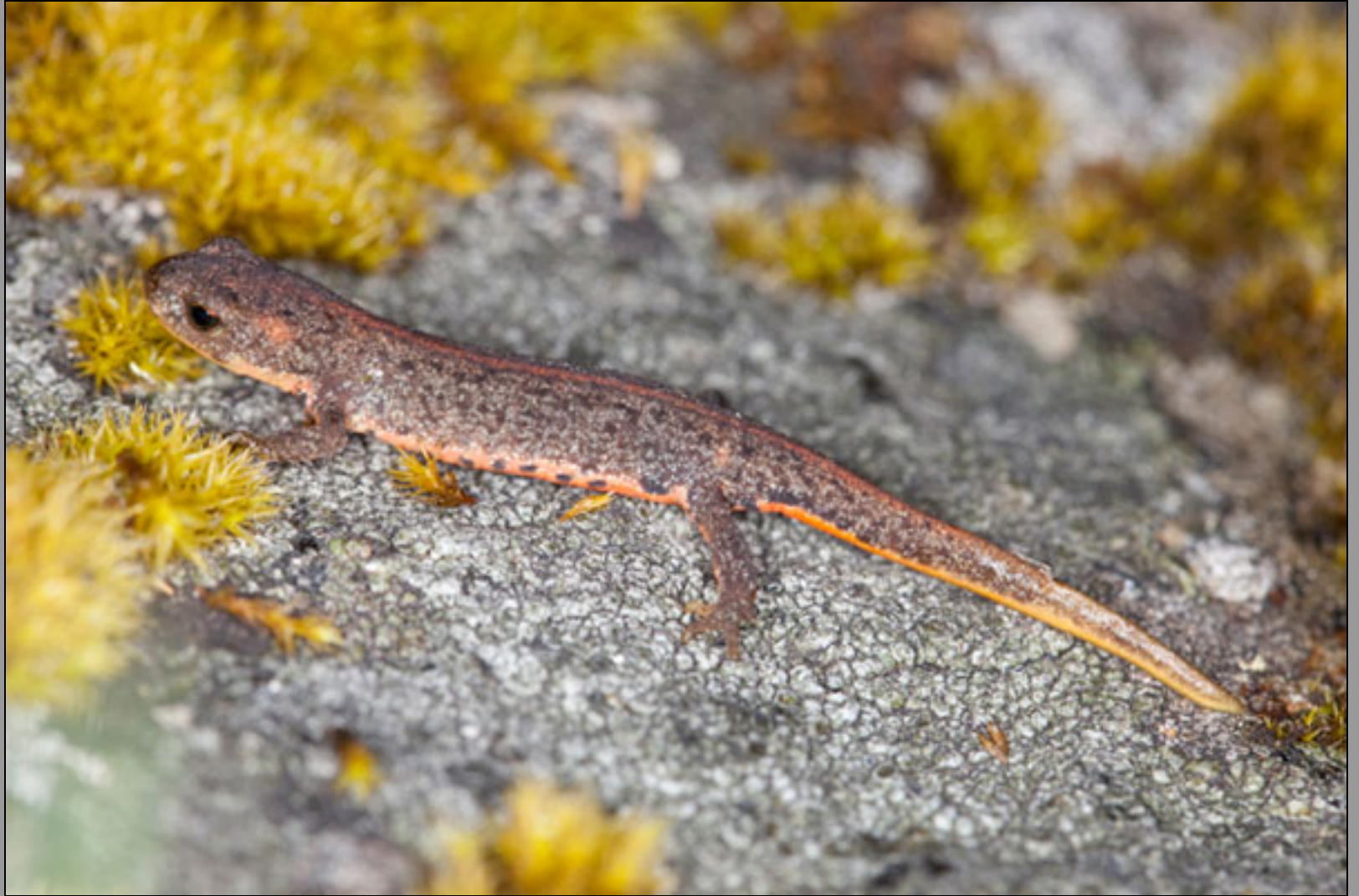
Lissotriton boscai , juvenile