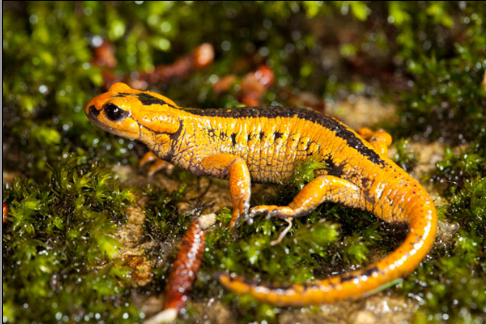
Salamandra salamandra bernardezi