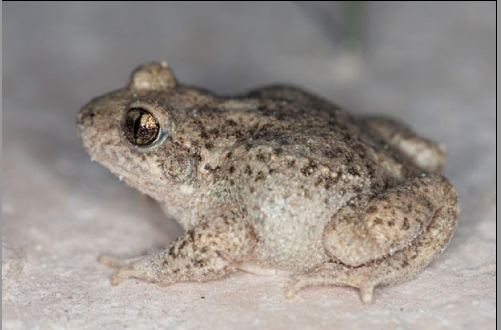
Alytes obstetricans pertinax