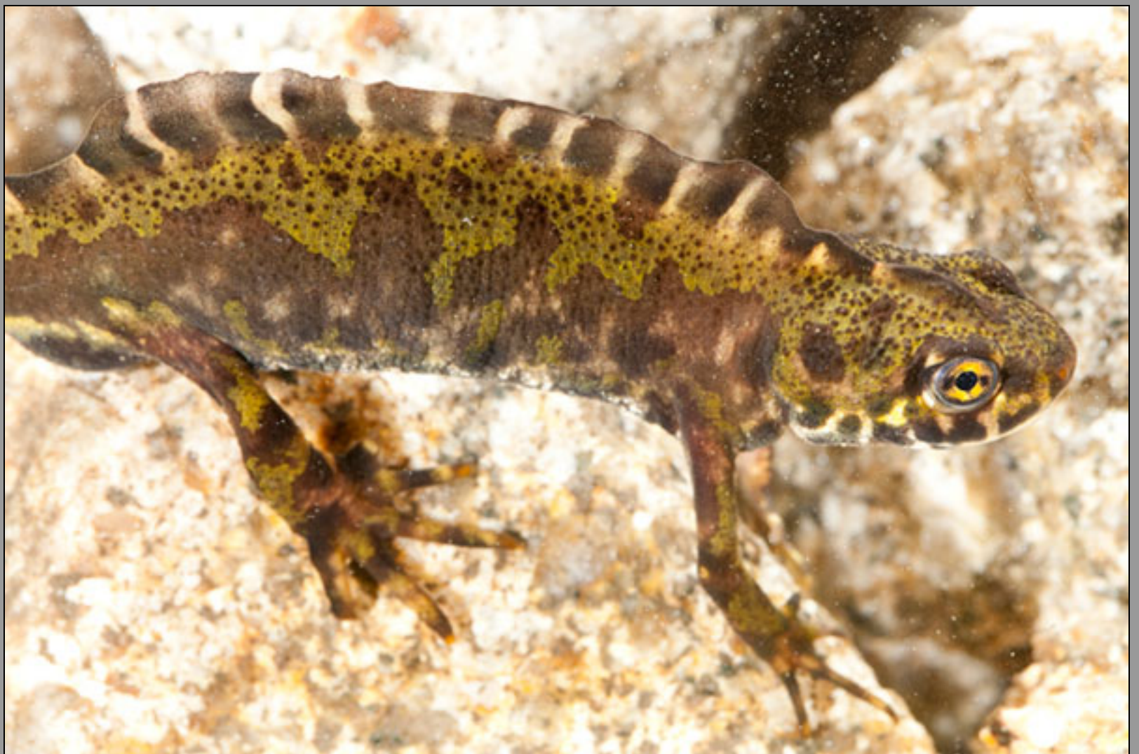
Triturus marmoratus , male