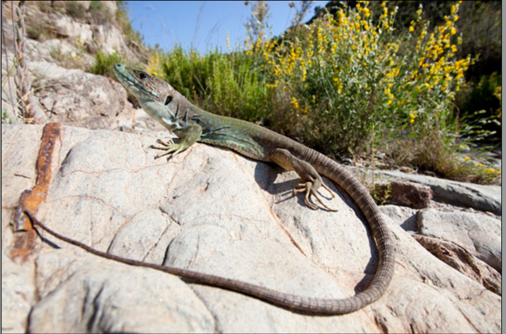
Timon lepidus nevadensis , male