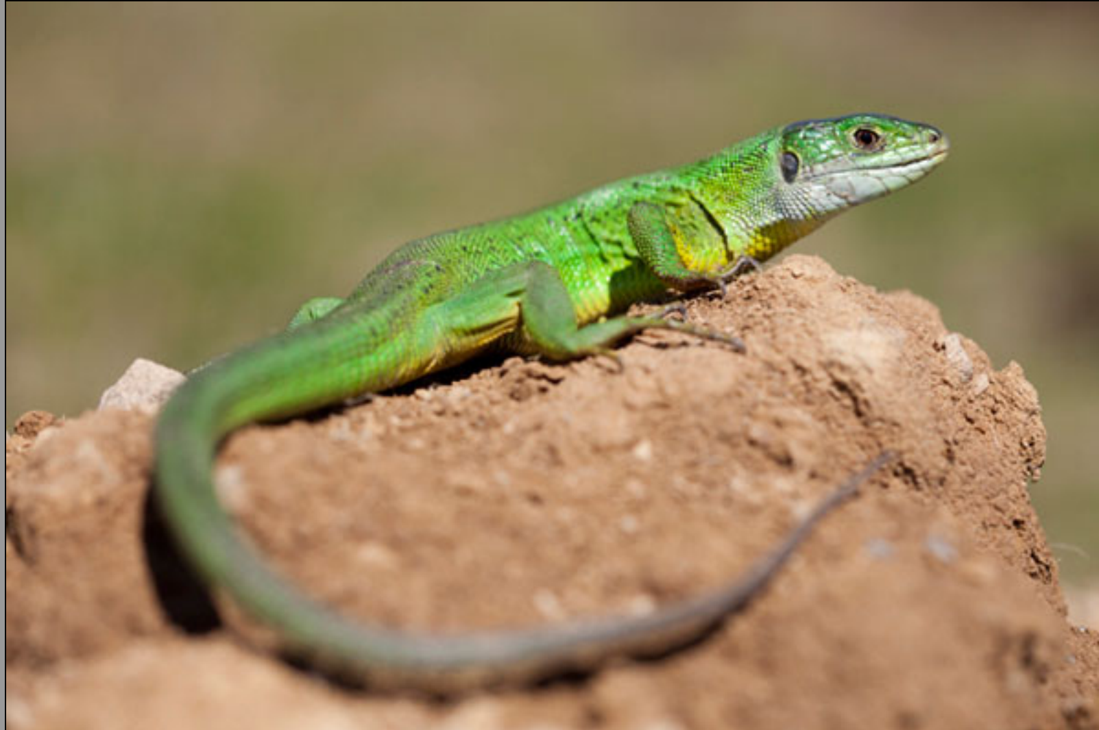
Lacerta bilineata , female