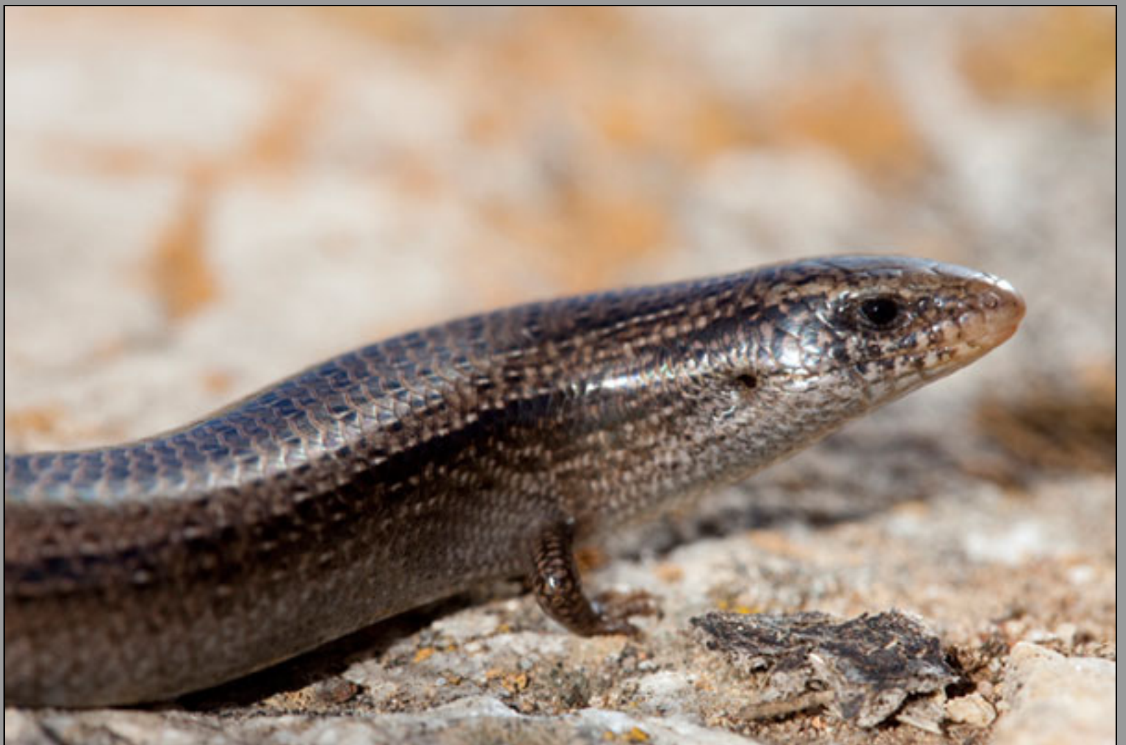
Chalcides bedriagae bedriagae