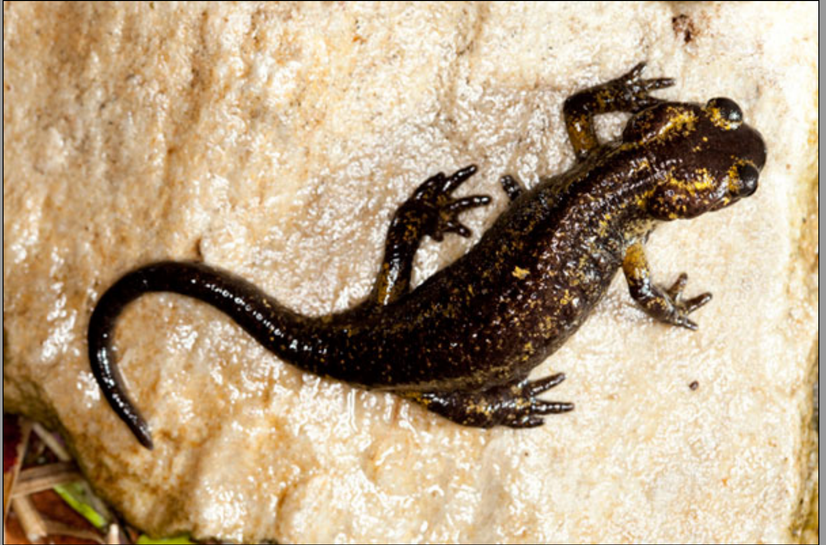
Salamandra salamandra bernardezi