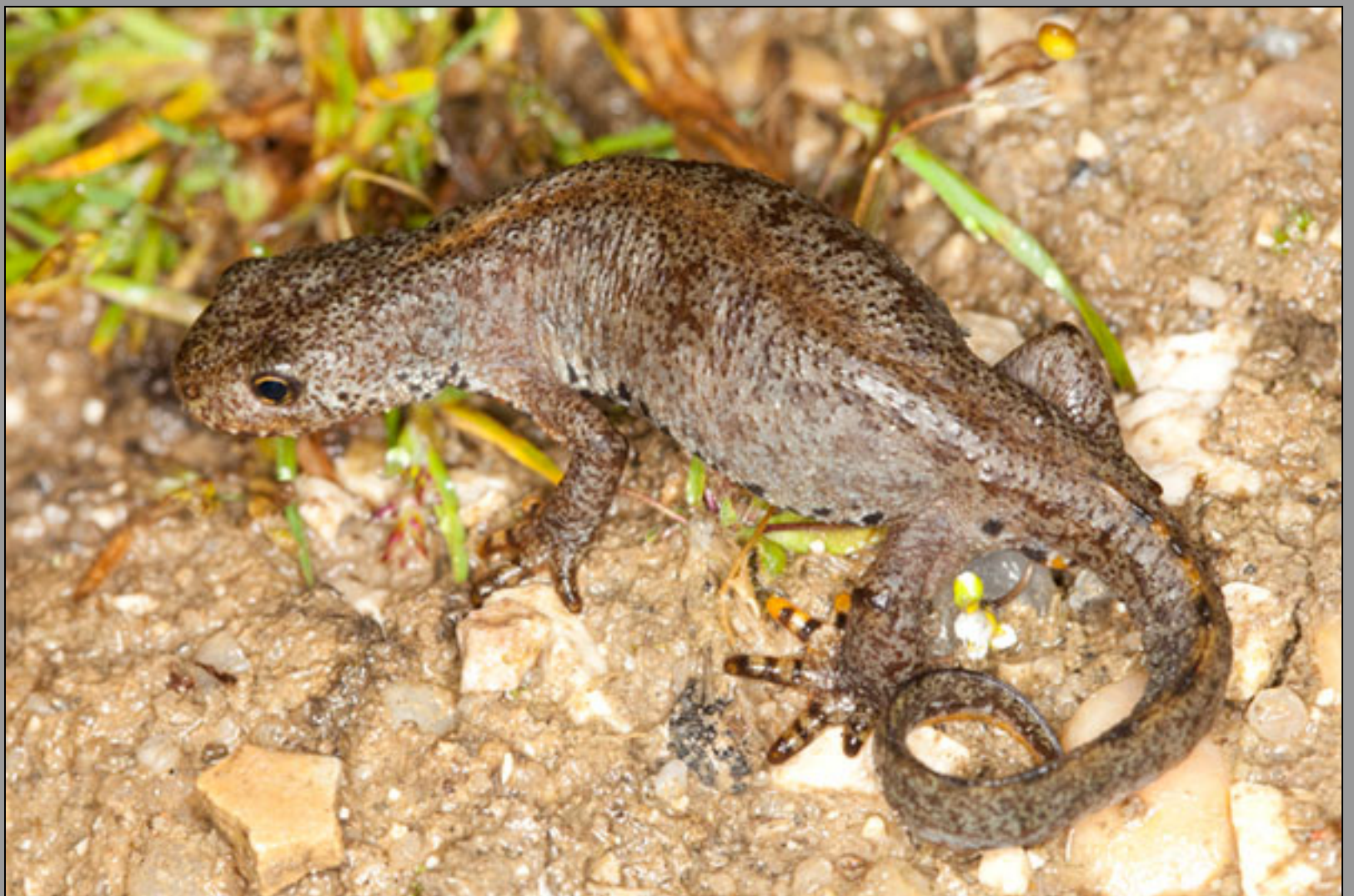
Ichthyosaura alpestris cyreni , female