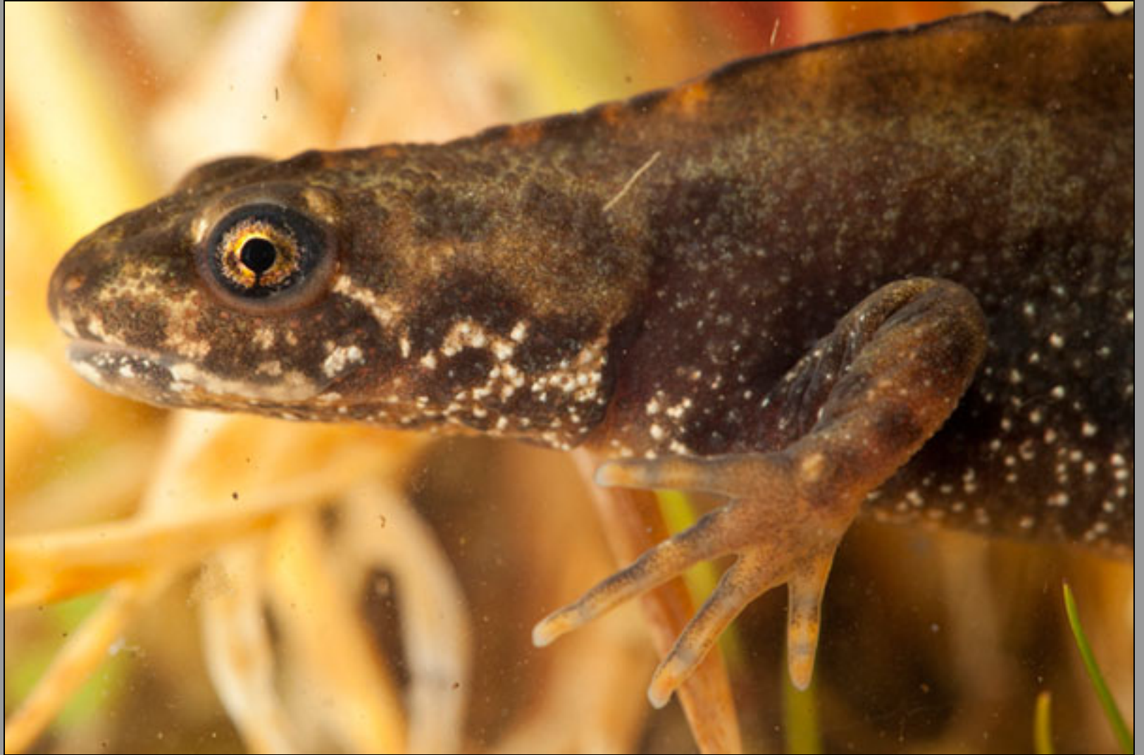
Triturus blasii , hybrid Triturus marmoratus x Triturus cristatus , male