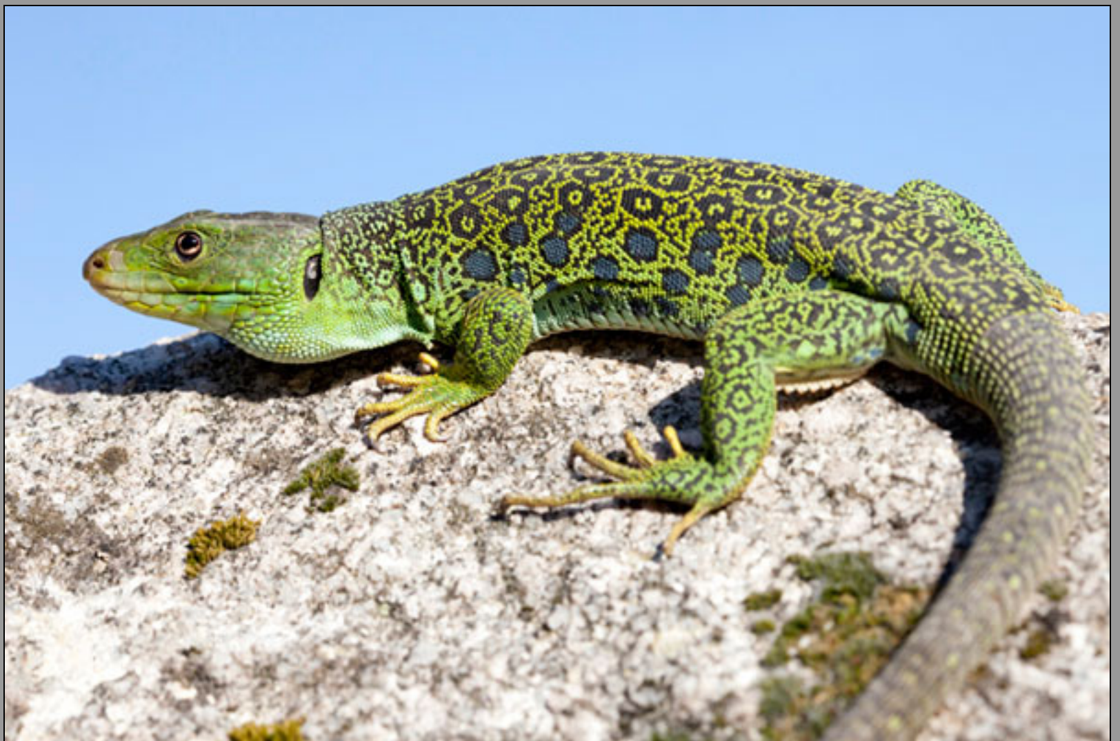
Timon lepidus ibericus