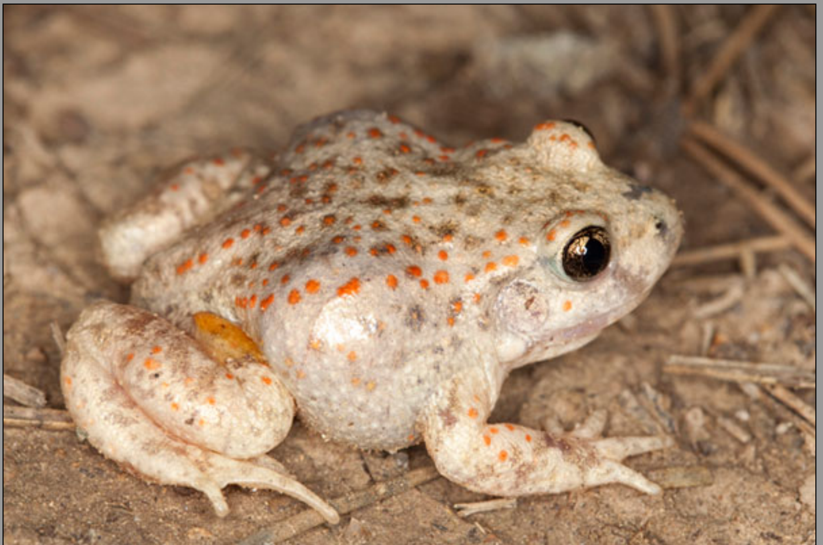
Alytes obstetricans pertinax