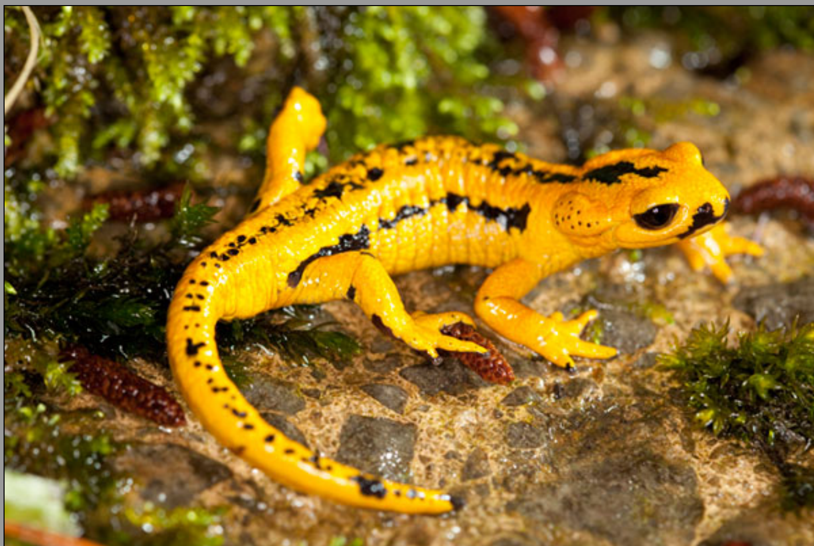
Salamandra salamandra bernardezi