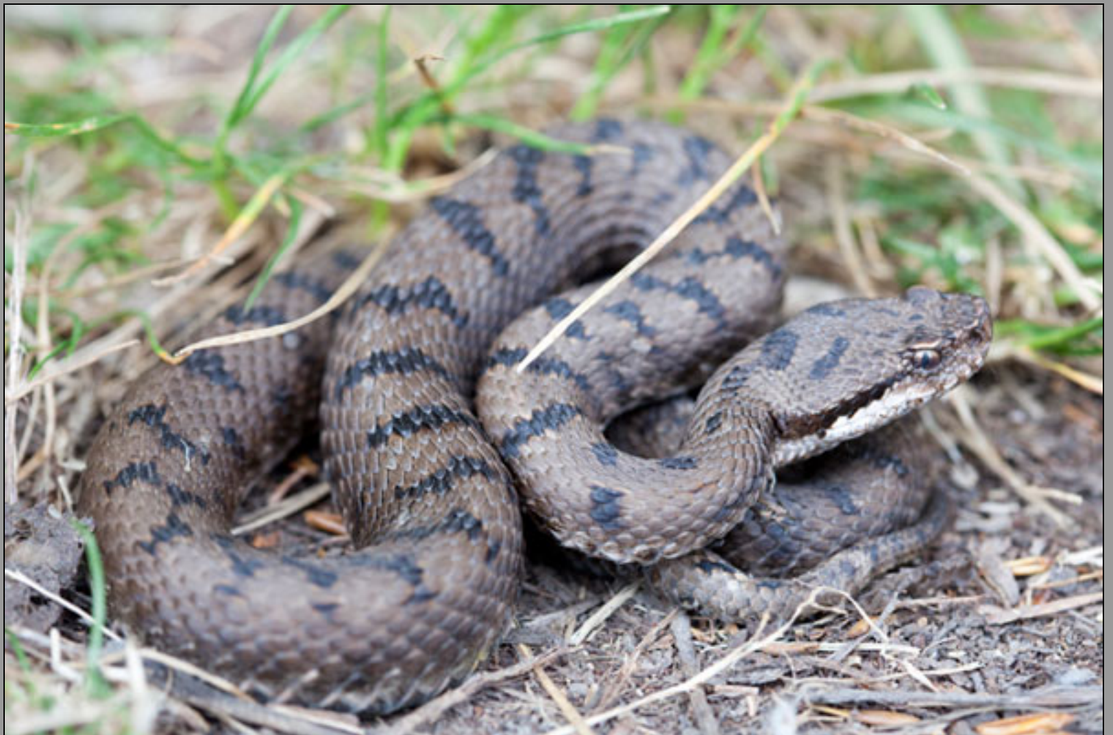
Vipera aspis aspis