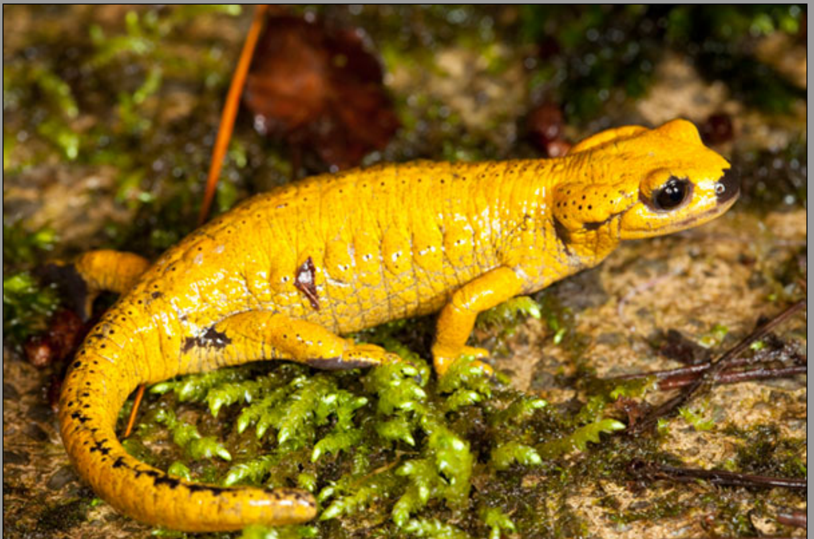
Salamandra salamandra bernardezi