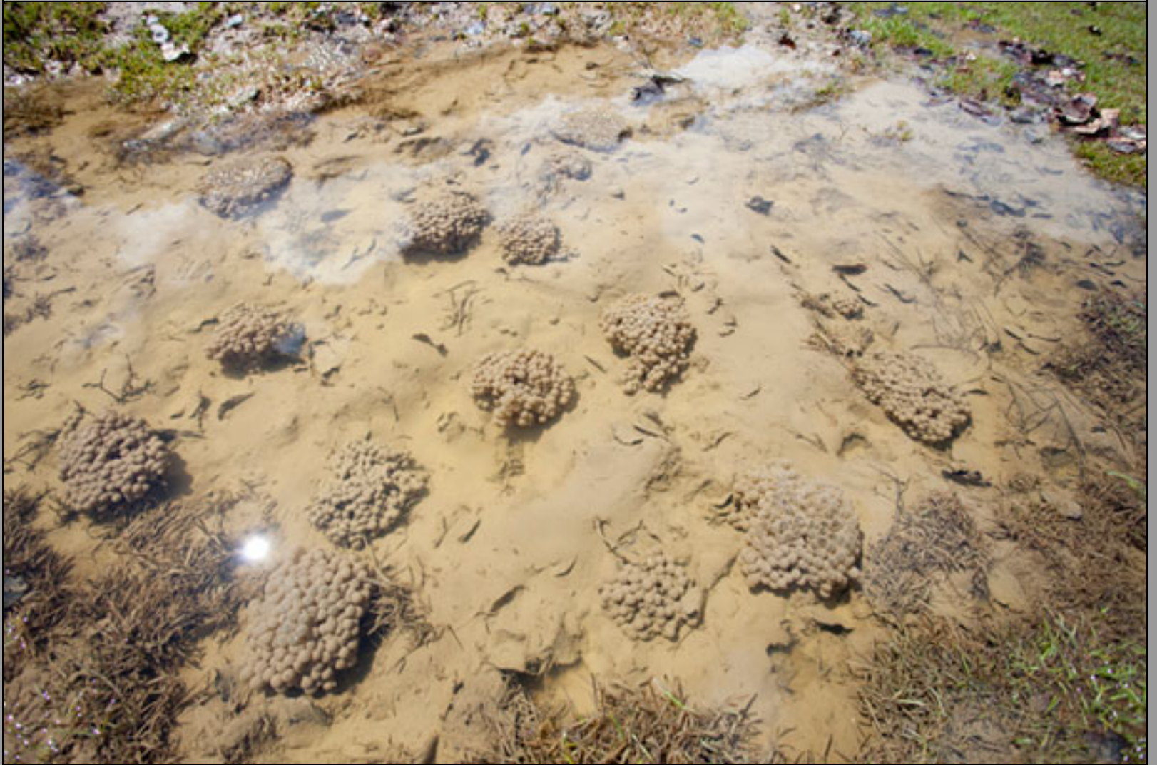
Rana temporaria , laying

On the other side of the valley, songs of Alytes obstetricans obstetricans in spite of the cold, as well as large tadpoles in a feeding trough, a few Lissotriton helveticus and larvae, and a Podarcis liolepis liolepis .