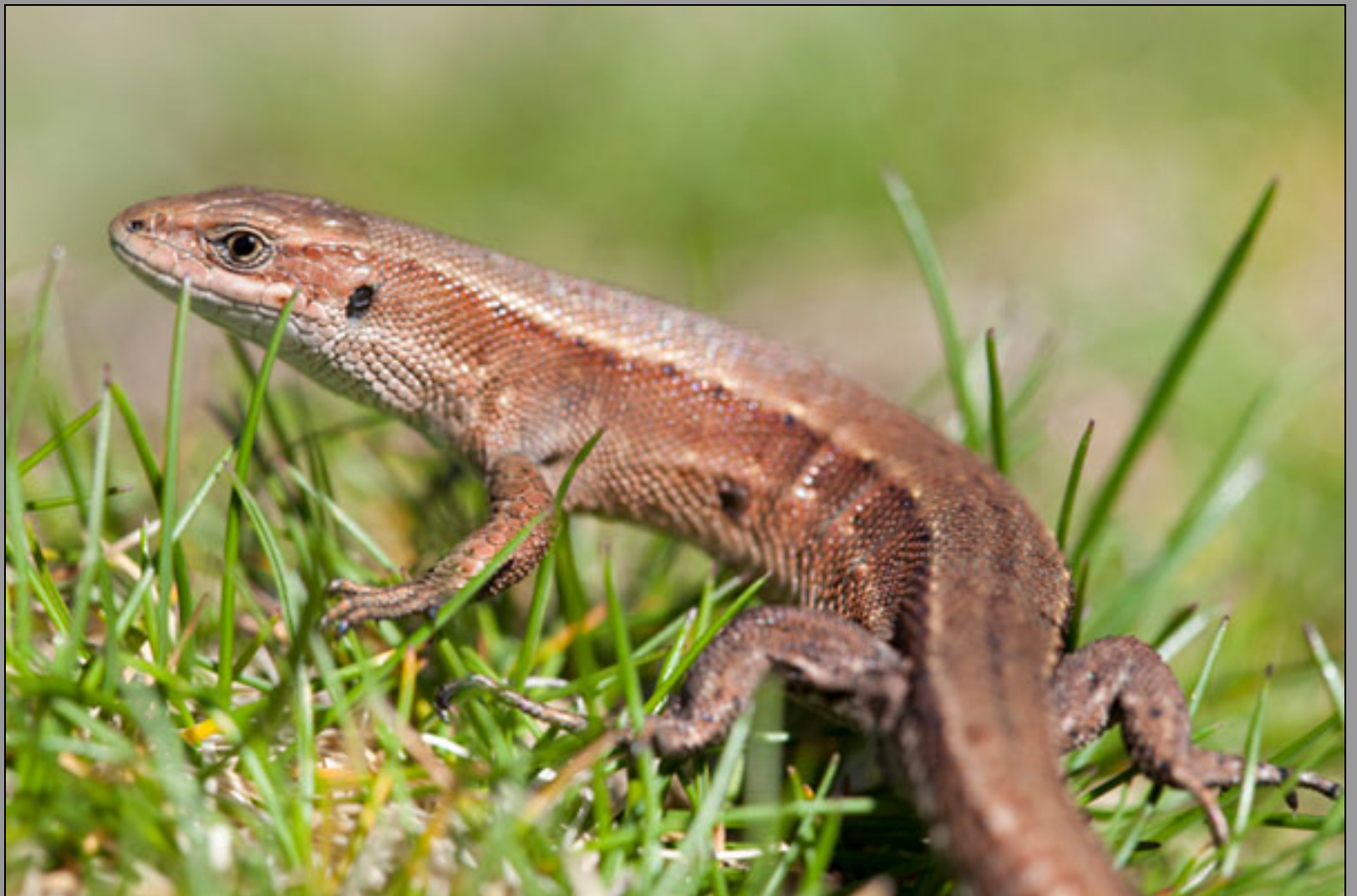
Zootoca vivipara lousiantzi