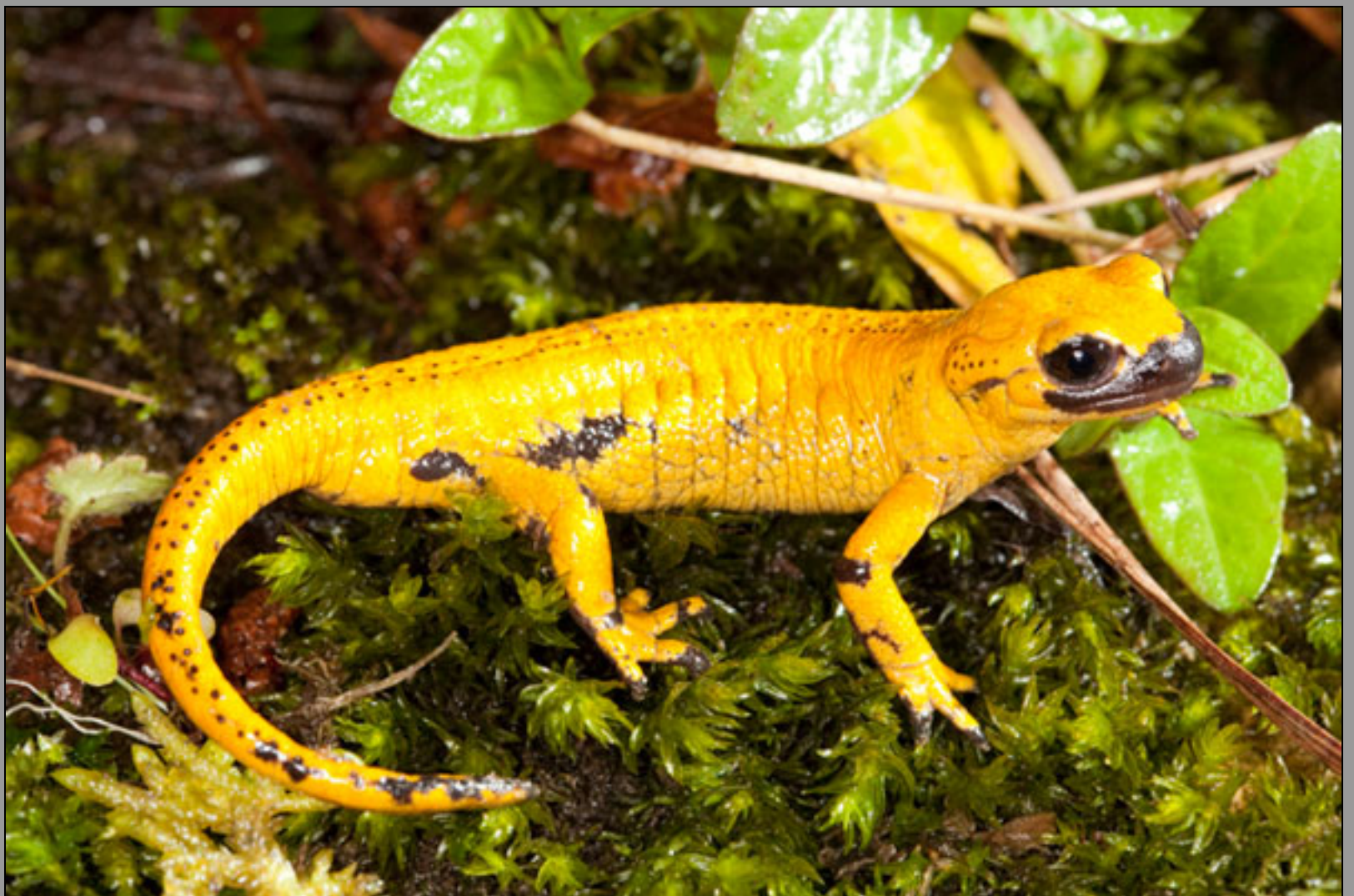
Salamandra salamandra bernardezi