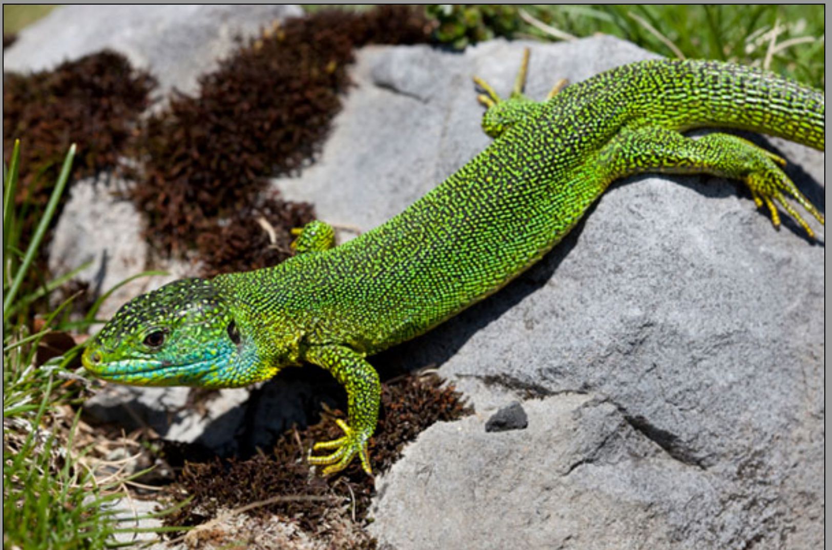
Lacerta bilineata , male