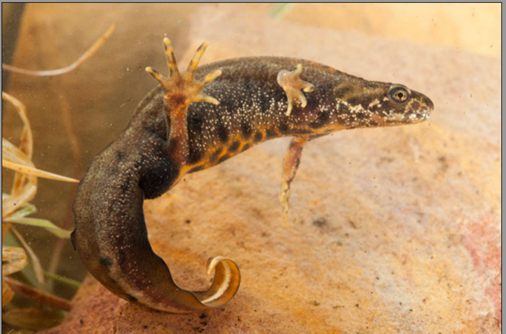
Triturus blasii , hybrid Triturus marmoratus x Triturus cristatus , male