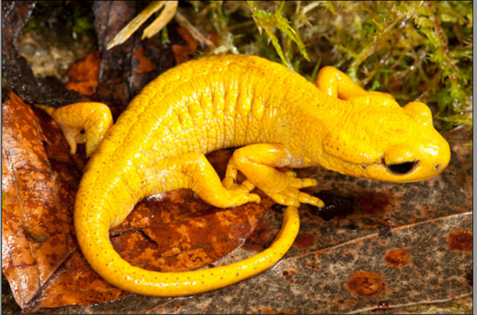
Salamandra salamandra bernardezi