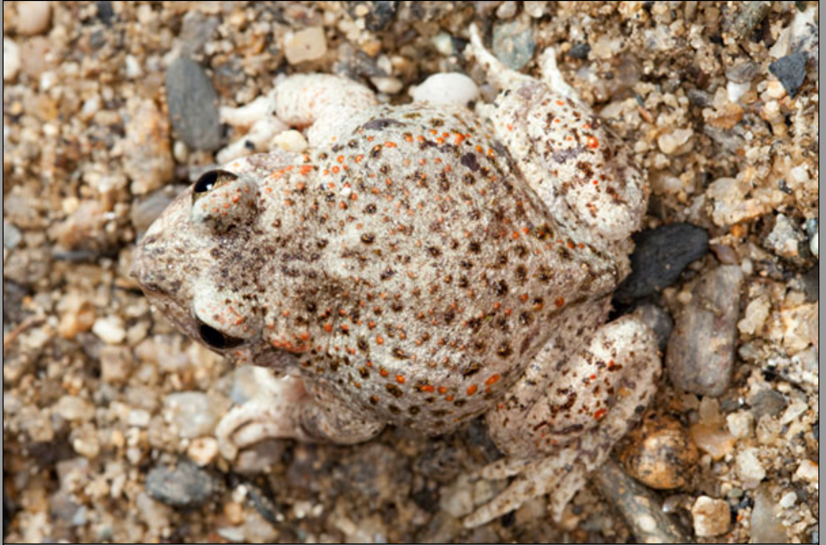
Alytes obstetricans boscai

PENEDA-GERES (Portugal) : T° : about 25°c day