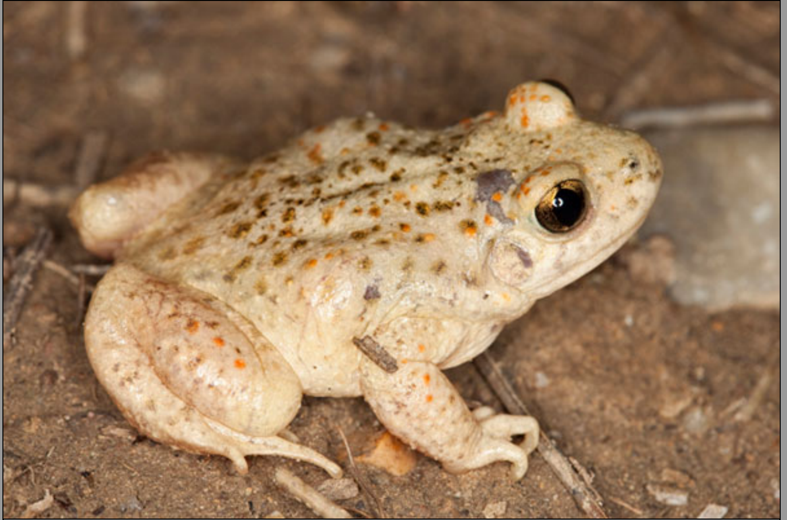
Alytes obstetricans pertinax