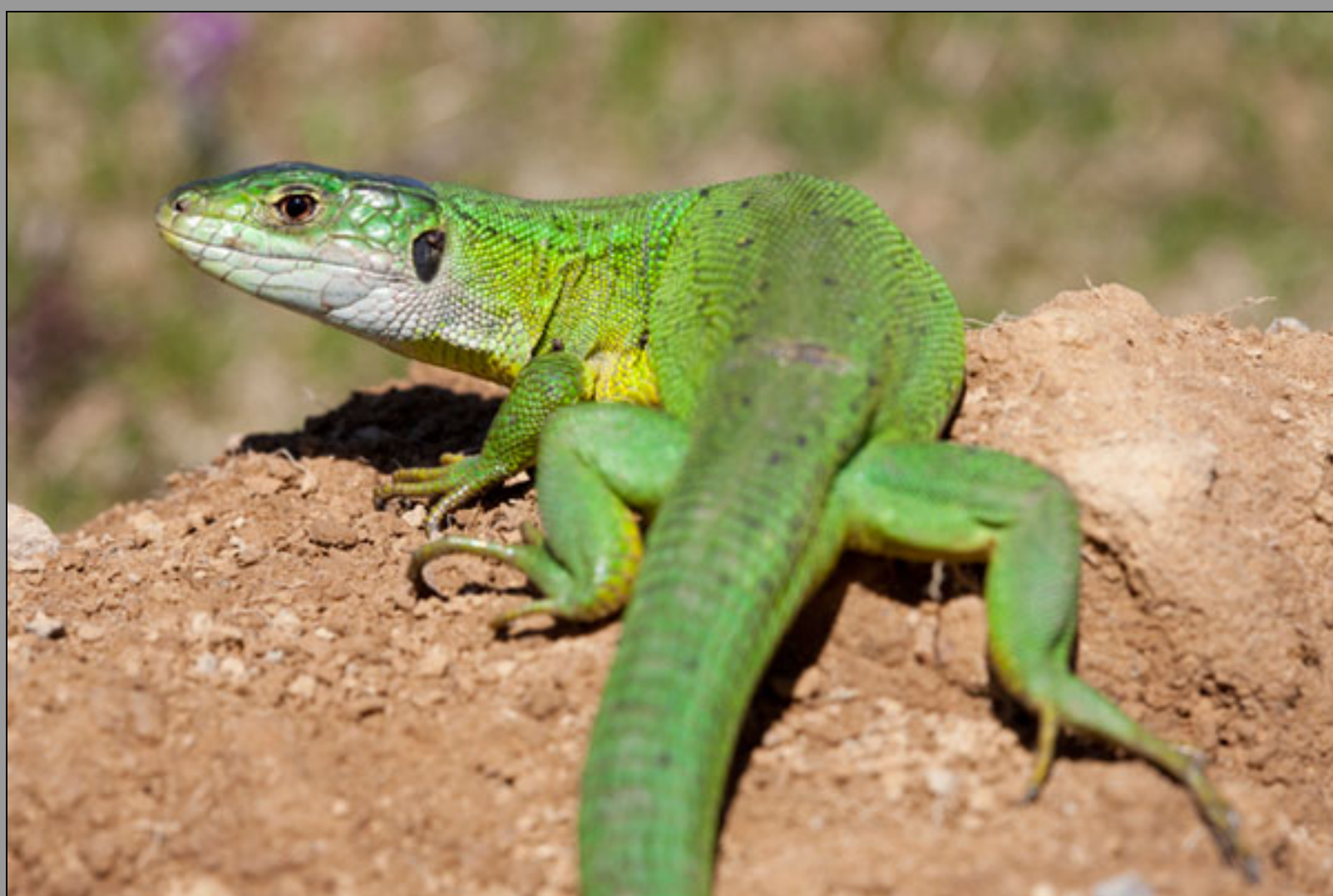
Lacerta bilineata , female