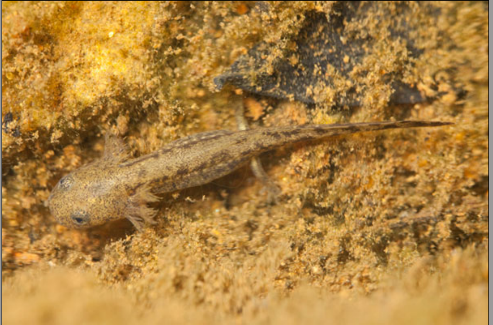
Salamandra salamandra bejarae , larva