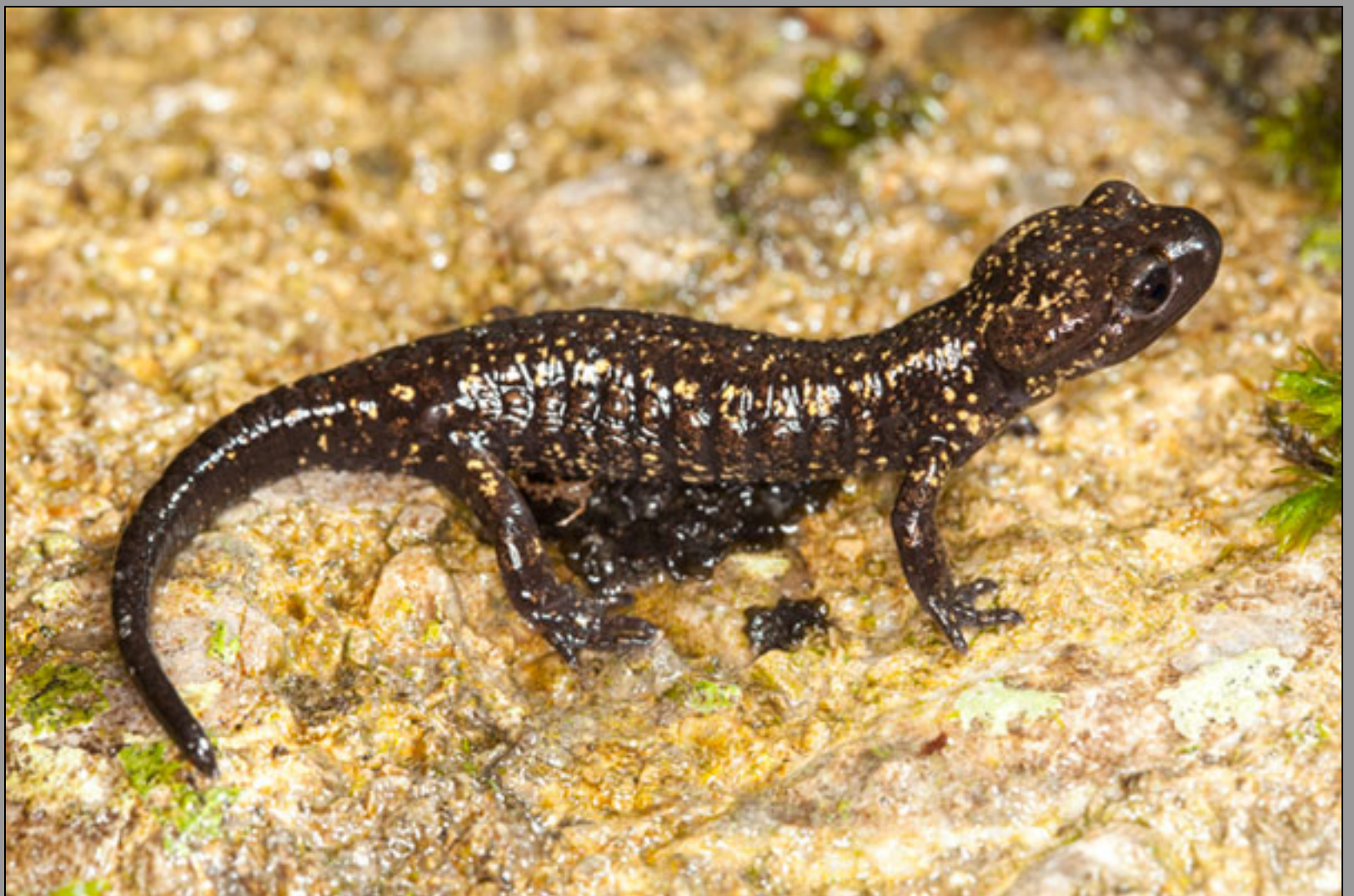
Salamandra salamandra bernardezi