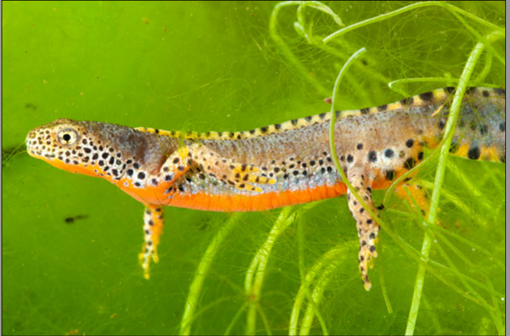
Ichthyosaura alpestris cyreni , male