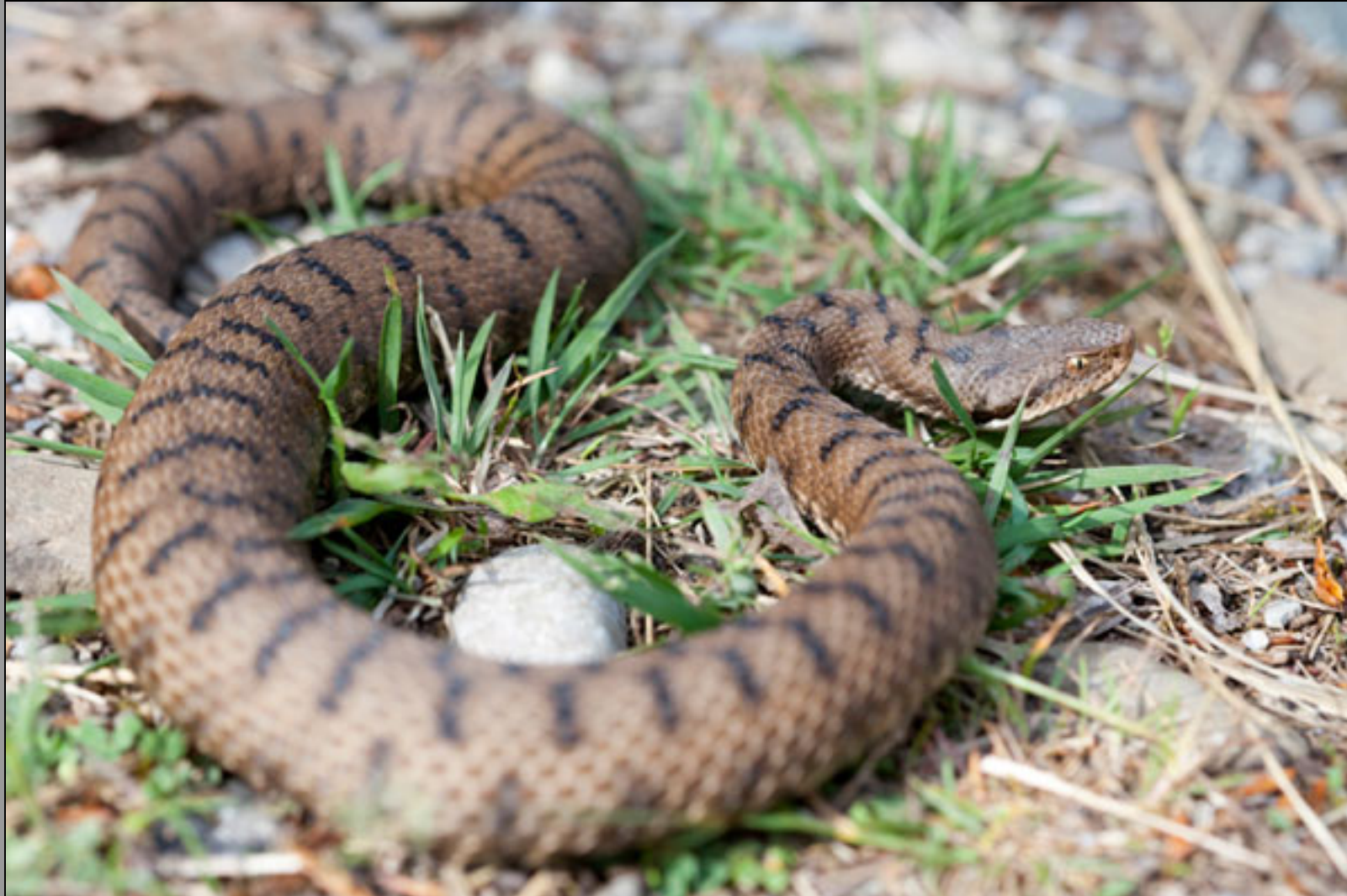
Vipera aspis aspis