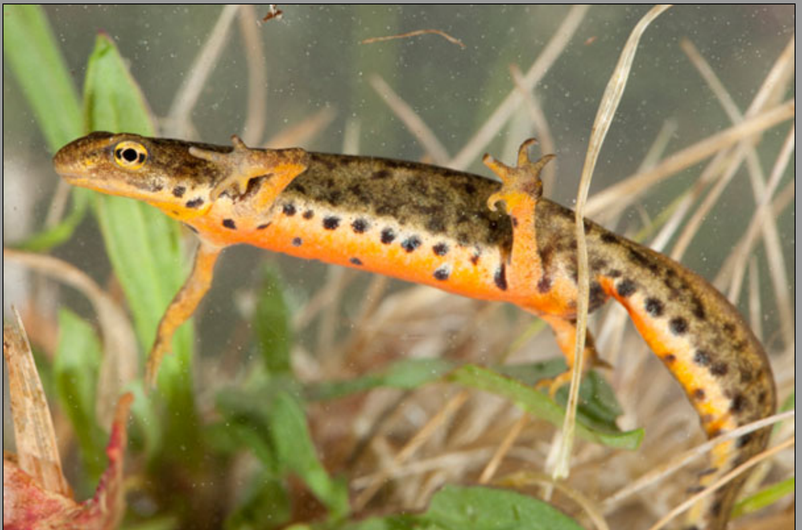
Lissotriton boscai , male