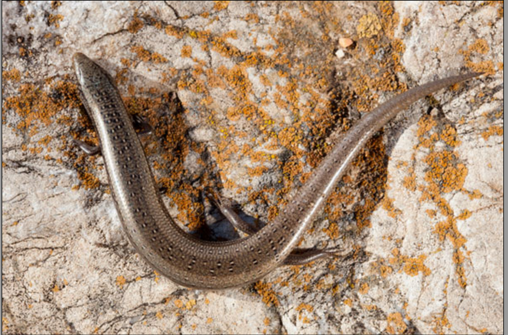
Chalcides bedriagae bedriagae