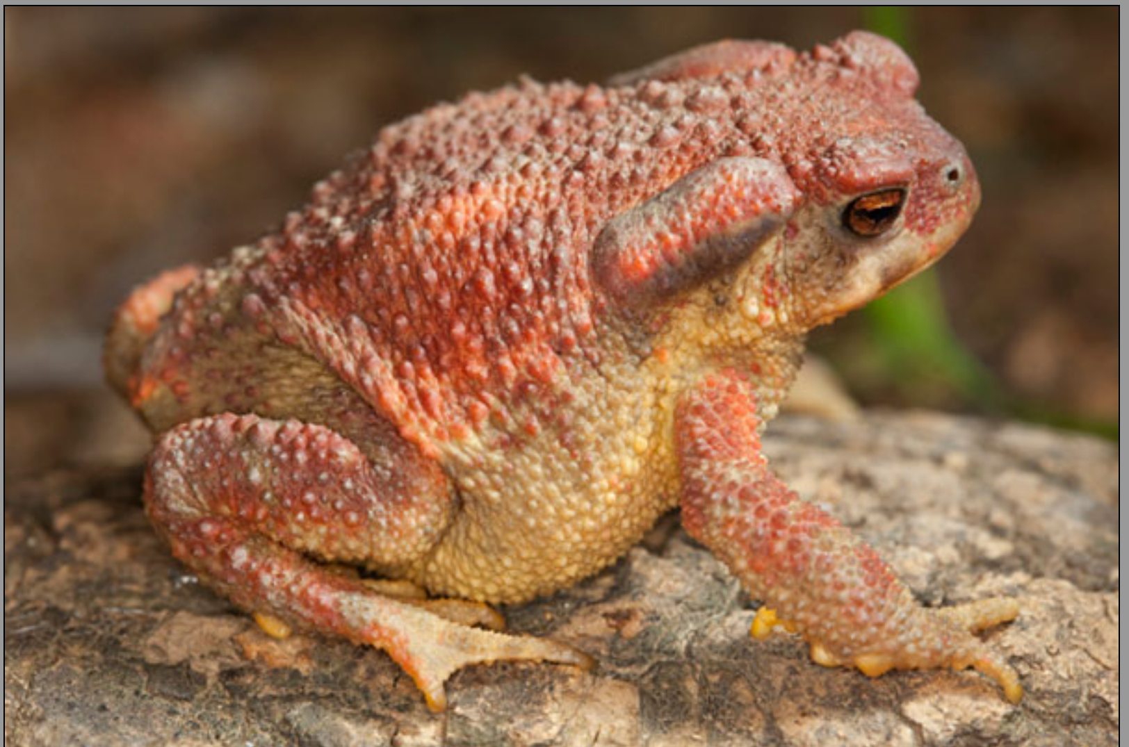
Bufo spinosus , reddish