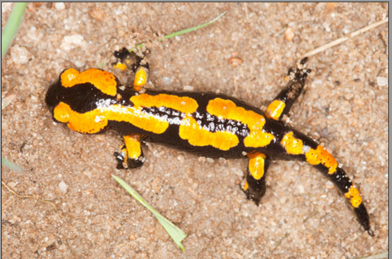
Salamandra salamandra bejarae x S. s. fastuosa , reddish young