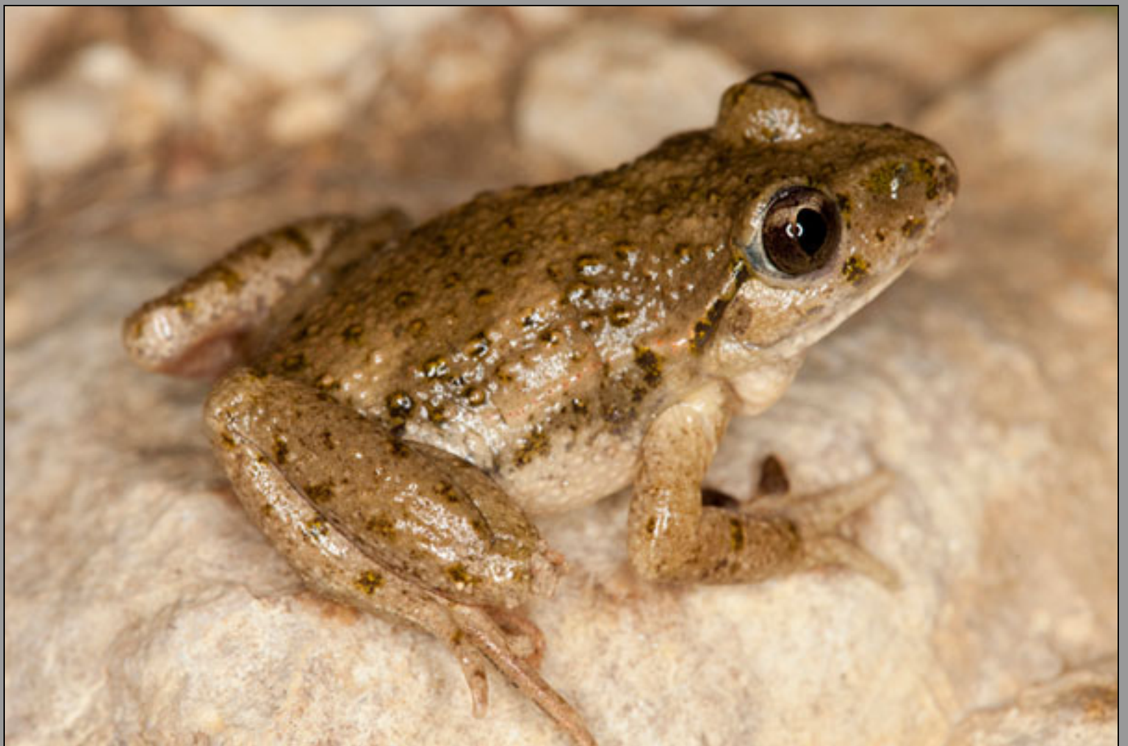
Pelodytes sp. nov