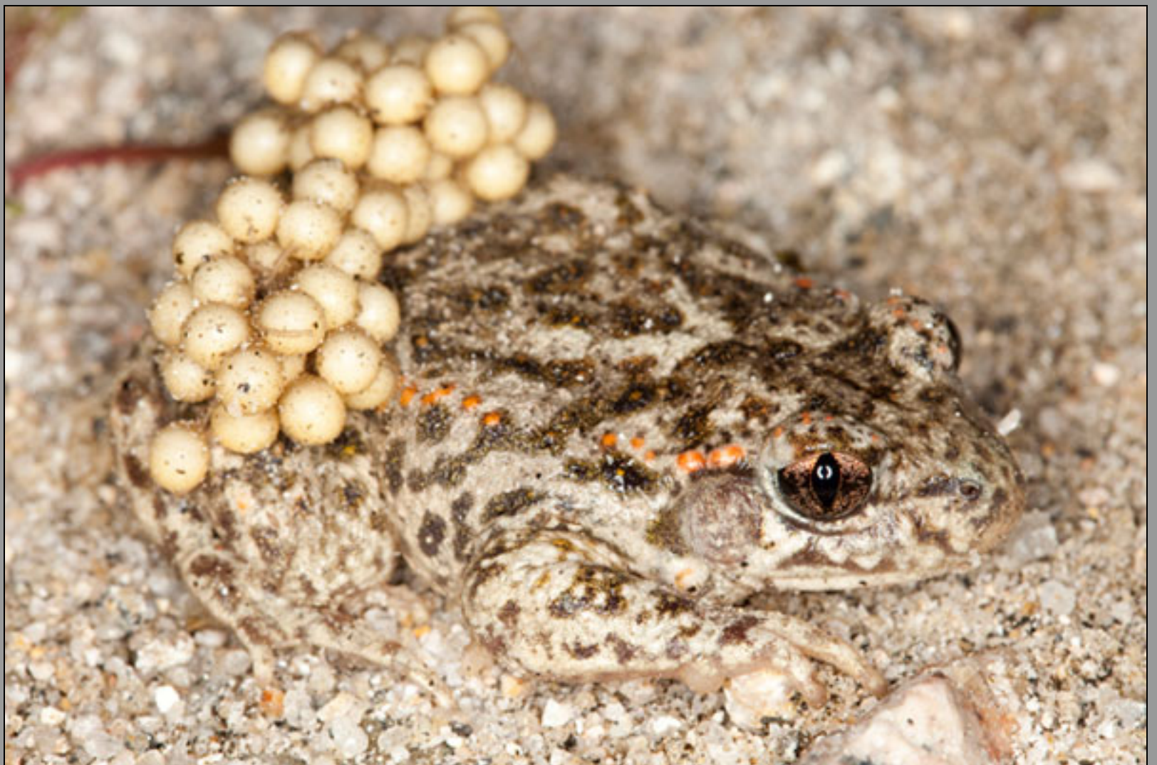
Alytes obstetricans boscai