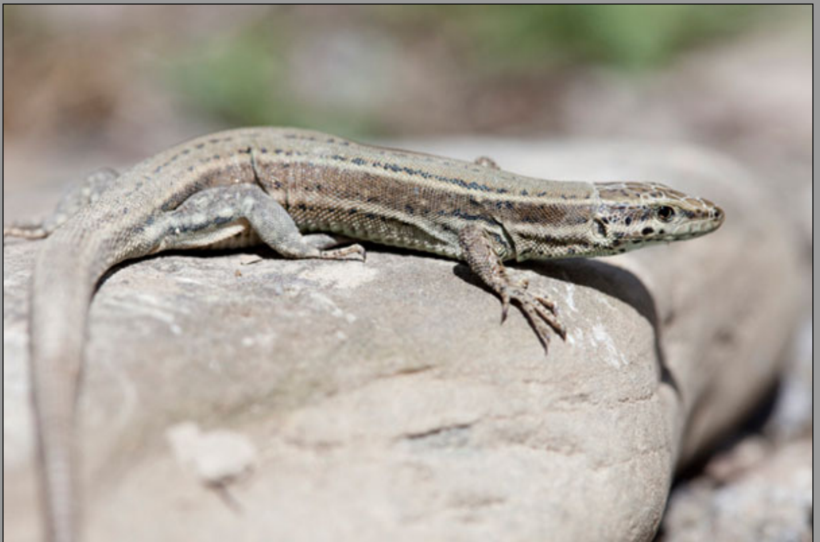
Podarcis liolepis liolepis