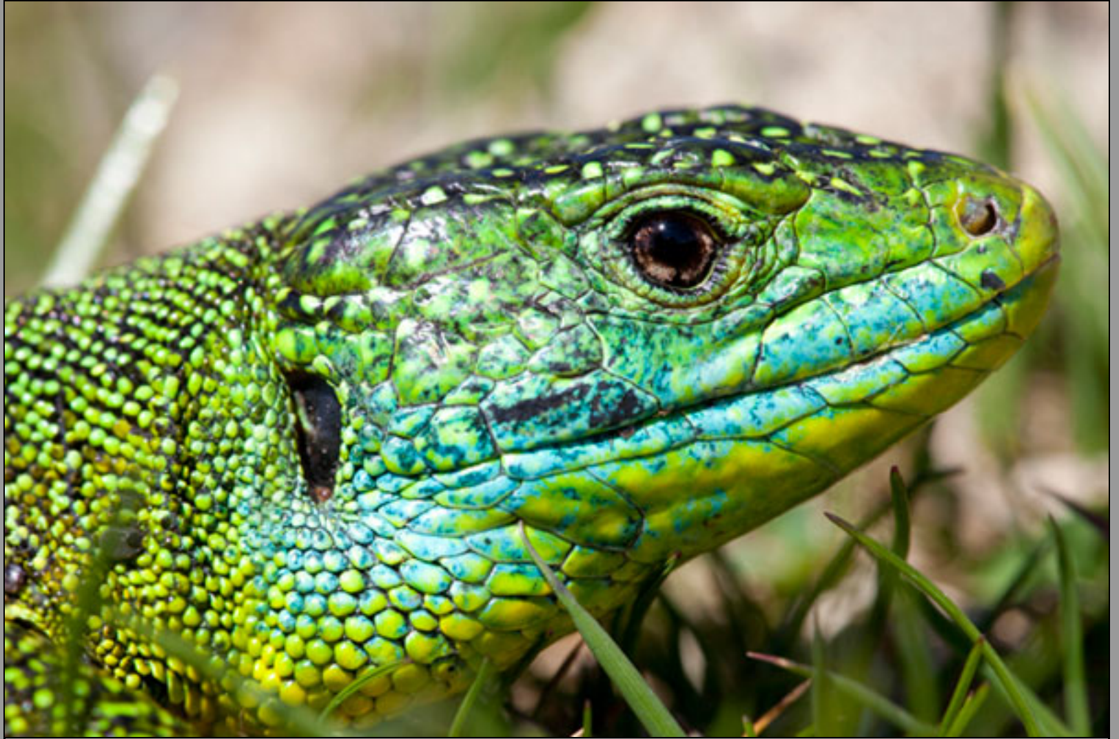
Lacerta bilineata , male