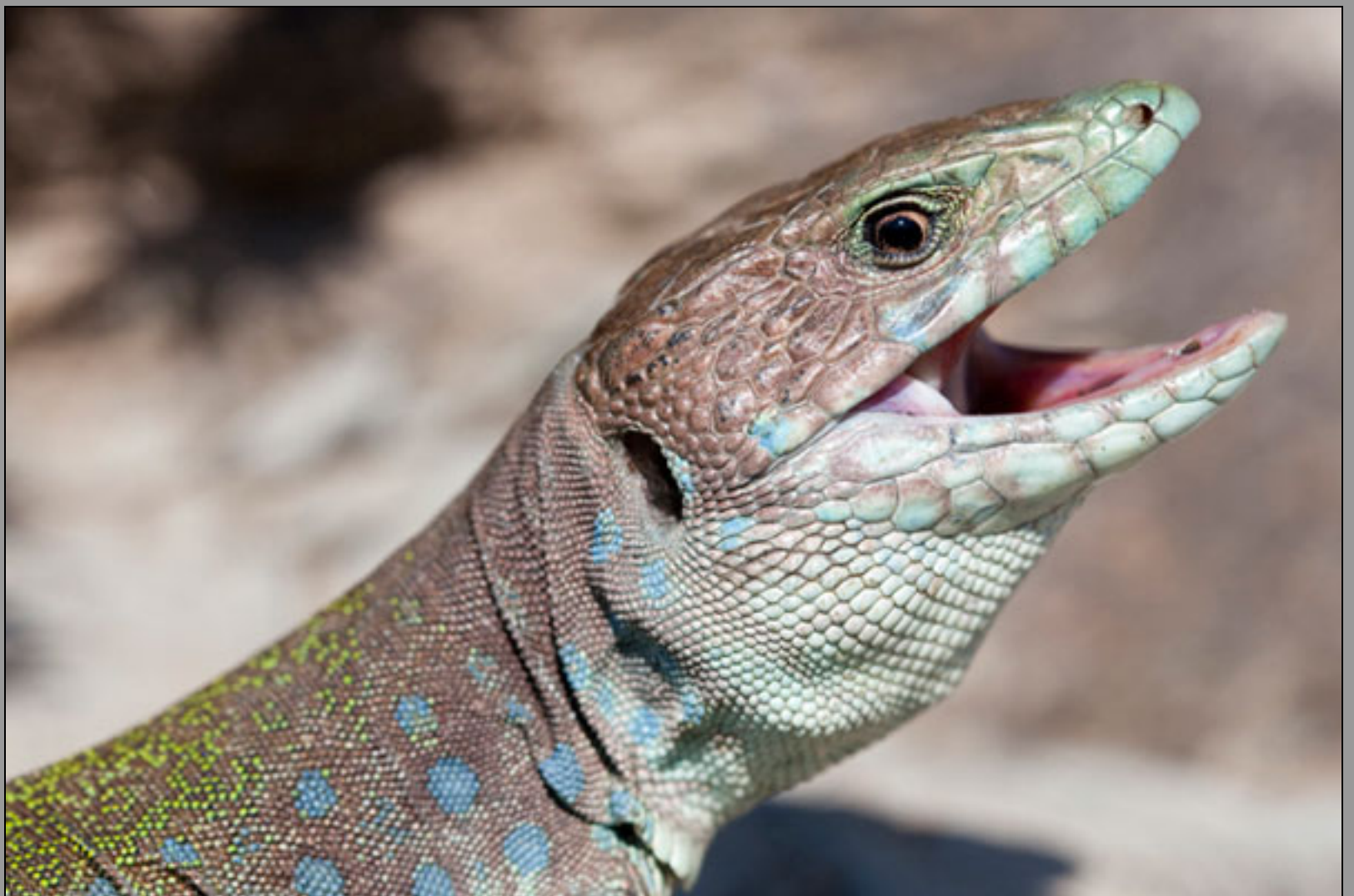
Timon lepidus nevadensis , male, total size 53 cm