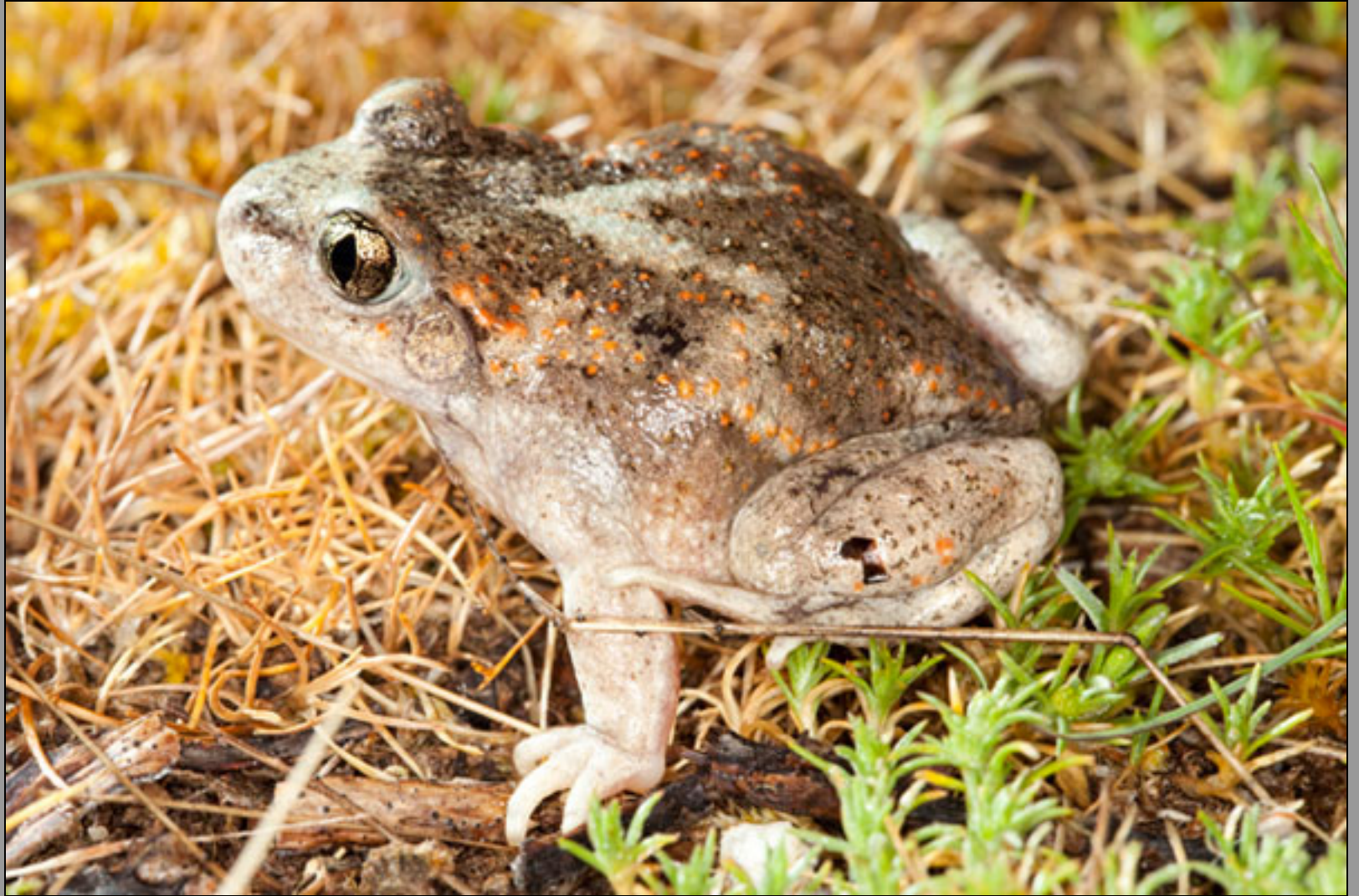
Alytes obstetricans boscai