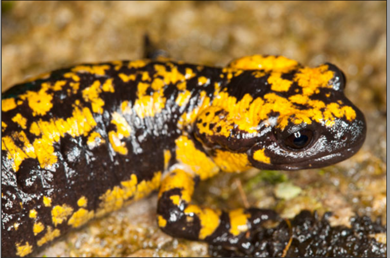
Salamandra salamandra bernardezi