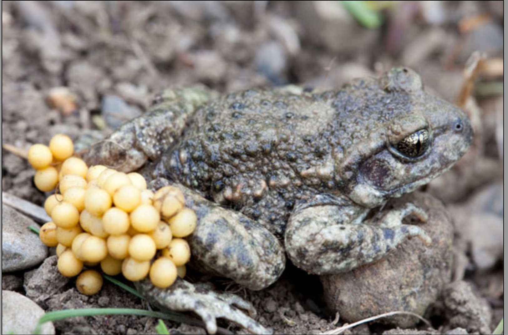
Alytes obstetricans obstetricans

Last visited site, I went in a place where it is possible to observe melanic Vipera berus . After one hour, in spite of an unfavourable time (very windy) I found a nice specimen and also a Rana dalmatina . I left to Le Havre the same day.