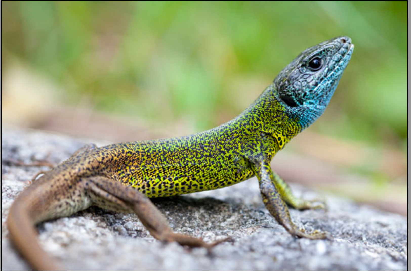
Lacerta schreiberi , male