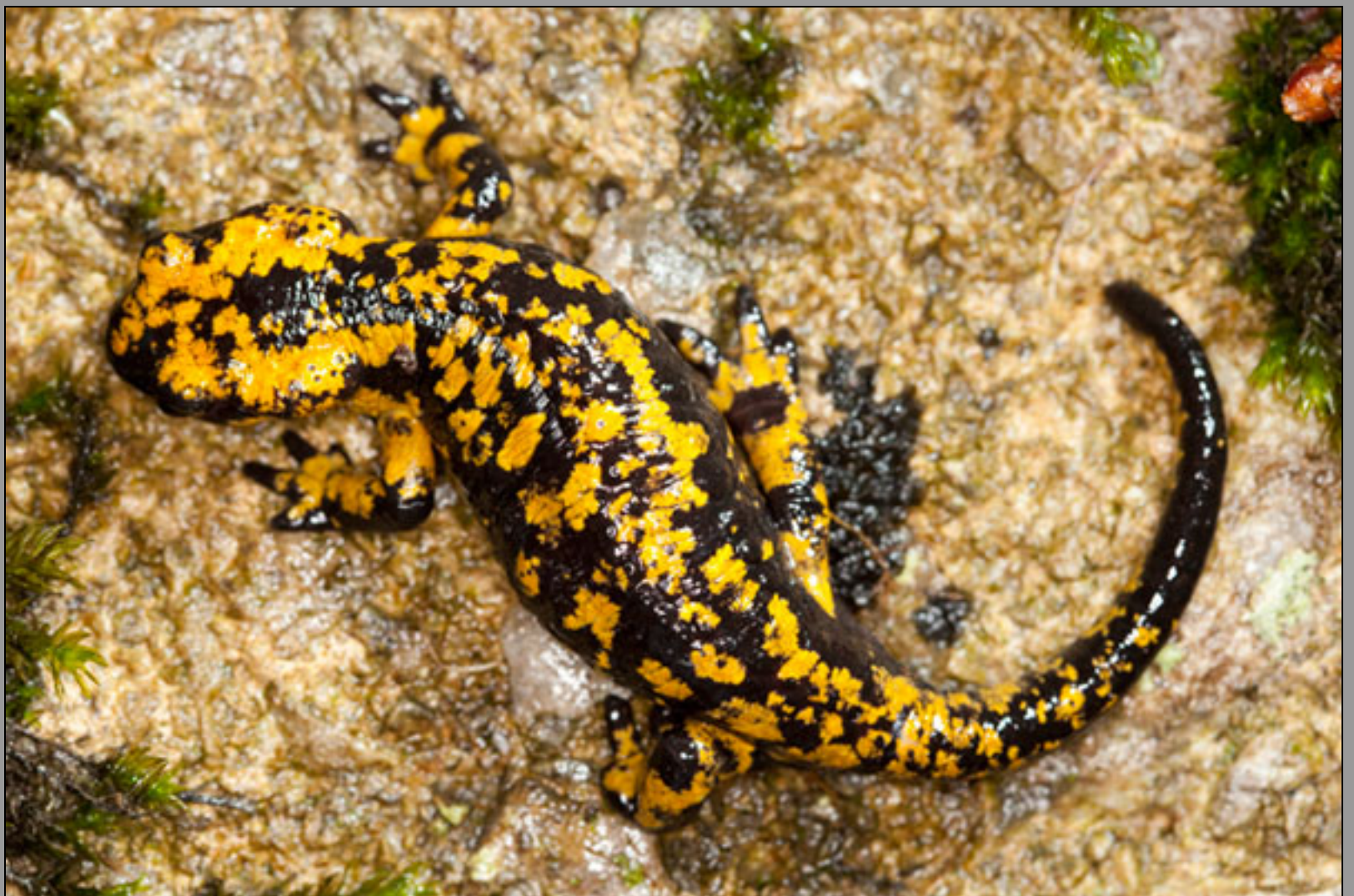
Salamandra salamandra bernardezi