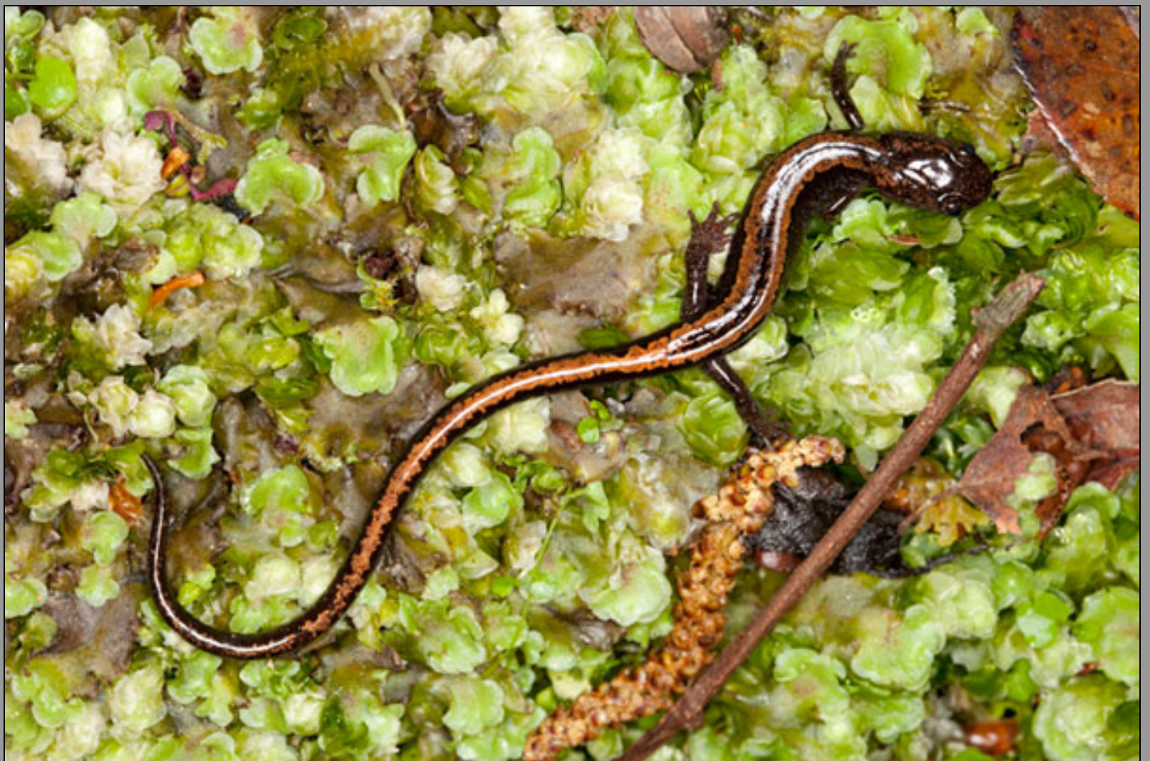
Chioglossa lusitanica longipes