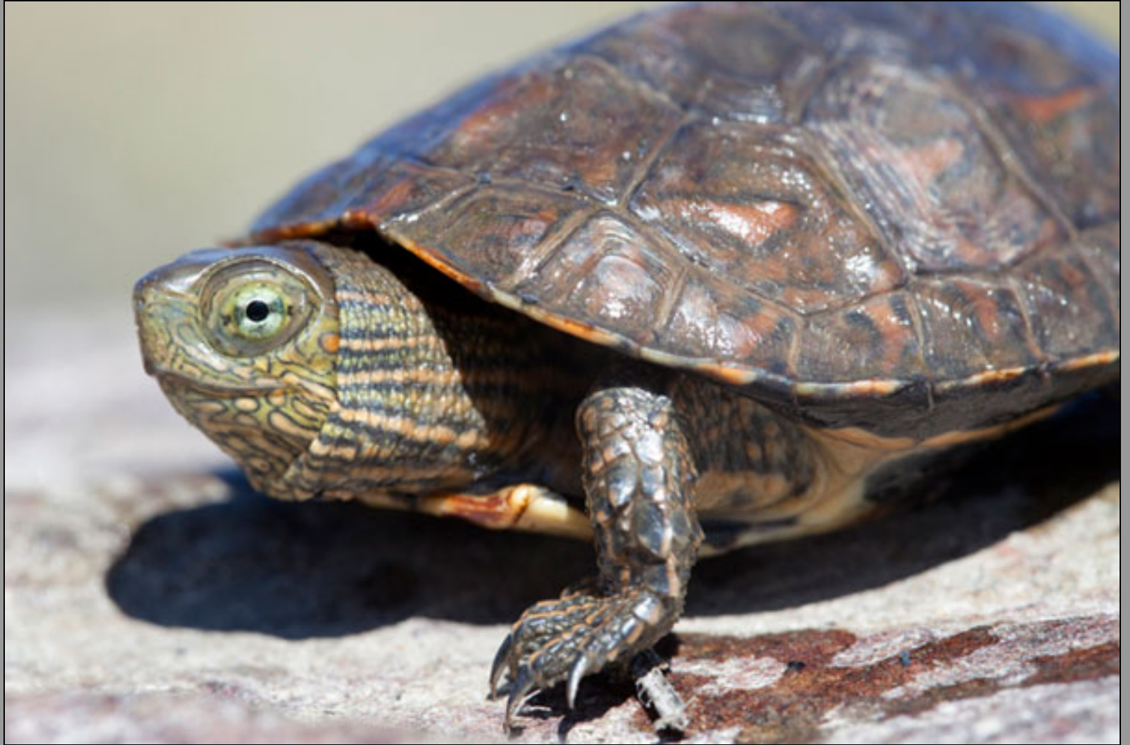
Mauremys leprosa , juvenile