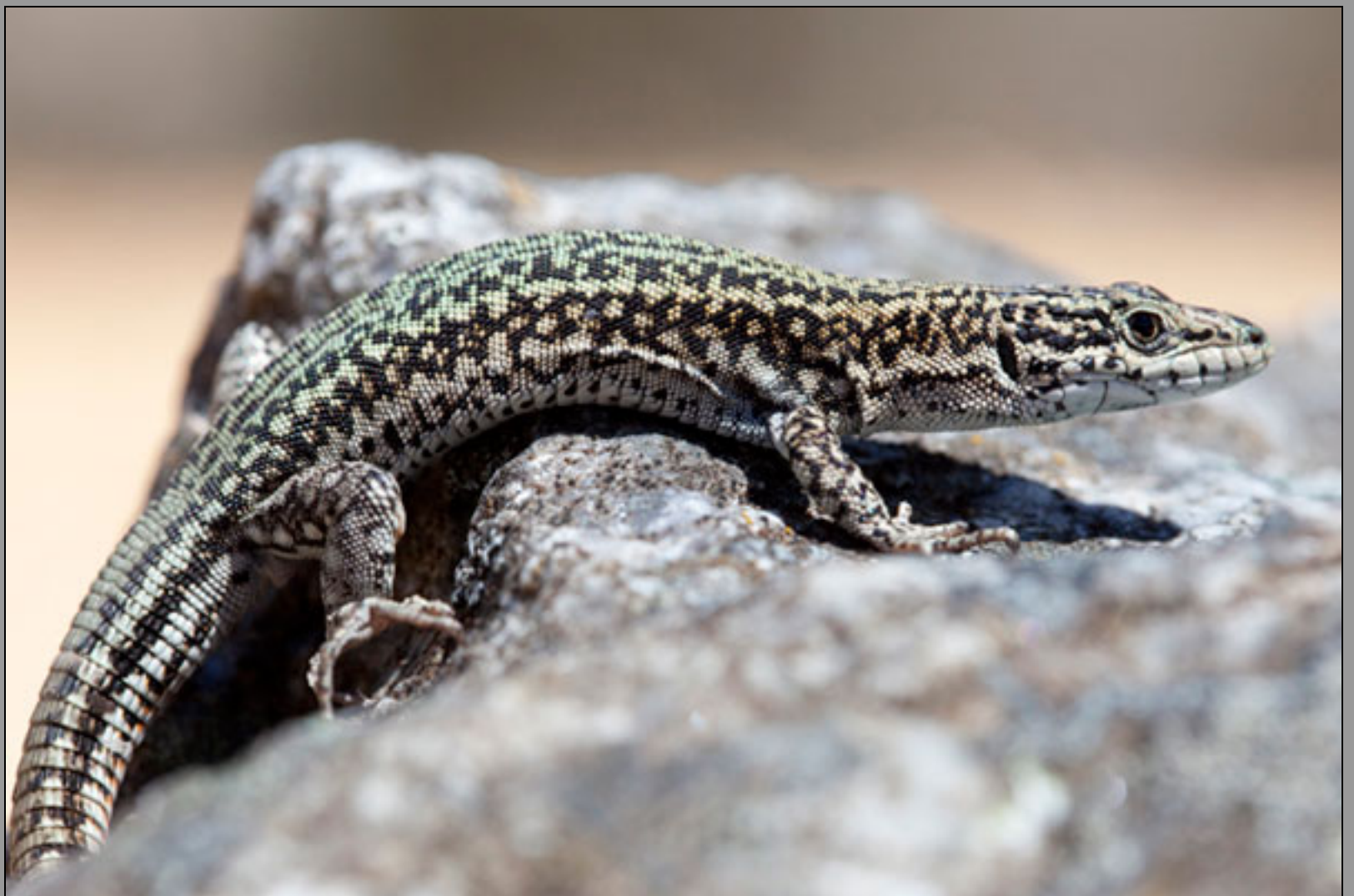
Podarcis guadarramae lusitanicus