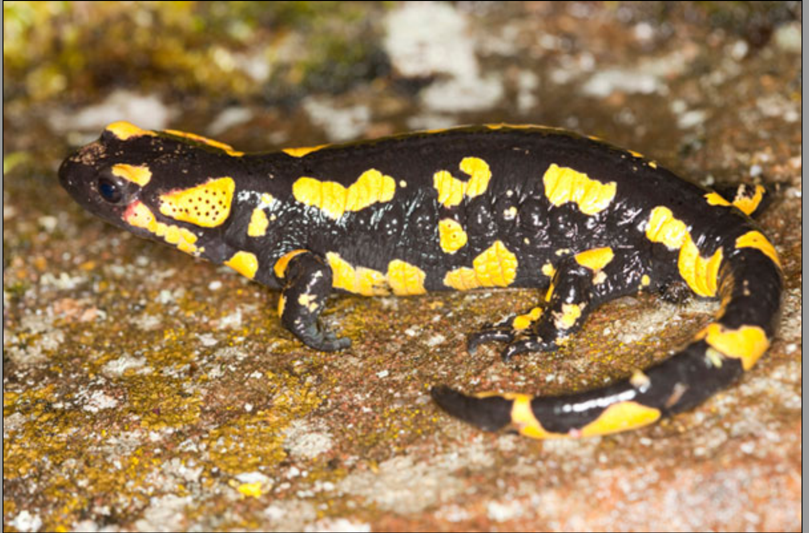
Salamandra salamandra bejarae x S. s. fastuosa , female