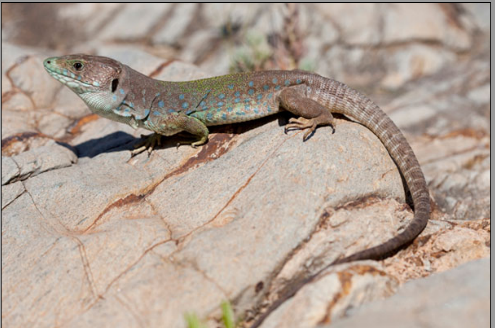
Timon lepidus nevadensis , male

A short video of the « beast » (about 11 Mo, you need the last Quicktime or iTunes or VLC...) :