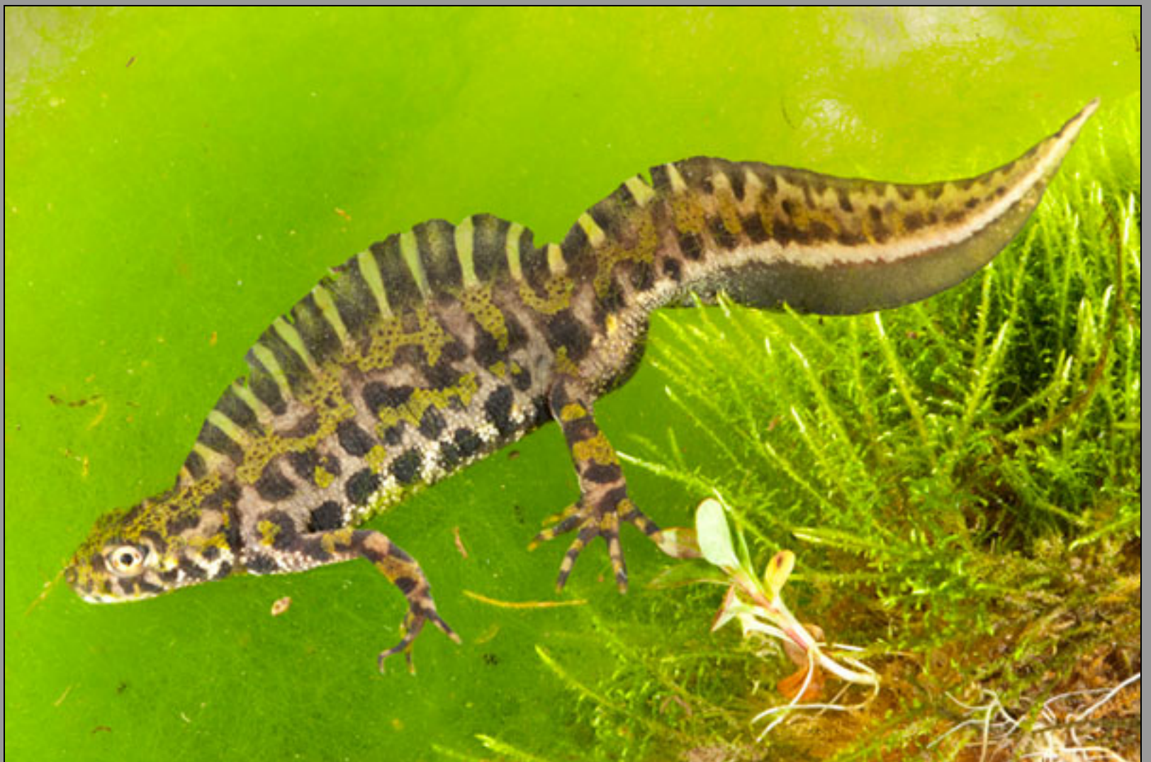
Triturus marmoratus , male