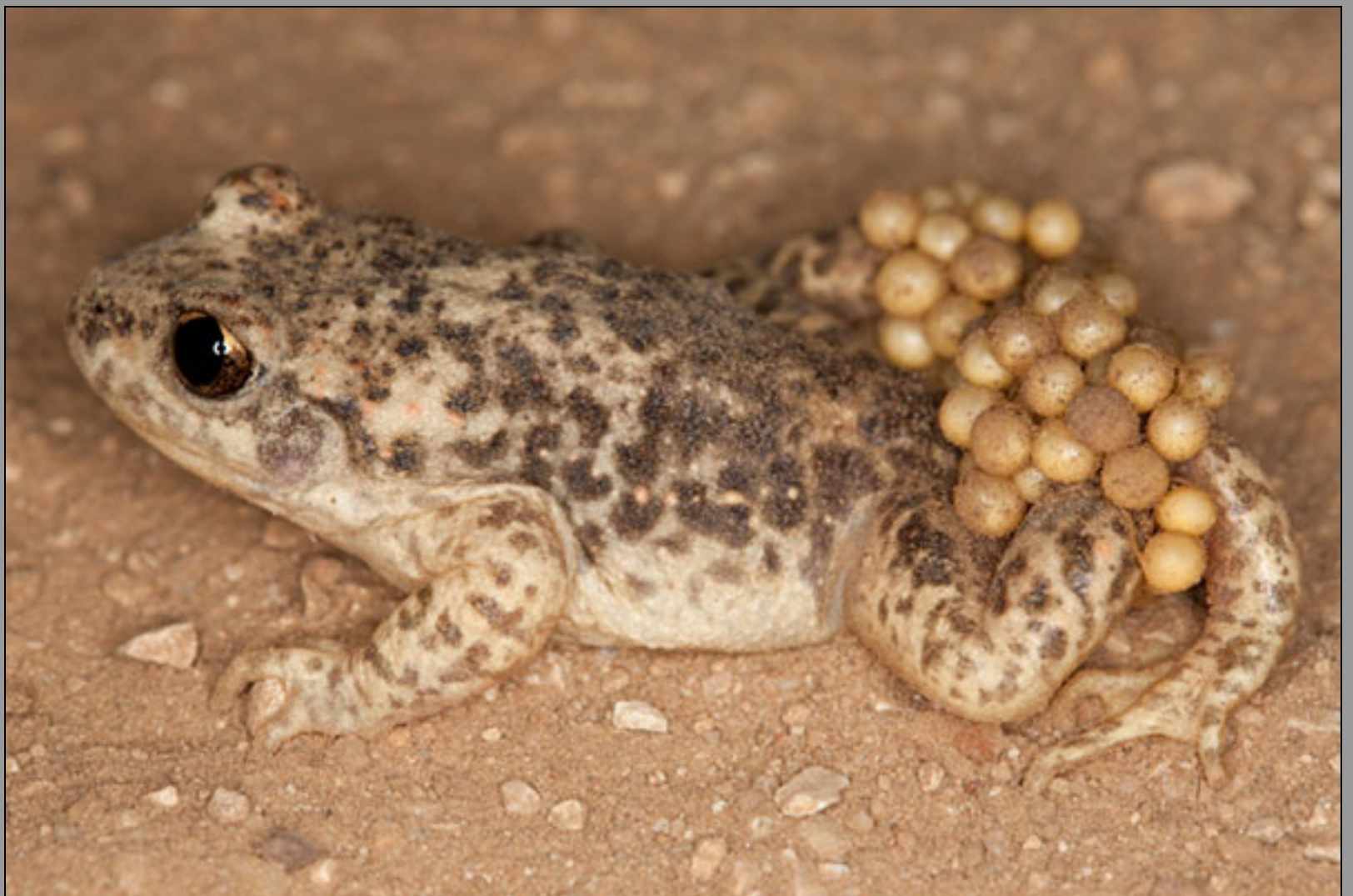
Alytes obstetricans pertinax