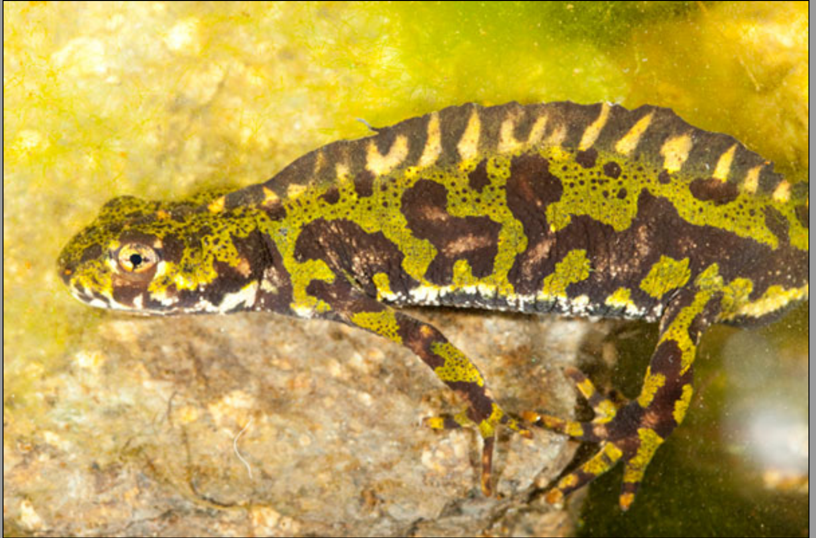
Triturus marmoratus , male