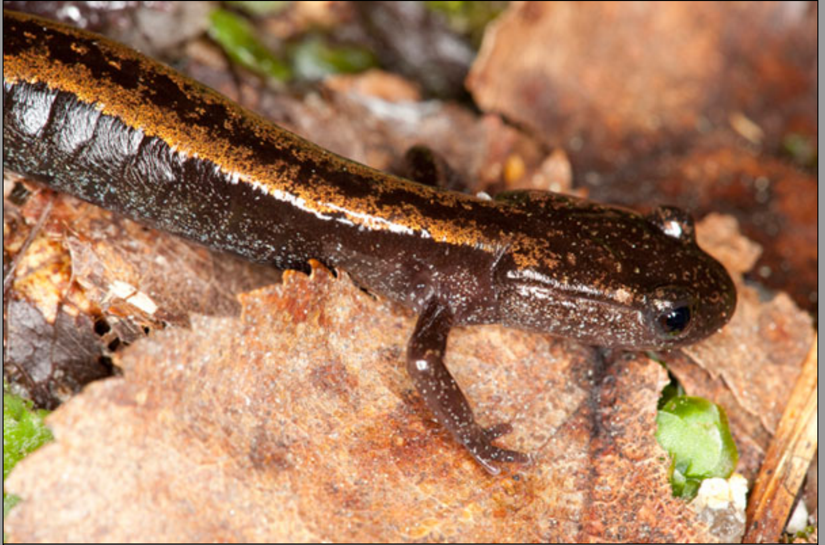
Chioglossa lusitanica longipes