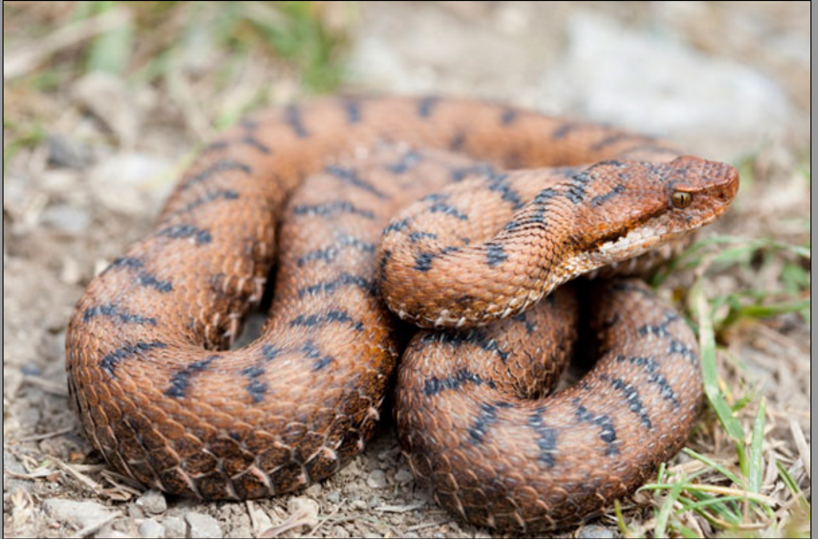
Vipera aspis aspis