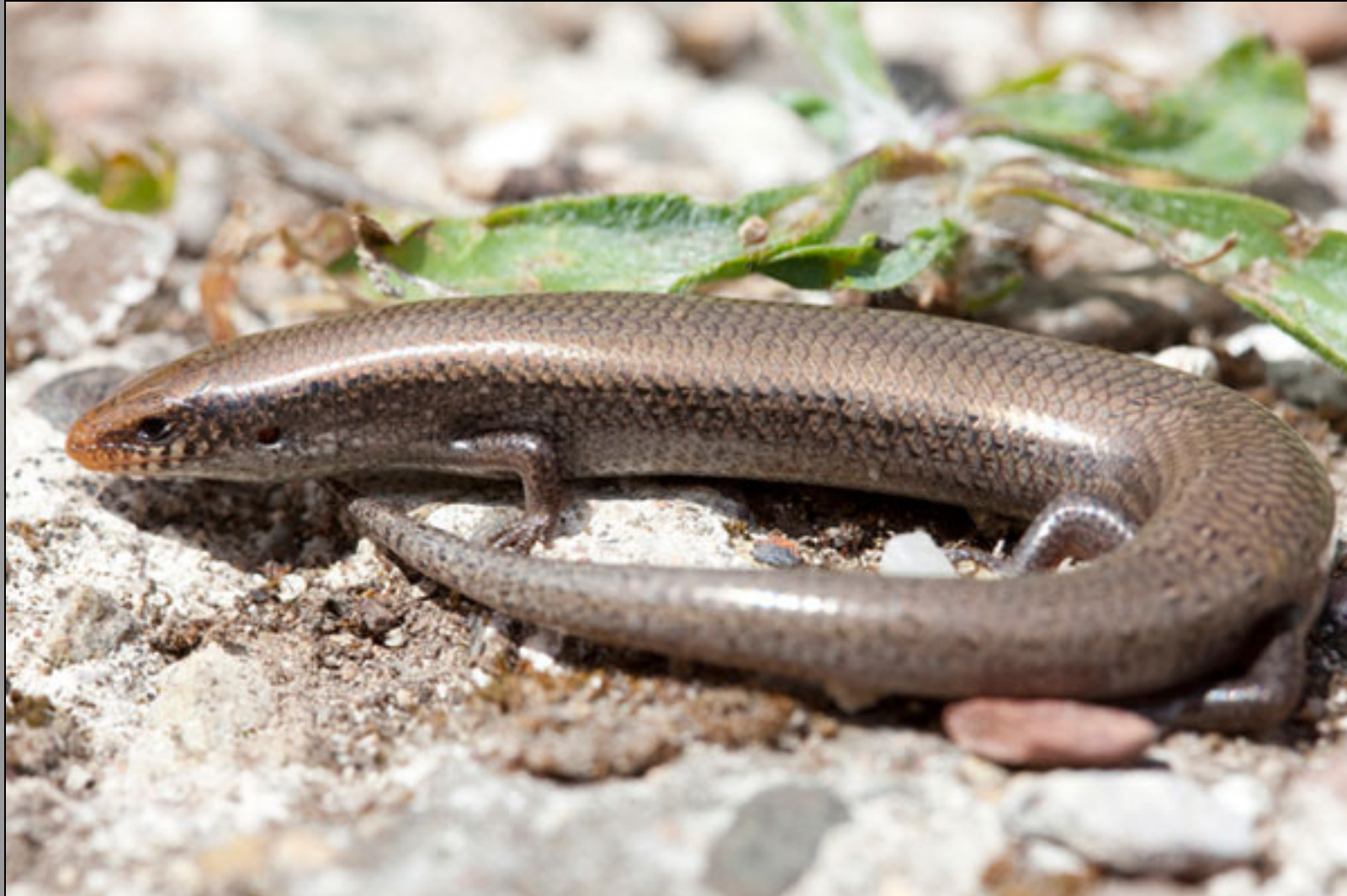
Chalcides bedriagae cobosi