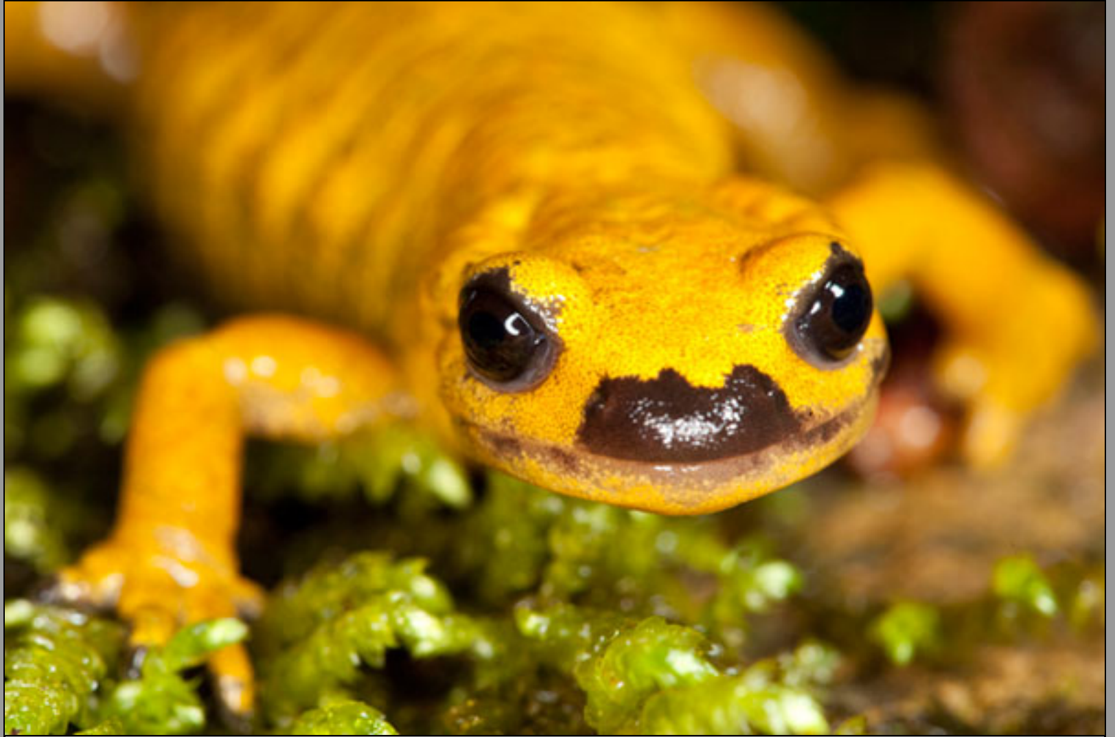
Salamandra salamandra bernardezi